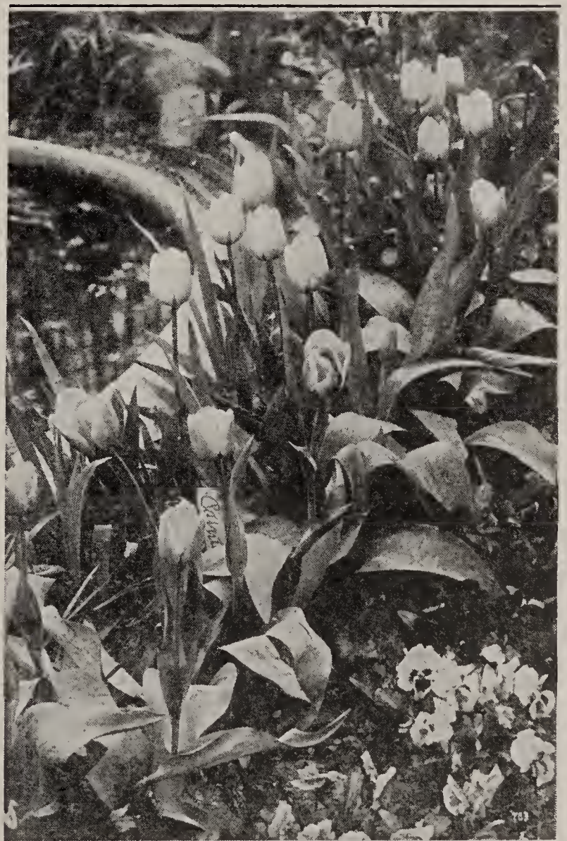
DARWIN TULIPS AND PANSIES

Choice Mixed 12 for 75c; 25 for $1.25; 100 for $500. A Tulip fancier's group of unique and artistic forms; brilliantly colored to introduce a bright splash of color. 16 in.