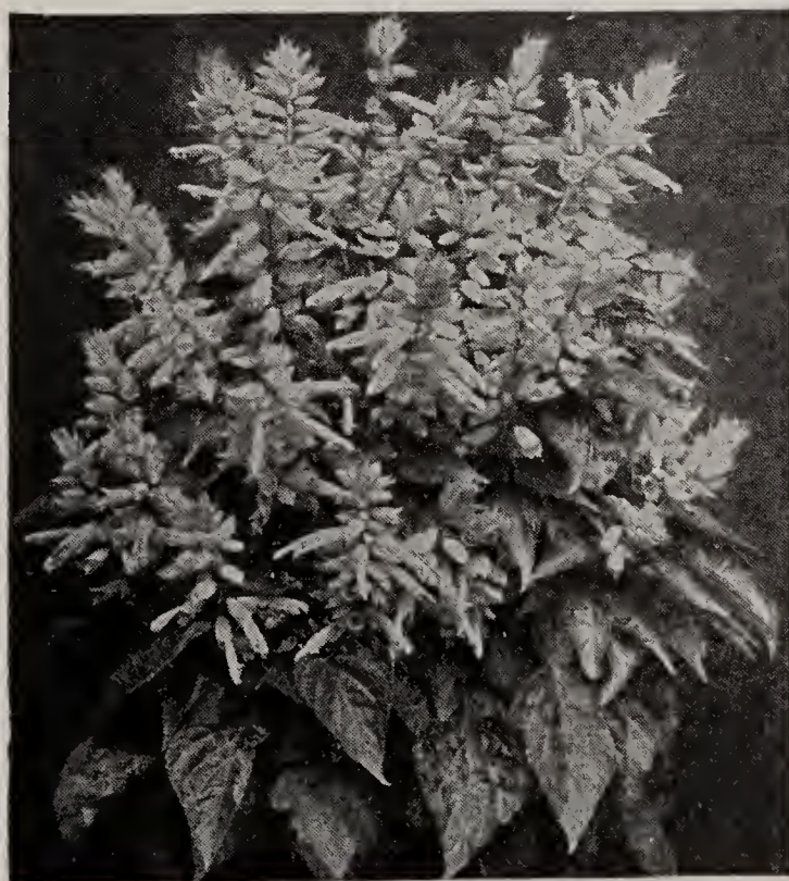
SALVIA SPLENDENS "HARBINGER"

We offer the very best grade of granulated peat, odorless and clean, free of weed seeds and fungus. Especially desirable because it breaks up so easily. Indispensable as component part of all soil mixtures and composts, displacing leaf mold because of its freedom from fungus and weed seeds. Use half and half with soil as a top dressing for lawns. A perfect mulch in the garden bed to retain moisture and prevent crusting of adobe soil. Recommended as planting medium for all acid loving plants such as Rhododendrons, Azaleas, Heathers, etc. 1 bale sufficient to cover approximately 300 square feet of garden or lawn area, 1 inch deep. 10 lbs., 60c. Gunny-sack full, $1.00; ½-bale, $1.75; 1 bale, $3.00. Charges collect. (Prices unstable. Kindly verify when ordering.)