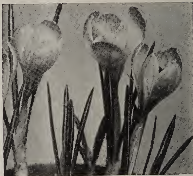
SPRING FLOWERING CROCUS