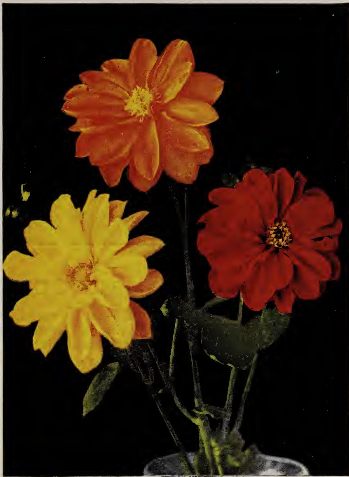
Unwin Dwarf Bedding Dahlias—See page 17