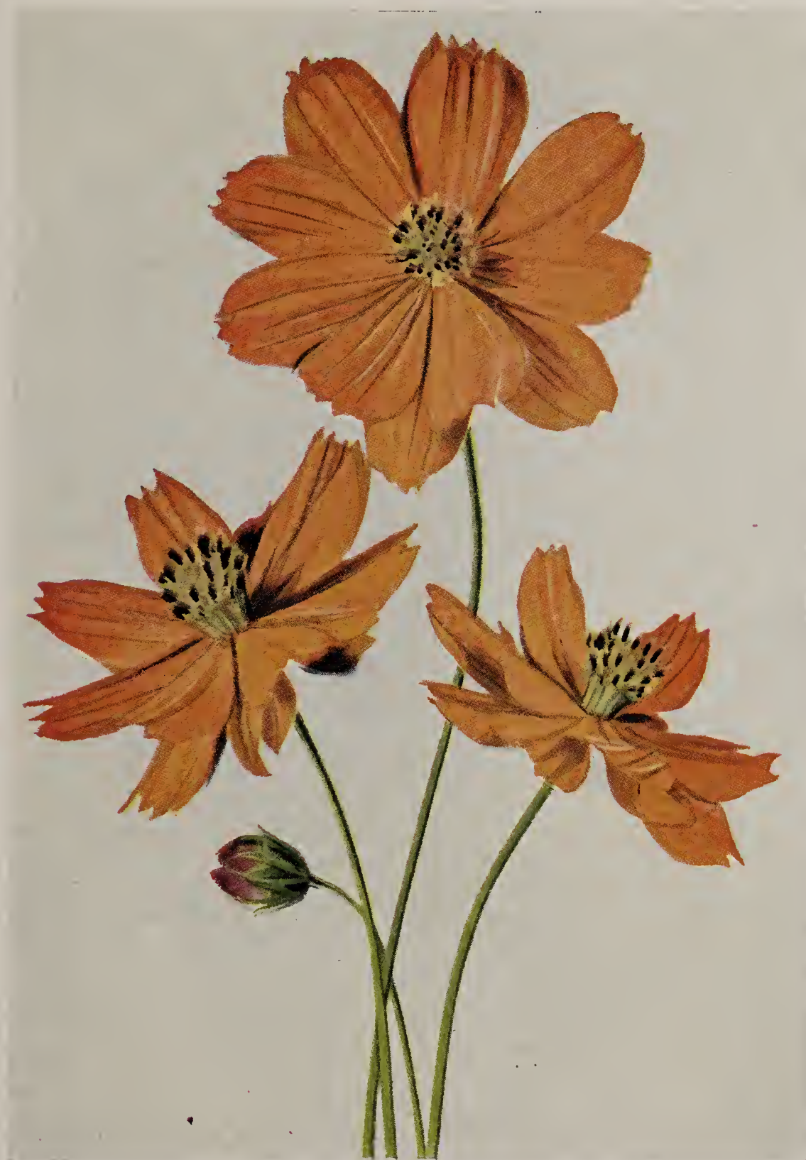
COSMOS EARLY KLONDYKE ORANGE FLARE All-American for 1935

Lupines Giant King Marigold Yellow Supreme Marigolds—Large flowering dwarf Primrose Queen and Golden Queen Nasturtium—Gleam Hybrids, Double—Scarlet Gleam Petunia—(Balcony) Blue Wonder Petunia—Pink Pearl Schizanthus—New Sunset Hybrids