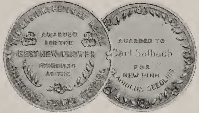
WON BY FESTIVAL QUEEN, 1933

The remaining varieties listed on this page are all fine, ranking just behind the specially recommended ones. Picardy, Salbach's Orchid, Grand Slam, and other outstanding gladiolus now selling at popular prices are found only in the general and quantity price lists, and in special collections.