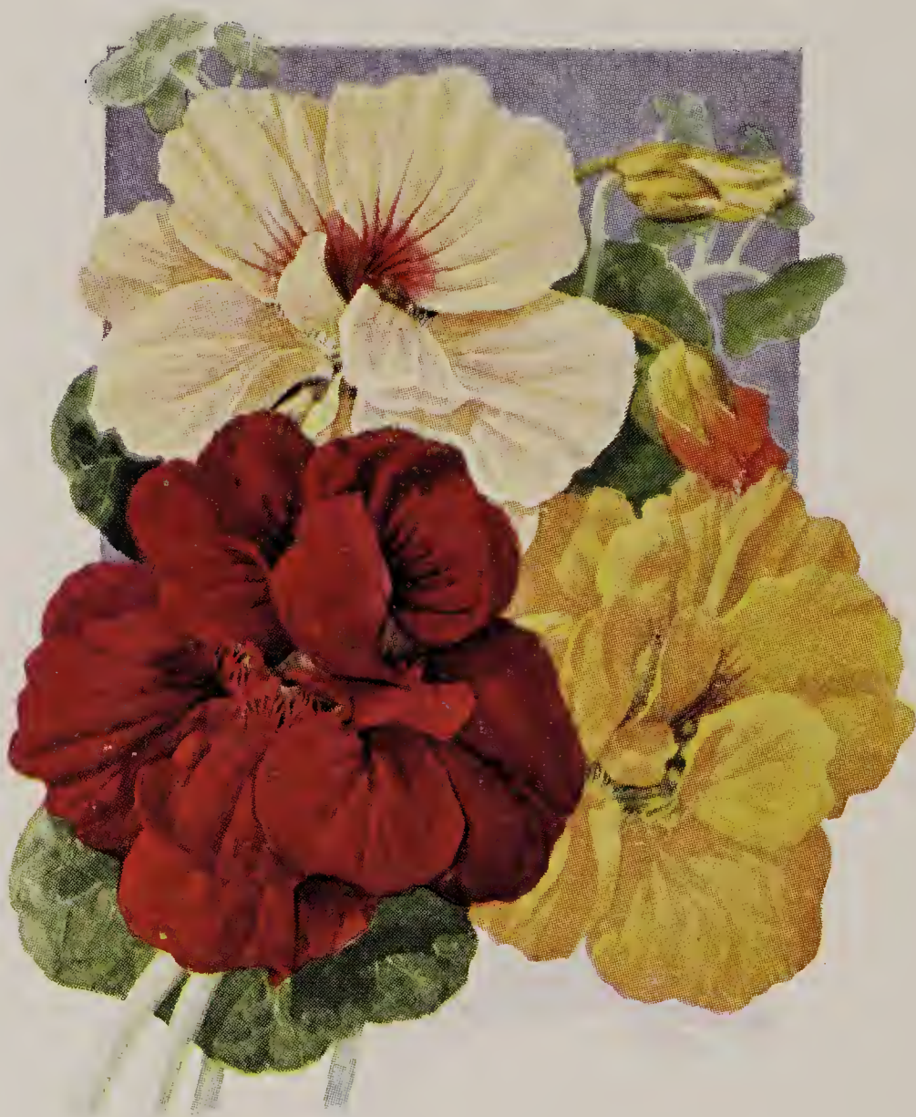
GLEAM HYBRID DOUBLE NASTURTIUMS

We offer selected seed specialties for your garden—not just quality seeds—but the finest of the best and newest varieties that can be had. We do not attempt to stock a complete line of seeds, but limit ourselves to the most outstanding strains and novelties.