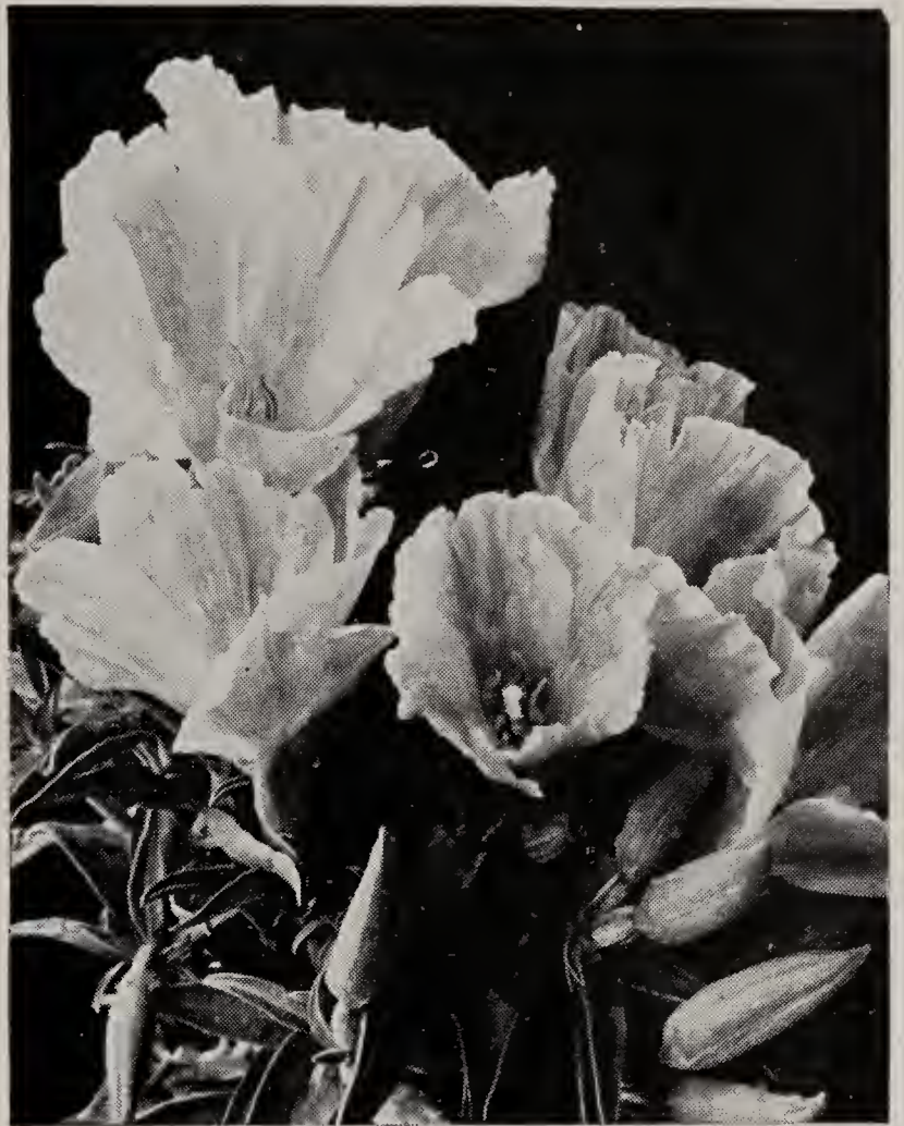
GODETIA, SYBIL SHERWOOD

DELPHINIUM, Dwarf or Chinensis. One of the most effective plants possible for small