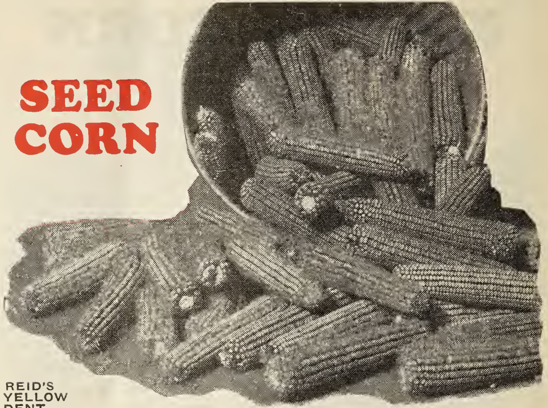
REID'S YELLOW DENT

Corn has repeatedly demonstrated its value as a sure crop; be sure to plant a good acreage next season and use only the reliable and tested Standard Brand. Seed Corn is a specialty with us. We handle practically all major varieties and every lot is tested after being shelled and before shipment.