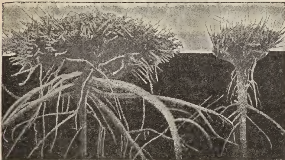
Roots of Grimm Alfalfa