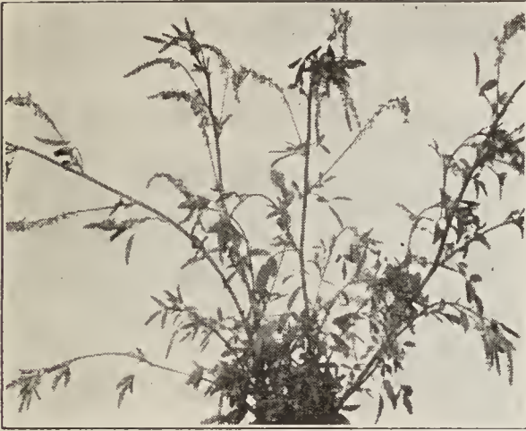
GRUNDY COUNTY SWEET CLOVER