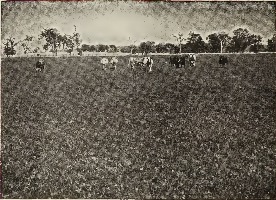
FIELD OF KOREAN LESPEDAZA

finest of all legumes for reclaiming worn out soil