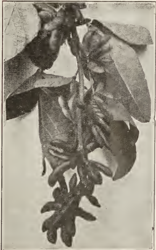
MANCHU SOY BEANS

Wilson. Commonly called "Black Wilson" because the seeds are pure black. Matures in about 120 days. Plants tall and slender, ideally suited for hay and widely grown for that purpose; also for ensilage, with corn, in the southern and eastern sections of the corn belt.