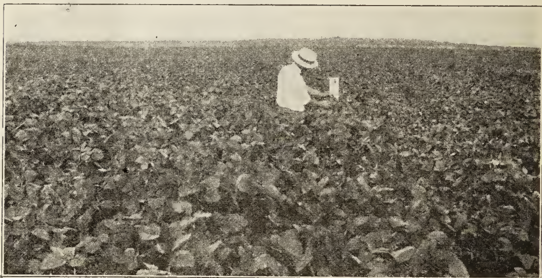
A FIELD OF SOY BEANS

Soy Beans fit into the rotation as a cultivated crop, a grain crop or a hay crop. As a cultivated crop, they are usually grown with corn, this combination making it possible to grow a legume for soil improvement on every acre every year, the corn and Soy Beans being followed by small grain with clover.