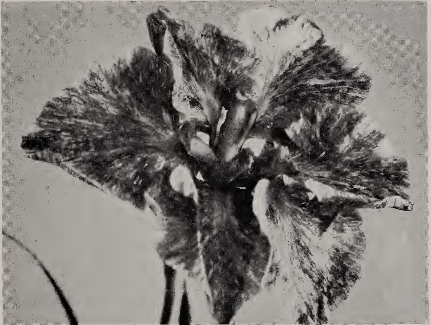
JAPANESE IRIS KALIKO

ONE of the loveliest flowers for the garden is Japanese Iris. They grow from twelve inches to around four feet, and the flowers vary from six inches to around ten and twelve in diameter but the very large ones often droop and do not give the effect of so great size. Many of them are perfectly flat and stay so.