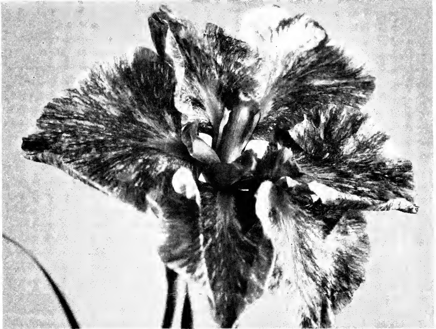
JAPANESE IRIS KALIKO

ONE of the loveliest flowers for the garden is Japanese Iris. They grow from twelve inches to around four feet, and the flowers vary from six inches to around ten and twelve in diameter but the very large ones often droop and do not give the effect of so great size. Many of them are perfectly flat and stay so.