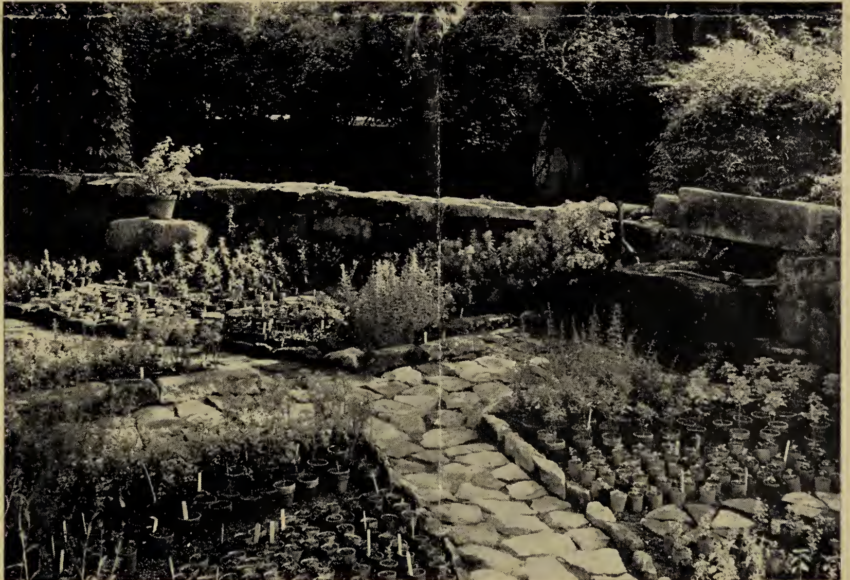
THE ATTRACTIVE HERB GARDEN RECENTLY DEVELOPED ON THE CATHEDRAL HILLSIDE, WHERE POTTED PLANTS ARE BEING SOLD FOR THE BENEFIT OF THE WORK OF THE GUILD