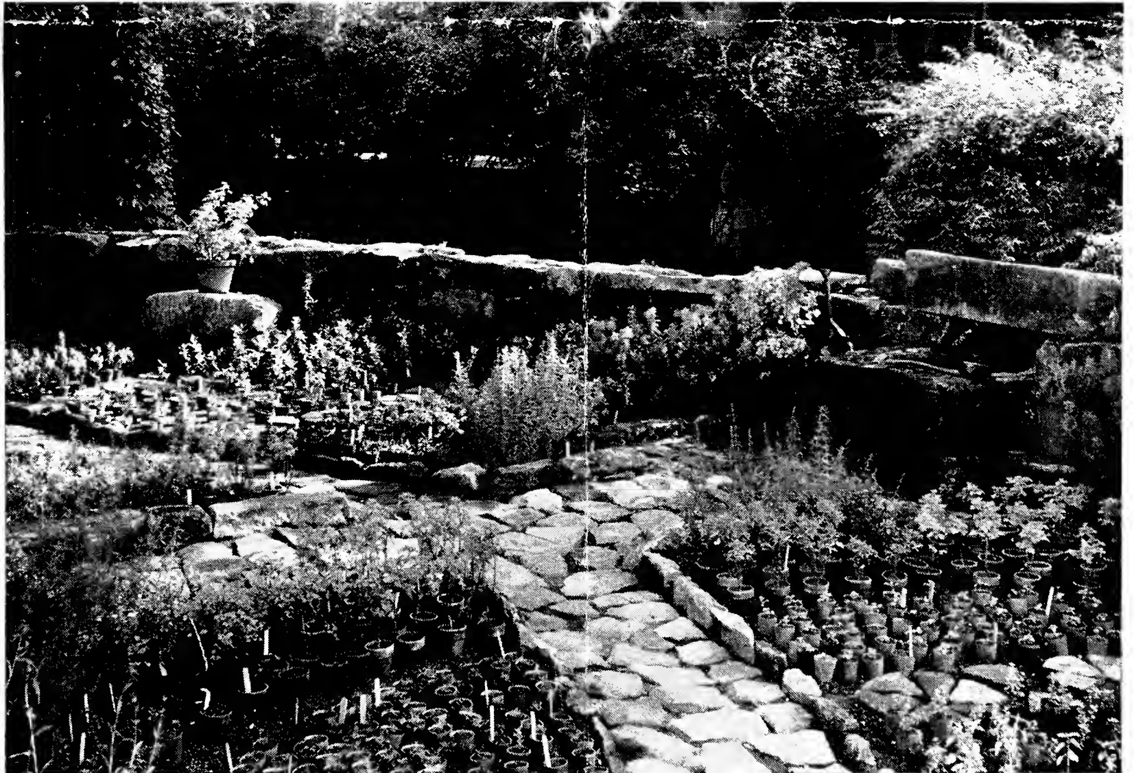
THE ATTRACTIVE HERB GARDEN RECENTLY DEVELOPED ON THE CATHEDRAL HILLSIDE, WHERE POTTED PLANTS ARE BEING SOLD FOR THE BENEFIT OF THE WORK OF THE GUILD