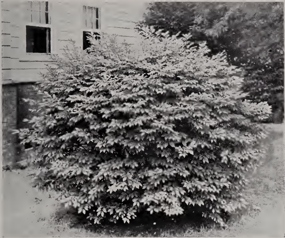
Euonymus Alatus Compacta