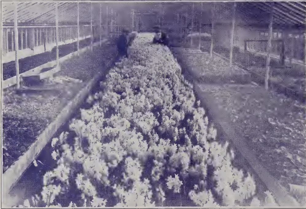
Texas-grown Paper White Narcissus Bulbs in Bloom in Cincinnati Greenhouse.

For Early Greenhouse Forcing and Retail Sale (In water; bowls; with pebbles, etc.)