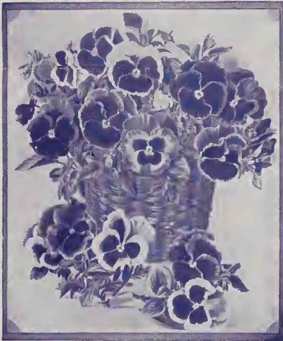
A. B. C. "De Luxe" Pansies (One-sixth natural size)

"De Luxe" Mixture will satisfy your critical trade both as to size and variation of coloring. Truly the "last word" in Pansy mixtures.