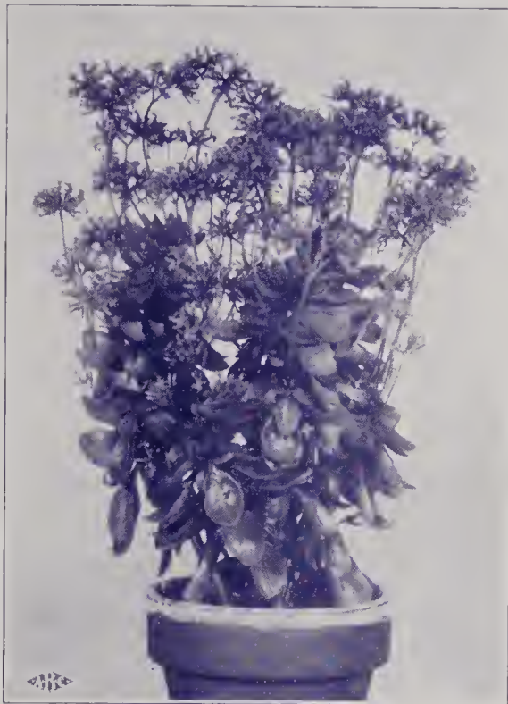
Kalanchoe Globulifera Coccinea