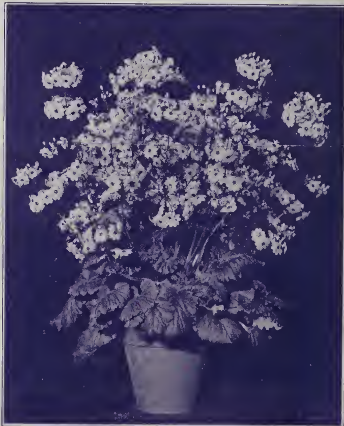
The New Primula Malacoides "Eriksonii"

Grandiflora Lilac or White. Tr. Pkt.....50c