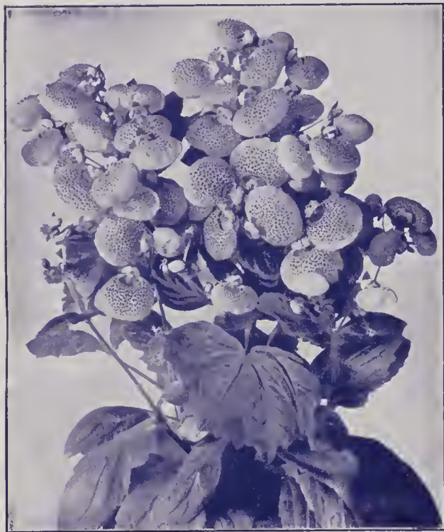
Calceolaria Hybrid—"Multiflora Nana" This dwarf small flowered strain is now in the greatest favor—Provides ready selling pot plants.

Modern fashion often prefers small and richly flowering plants to those with larger blooms—Cineraria Nana Multiflora swept all before it and there is no reason why Calceolaria Multiflora should not do likewise. The average size of the blooms is only 1½ inches, but the amount of flowers produced is unsurpassed. The color scheme is extraordinarily gay and full of contrast. The yellow shades—lemon, gold, orange are adorned with fine brown spots; the brown, orange-copper, copper-brown, copper-scarlet, crimson, scarlet are very striking. An assorted group of these shades is most effective, while a single specimen, 10 to 12 inches high, makes an ideal market plant.