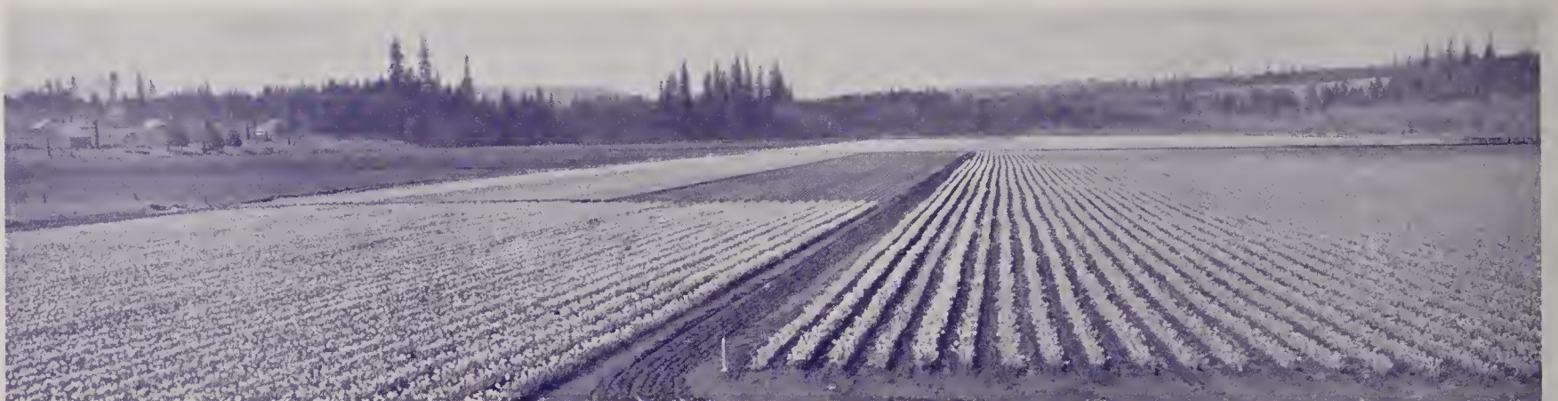
Above illustration shows, in part, over one hundred acres in Oregon devoted to the production of King Alfred Narcissus for The American Bulb Co., Chicago and New York.

In 1932 we had the finest and largest crop of Paper-Whites ever produced in America. More than 2,500,000 bulbs were delivered to the florists and dealers of America. The praise we received from the customers who received these bulbs is still ringing in our ears. 1935 has been kind to us to give us the same crop. Plenty of large bulbs measuring 15, 16 and 17 ctm. and some over, all single nose with one center shoot. We have sent samples to our Canadian customers and they prefer them now to the French grown, although Canada can still import. We challenge the world to produce a quality of Paper-Whites equal to that produced this season in Texas of our Lone Star Brand. Every case marked "Lone Star Brand" for your identification. More than 1,500,000 already sold to our customers. We are still booking orders.