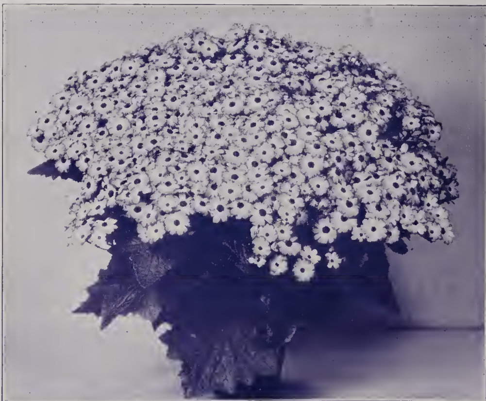
Specimen 7-inch Pot of Cremer's First-Prize Cinerarias A Most Valuable New Introduction

Prices: Tr. Pkt. .... $1.50 1/32 oz. .... $4.50 1/16 oz. .... $8.00