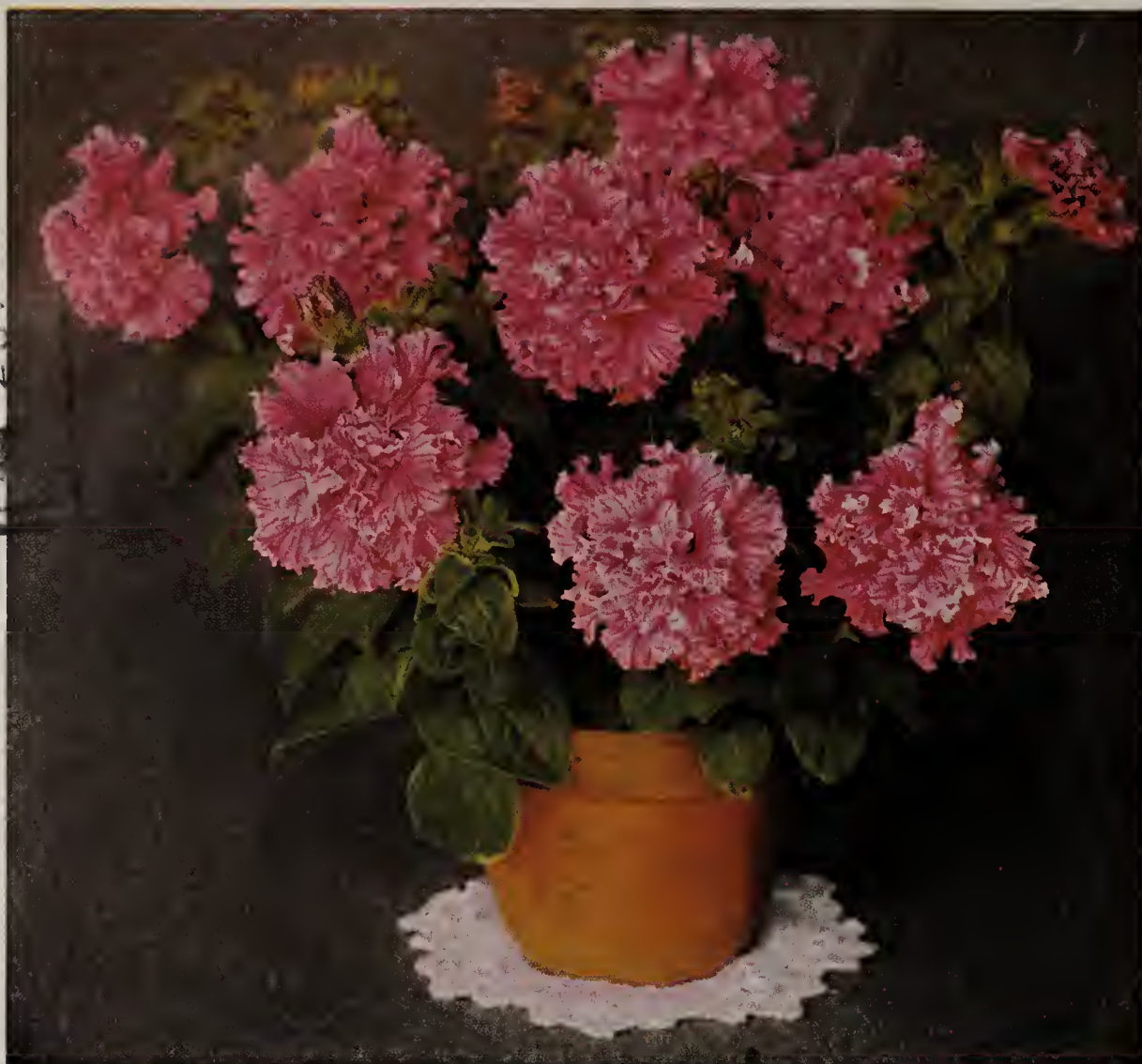
New Double Flowering Fringed Petunia, "World Beauty" Named and Introduced by the American Bulb Company