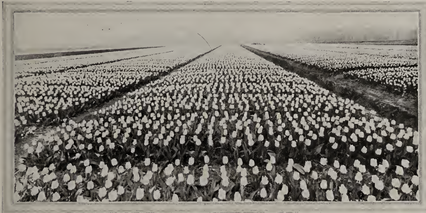
A Field of Darwin Tulips in Holland