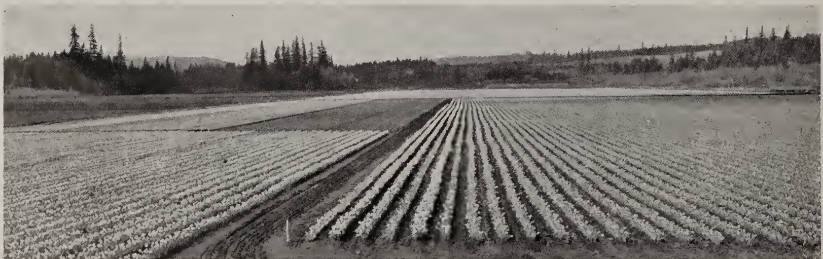
Above illustration shows, in part, over one hundred acres in Oregon devoted to the production of King Alfred Narcissus for The American Bulb Co., Chicago and New York.

NOTE: —We guarantee that no flowers are cut for commercial or private use—full strength of stem and foliage being allowed to go into the bulb for reproduction.