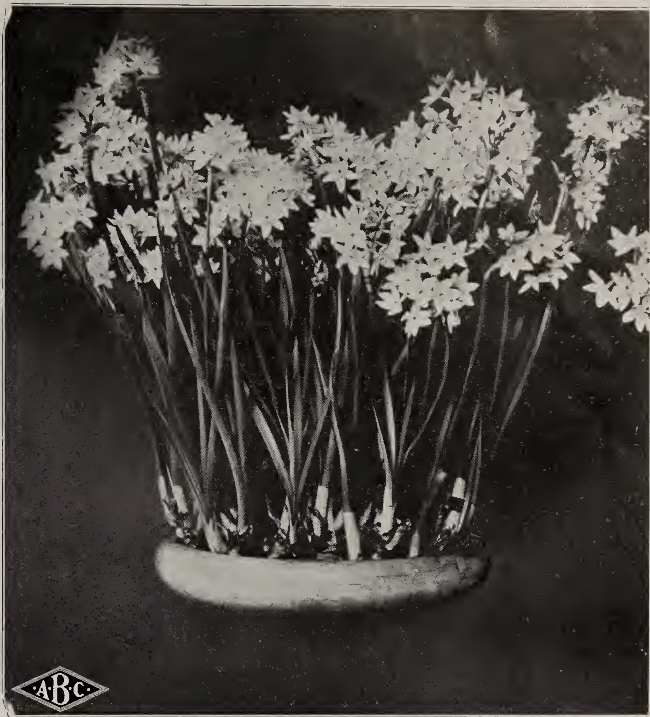
Narcissus, Paper White Grandiflora, Growing in Pebbles and Water

Hold about 1 lb. of chips—printed in bright colors—a cellophane window—very attractive. Any quantity .....Each 1½c