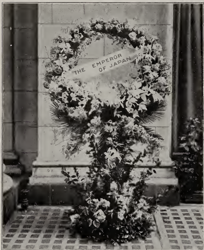
"The Aristocrat of Lilies"

Lilies work so wonderfully well into a great variety of basket designs that it will pay you to have a good planting of several varieties, we believe. Please write for prices on those varieties not quoted.