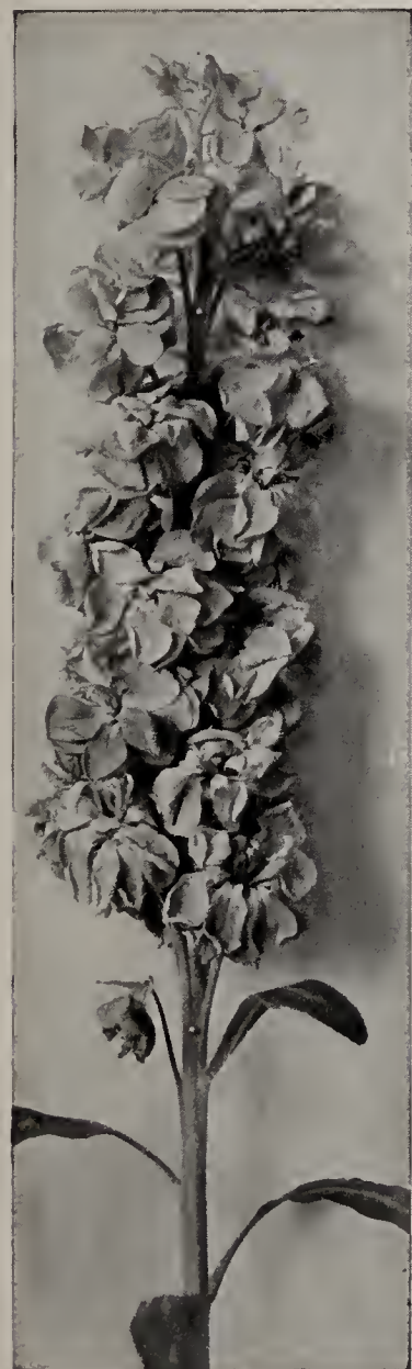
Stocks, Ball Non-Branching or Column

Tr. Pkt.....$1.00 1/8 oz.....$1.50 1/4 oz. ....$2.75 Oz.....$10.00