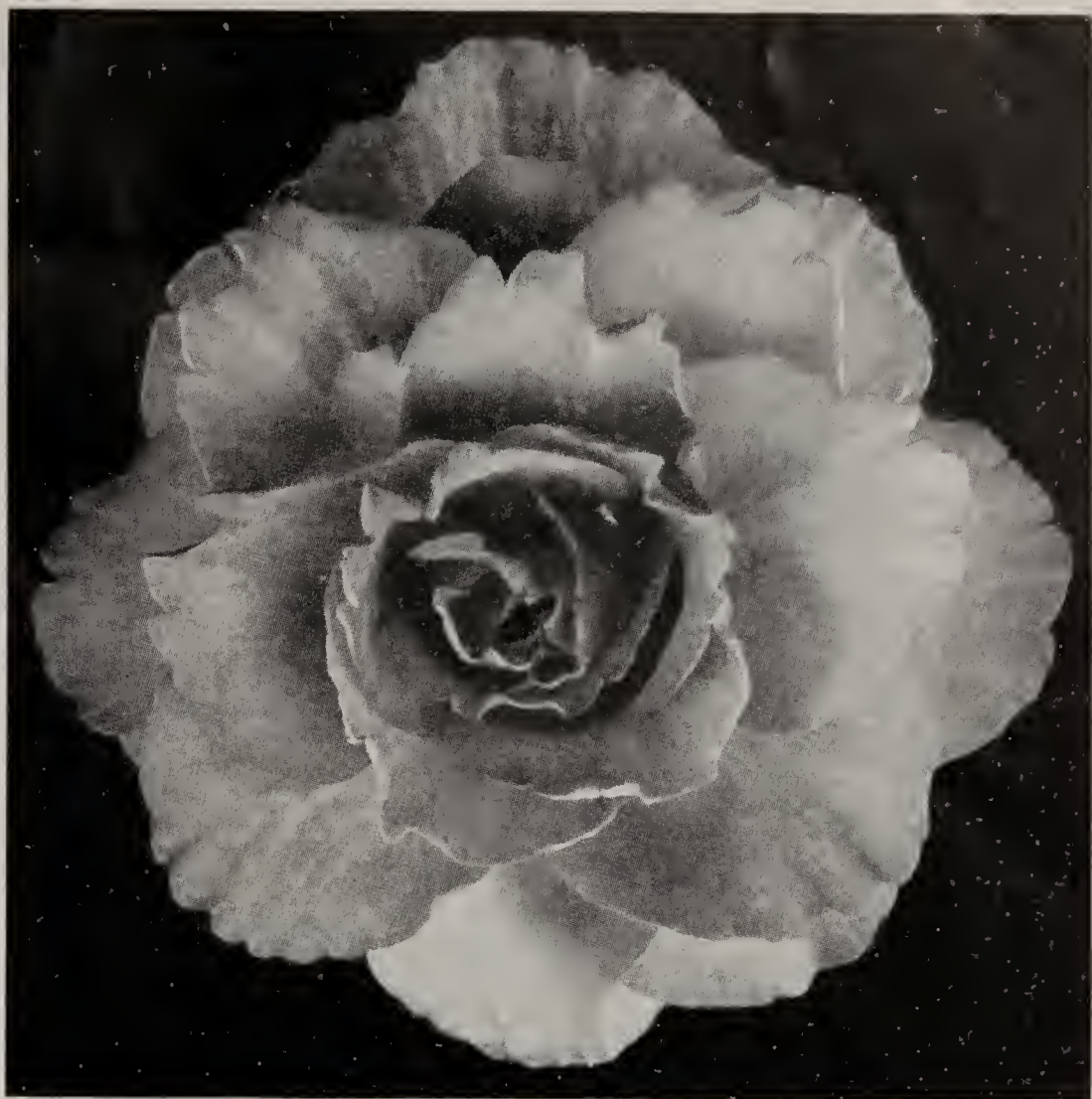
Double Flowered Tuberous Rooted Begonia