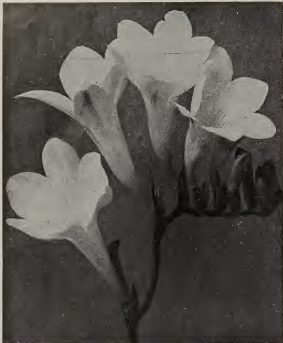
Freesias, A. B. C. Imp. "Parity Superflora"