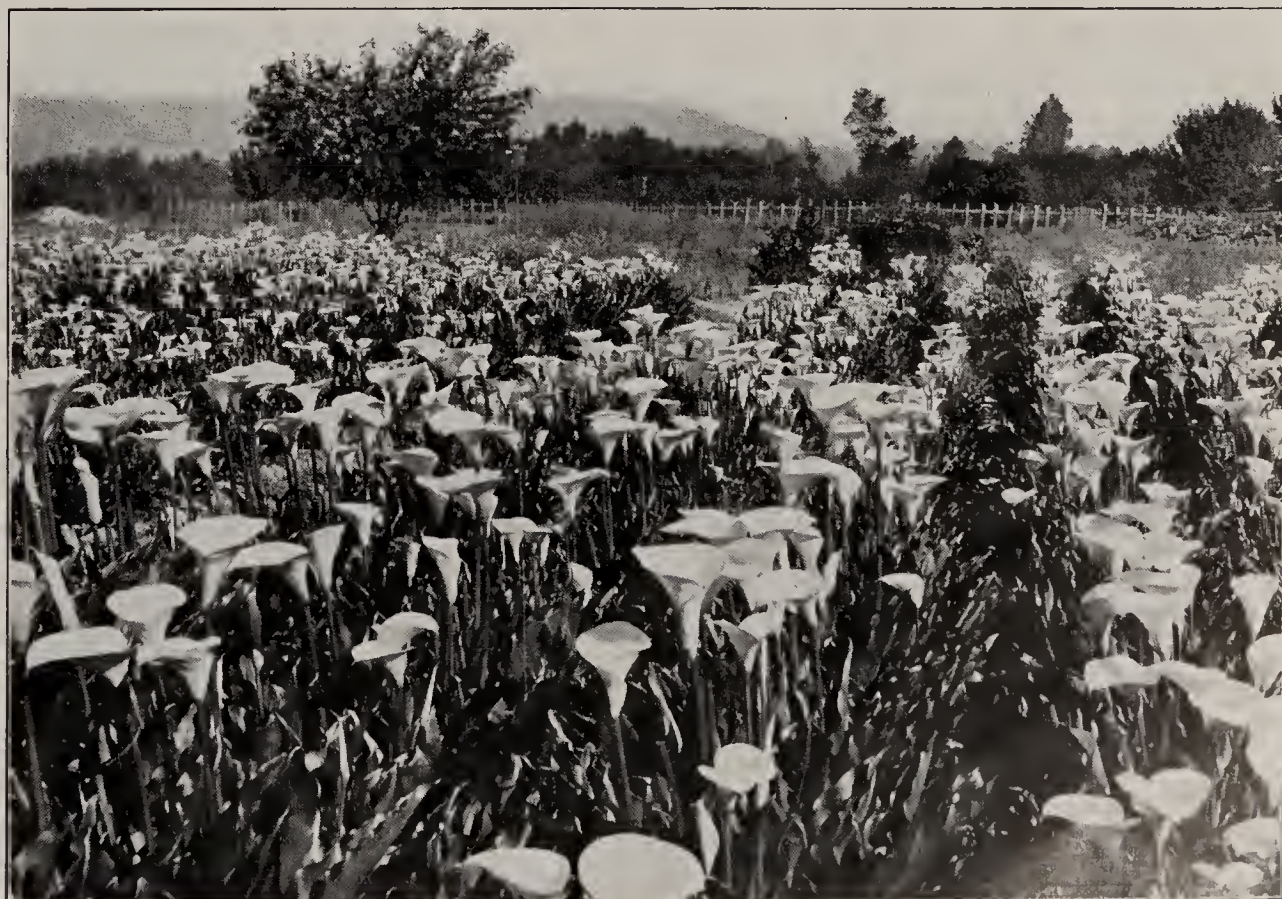
A Field of Callas Grown for American Bulb Co., Showing Healthy Condition of Bulbs