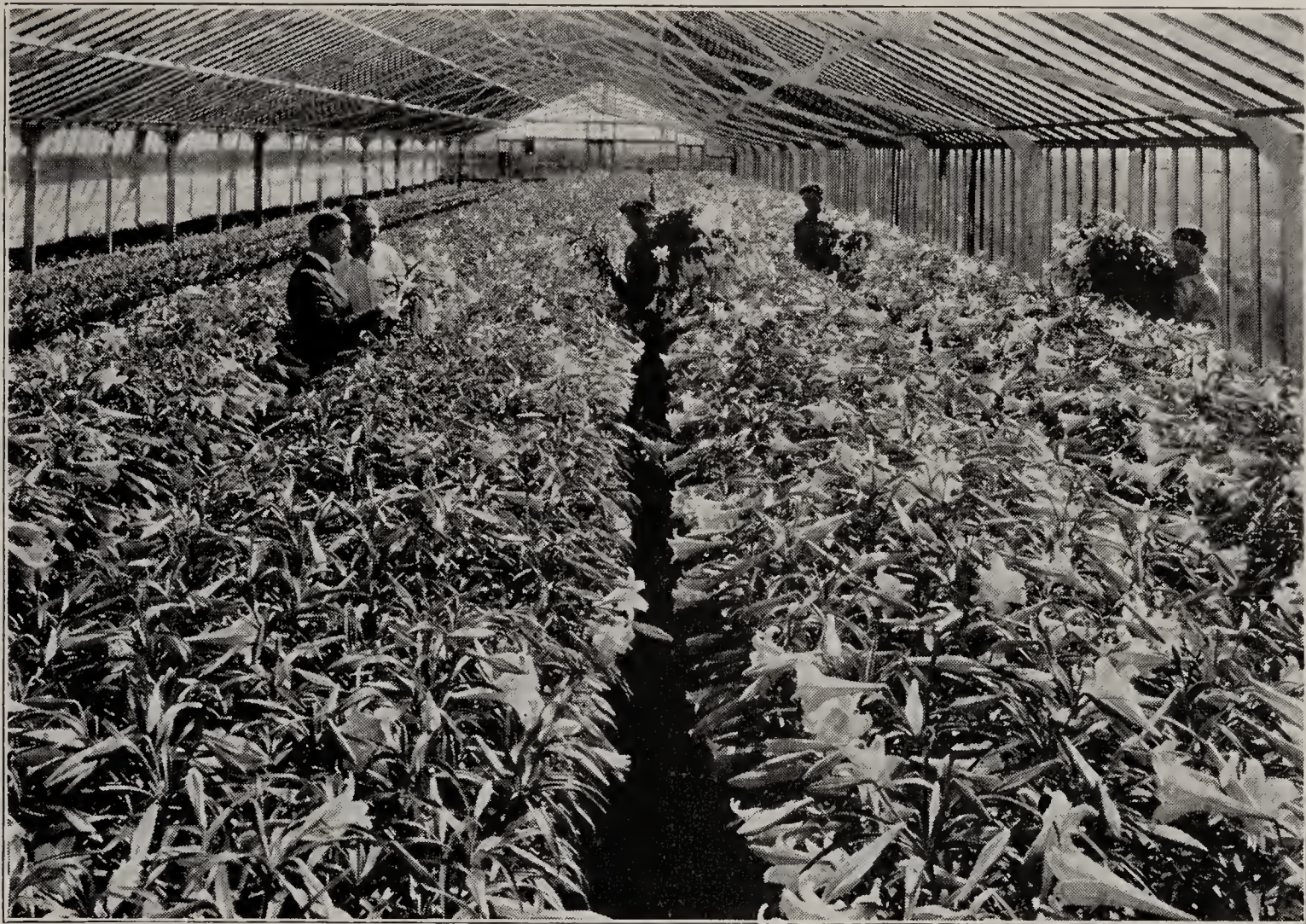
HOUSE OF LILIES PRODUCED FROM A. B. C. BULBS

The fact that we have consistently supplied from year to year and for many seasons past, numerous of the largest Lily growers in this country and Canada, is indicative, we believe, that A. B. C. "Supreme" Quality Lily Bulbs have obtained an enviable reputation amongst the trade.