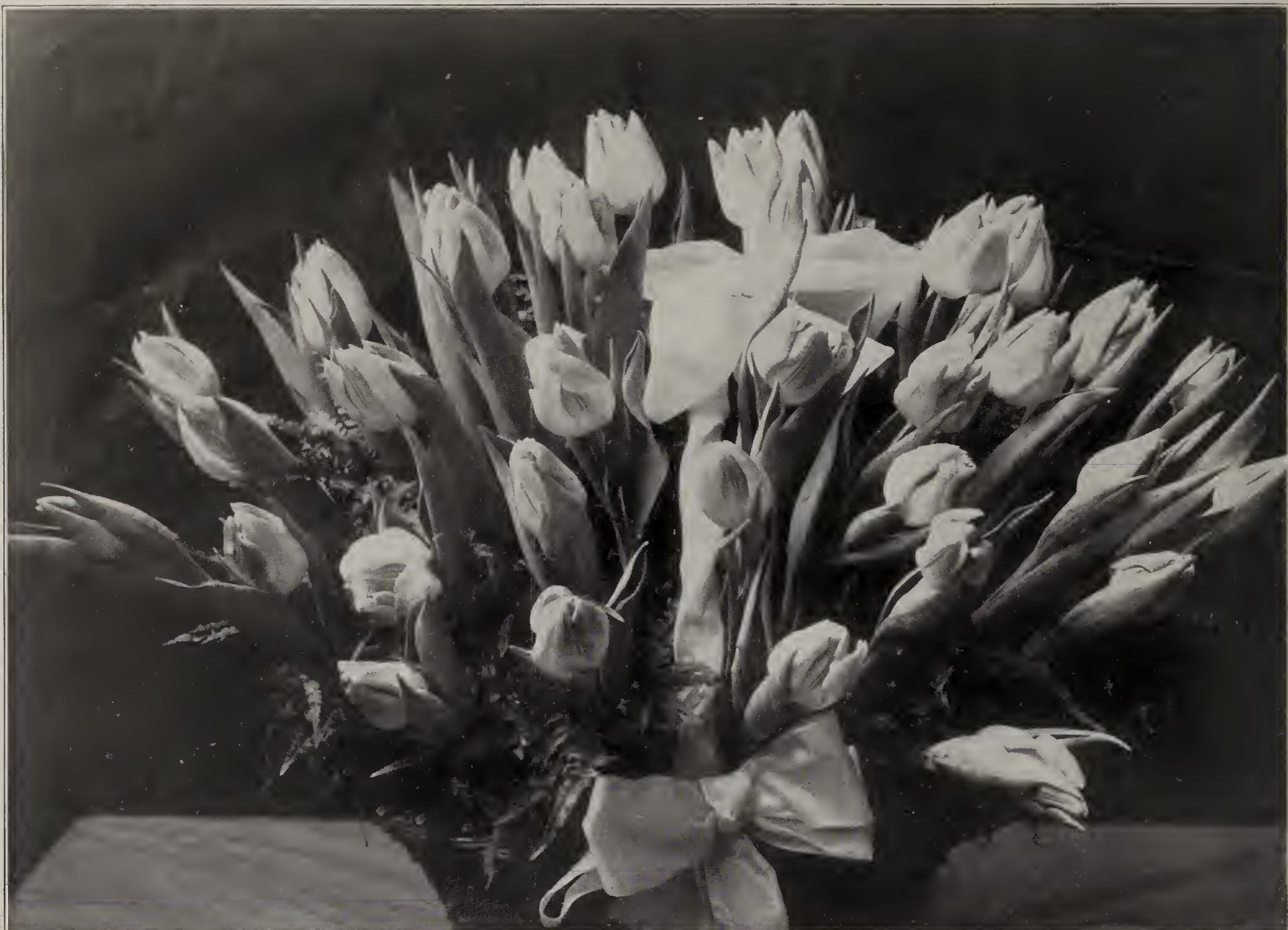
Early Flowering Tulips Provide Desirable Cut Flowers and Pot Plants.