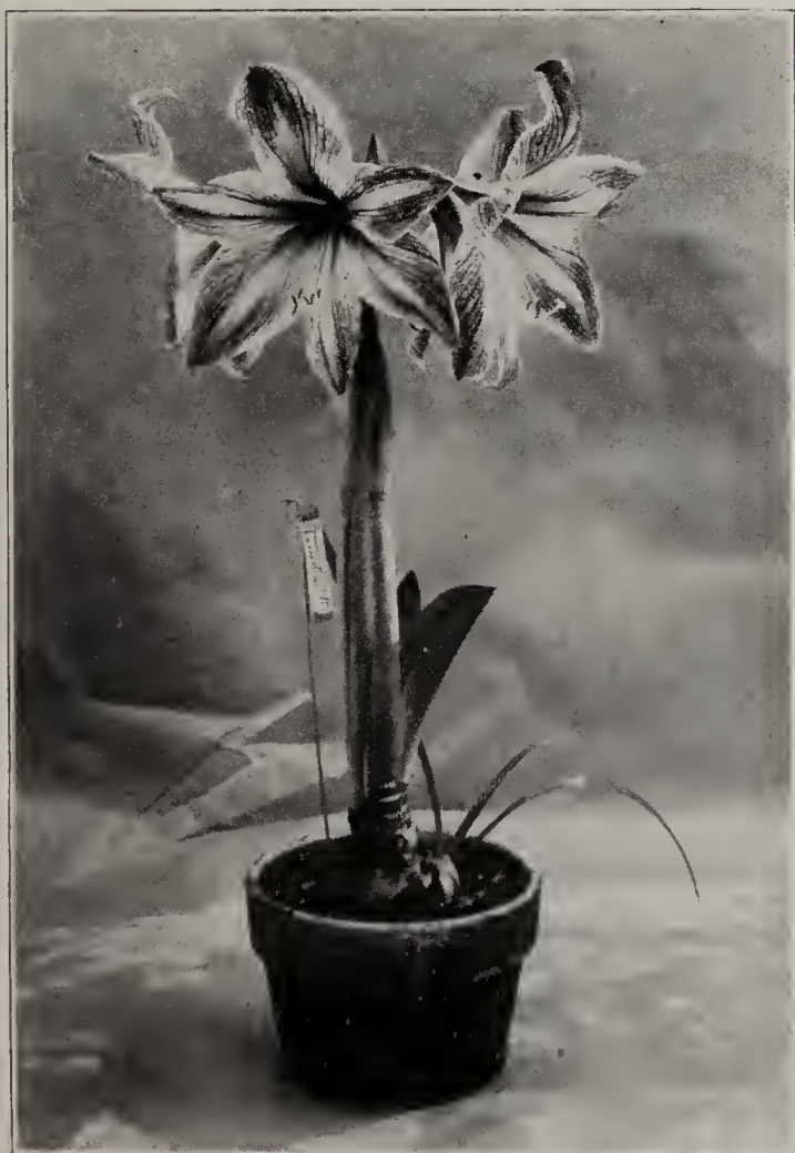
Amaryllis, Giant American Hybrid

Florists on the West Coast recently found a profitable outlet for Double Tuberous Begonia blooms by utilizing them for corsages and table decoration (the stems being wired.) This new fashion is now sweeping the country, the flowers commanding a price on a par with that of Orchids and Gardenias.