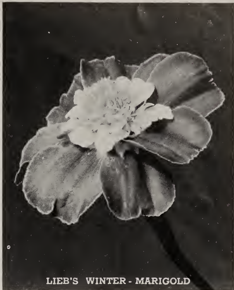
LIEB'S WINTER - MARIGOLD

This is another desirable Winter Flowering Marigold with long stems. Color: Golden yellow and mahogany. Tr. Pkt.....25c Oz.....75c