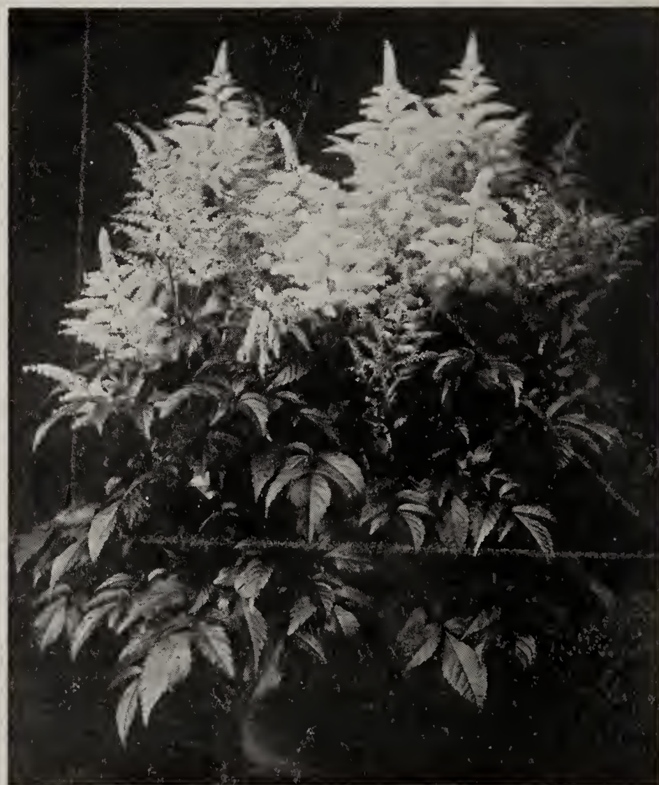
Forcing Spiraea (Astilbe)