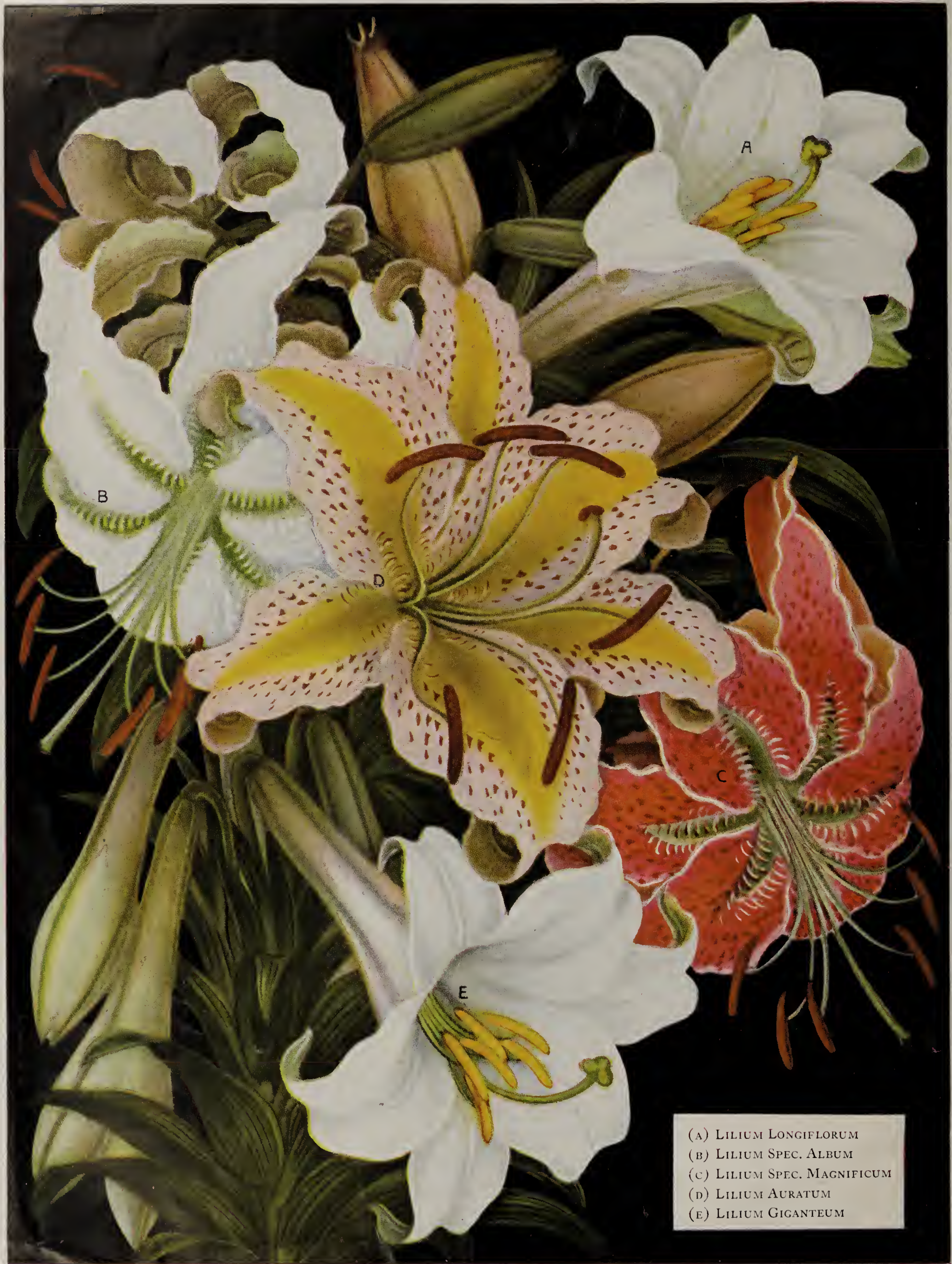
(A) LILIUM LONGIFLORUM (B) LILIUM SPEC. ALBUM (C) LILIUM SPEC. MAGNIFICUM (D) LILIUM AURATUM (E) LILIUM GIGANTEUM