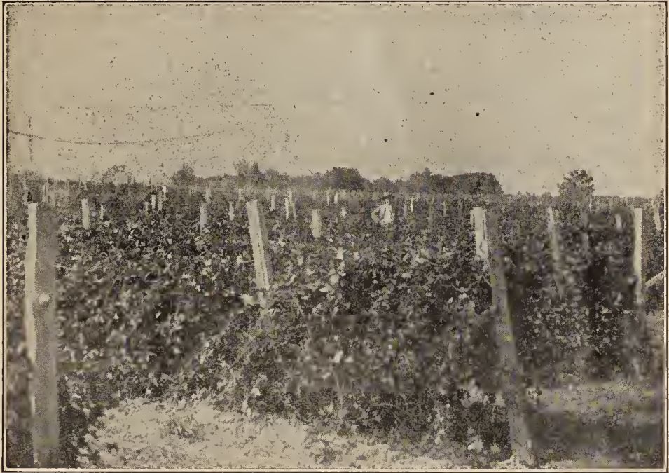
This Shows the Youngberry Vines Like They Look In The Spring

apart and setting them about five to six feet in the row. Should be set as early in the spring as possible although some set in the fall. As vines start to run, keep them trained along the rows so they will not be in the way of the plow. In winter place posts along the rows every ten feet and string two wires on to them, the first wire being about eighteen inches from the ground. In the early spring tie your vines up to the wires, stretching the vines out full length. One set of posts and wires will last the lifetime of the plants