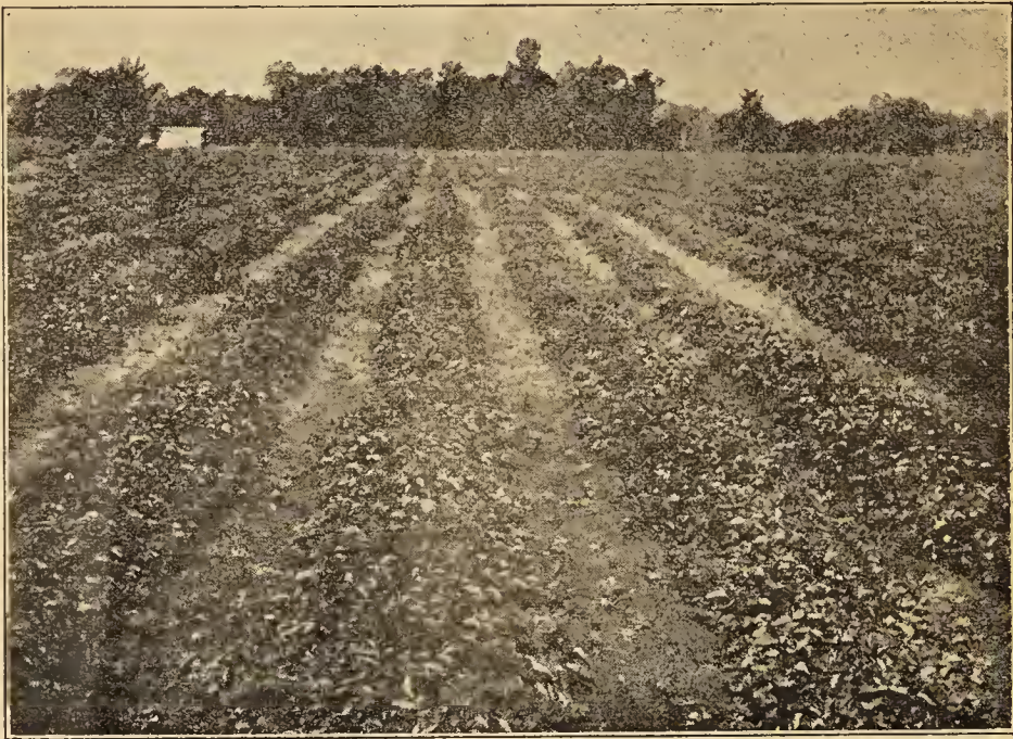
New Blakemore is a Good Plant Maker. We Like Them Fine

tion. But we will give a brief description of the way we grow them.