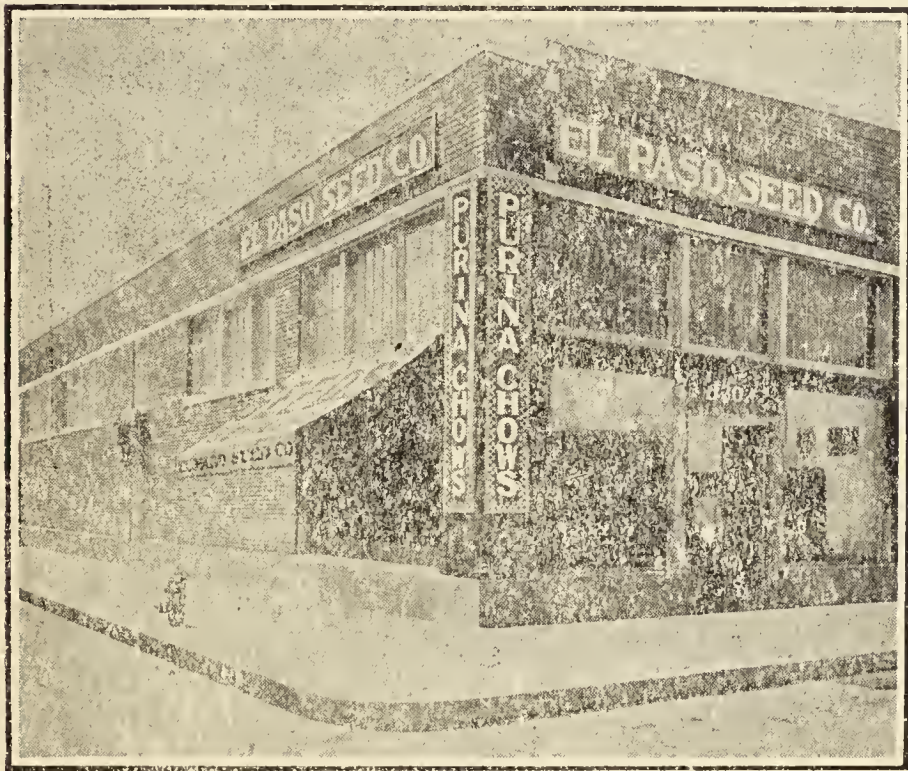
OUTSIDE VIEW OF OUR STORE DIRECTLY OPPOSITE THE CITY MARKET