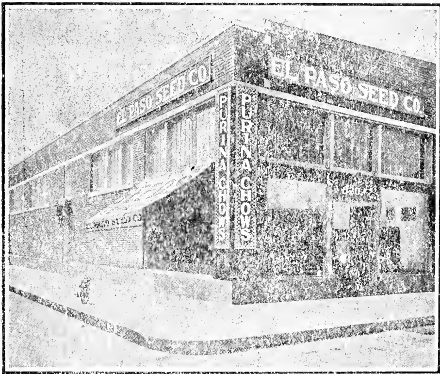
OUTSIDE VIEW OF OUR STORE DIRECTLY OPPOSITE THE CITY MARKET