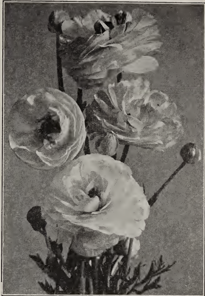
Florentine Hybrid Ranunculus