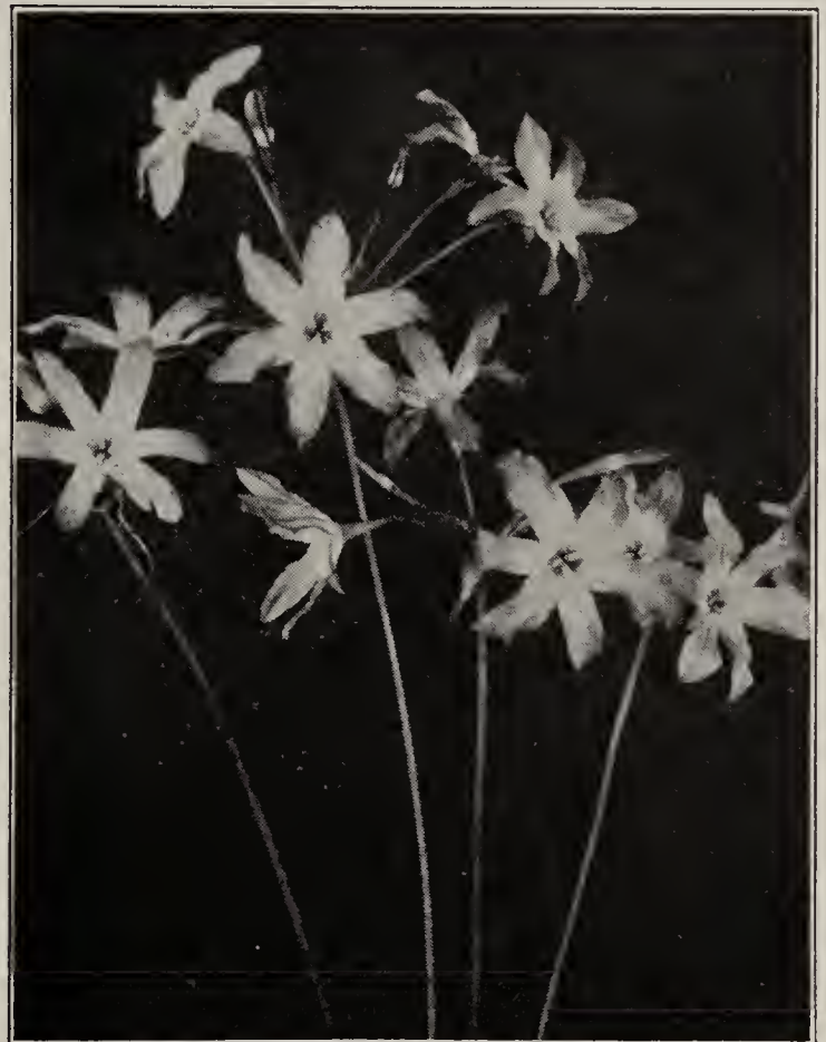
Leucocoryne Ixioides Odorata

Ixioides Odorata: Plant 3 to 4 inches deep as soon as the bulbs are available. Soil should be well prepared and fairly moist at the time of planting, after which further watering should not be necessary until the sprouts appear. After the blooming period water should be withheld for several weeks in the fall until the foliage has completely died down. Under favorable conditions they often bloom the first year. Top size, 30c each; $3.00 per doz.; $20.00 per 100.