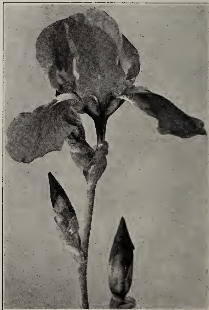
Hardy Iris, Santa Barbara

Collection of one each of the above 9 sorts for $4.00.