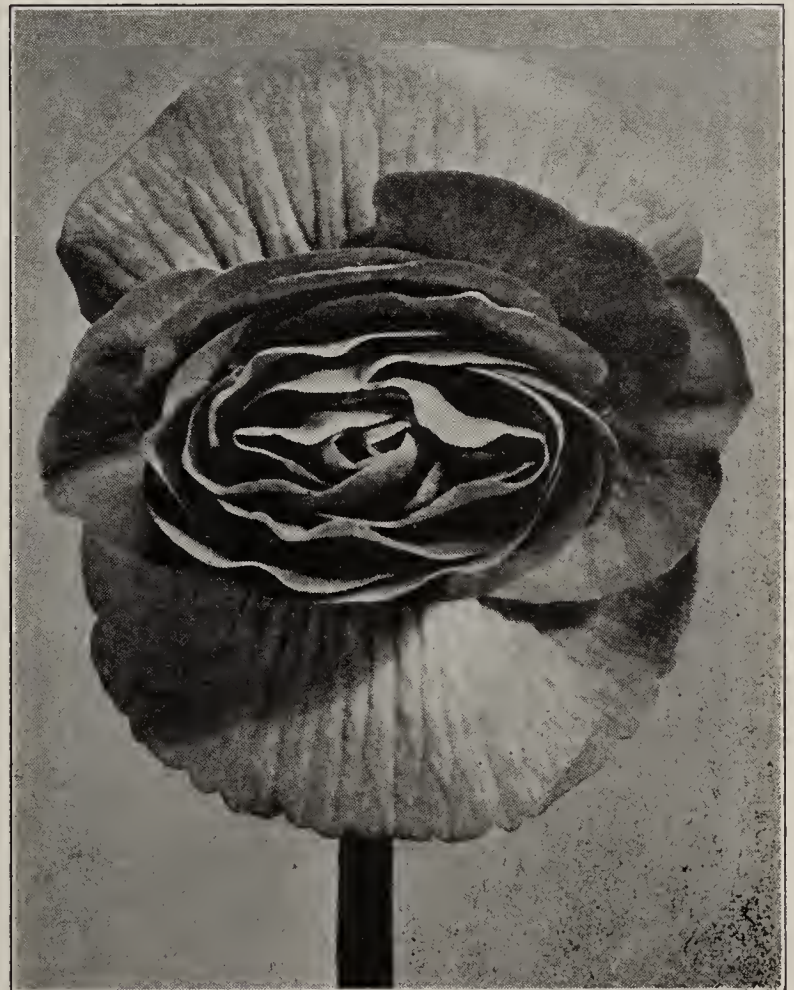
Tuberous Begonia, Double

Any of the above 6 at dozen rate; 50 at 100 rate.