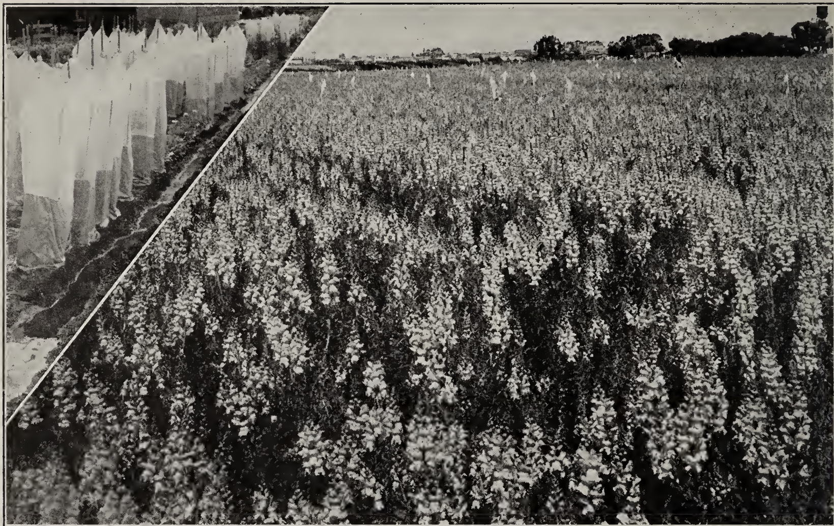
Rust Resistant Snapdragons growing for seed production. Inset shows method of handling individual plant selections.