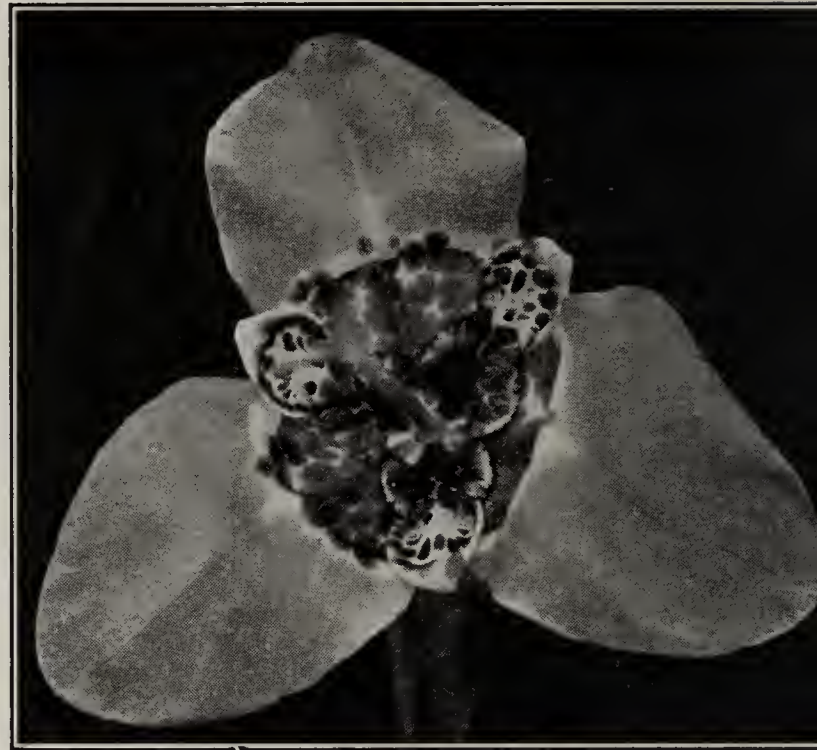
Tigridia (Tiger Flower)