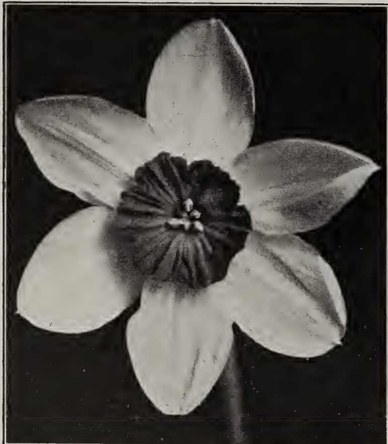
Bath's Flame Daffodil