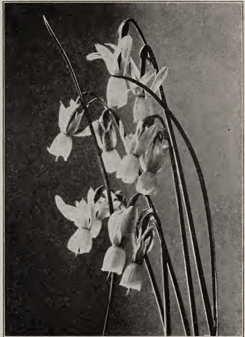
Angels' Tears Daffodils

Triandrus Albus (Angels' Tears). It is of slender growth and produces a cluster of elegant little creamy white flowers with globular cup and reflexing perianth as in the Cyclamen; height, 6 inches. Prefers gritty soil between the rocks and the bulbs should be left undisturbed to establish themselves. Plant 2 to 2½ inches deep. 20c each; $2.00 per doz.