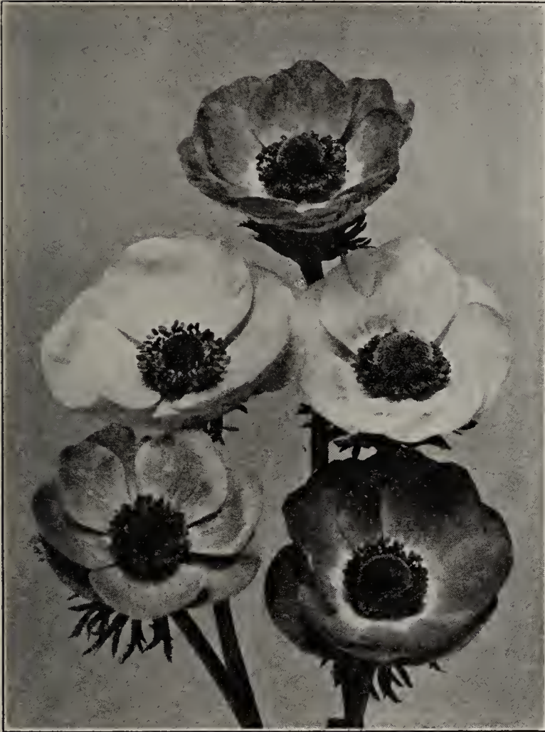
Anemone, Giant Single

25 of any one variety supplied at the 100 rate.