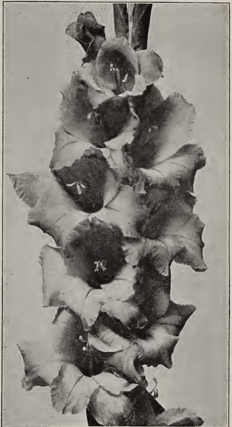
Gladiolus, Salbach's Pink