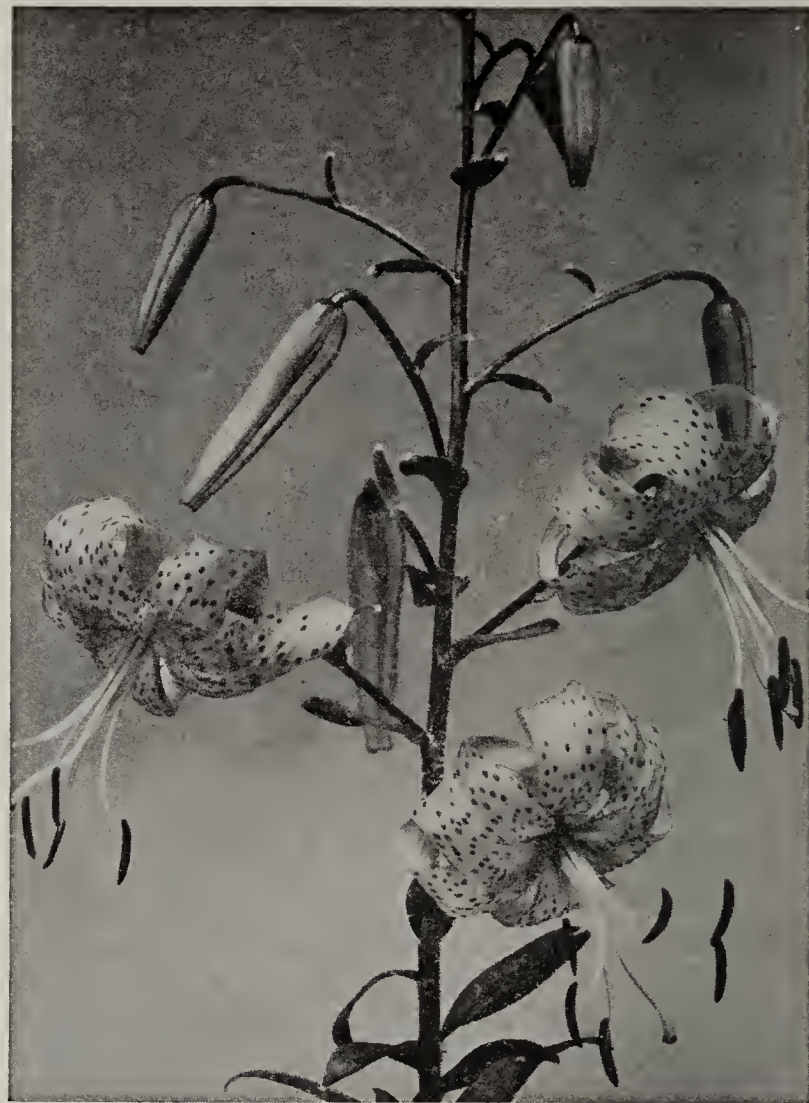
Lilium Tigrinum Giganteum

Longiflorum Giganteum (Japanese Easter Lily): A free flowering lily with pure white trumpet-shaped flowers; fine for growing in pots for Easter. 25c each; $2.50 per doz.; $17.50 per 100. Extra large, 35c each; $3.50 per doz.; $25.00 per 100.