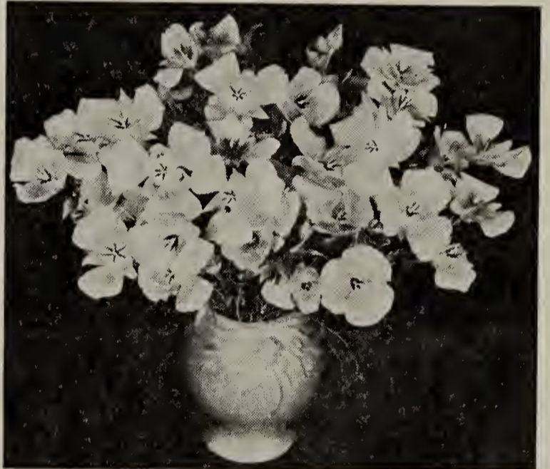
CALOCHORTUS CLAVATUS—Yellow Mariposa

South African and Cape Bulbs complete the offerings for four seasons of flowering. The Babianas for the earliest of spring followed by the fragrant Gladioli, new Ixias, the Leucocoryne ixioides, Lachenalias, Sparaxis hybrids, Streptanthera and several Moraea. Summer brings Mexican natives—Milla biflora and Ca-