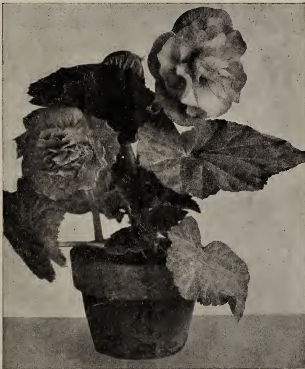
DOUBLE (CAMELLIA FLOWERING) TYPE