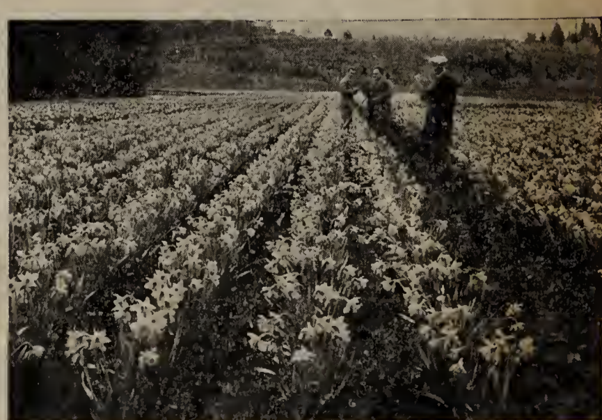
Bulbous Iris Production Field in Oregon