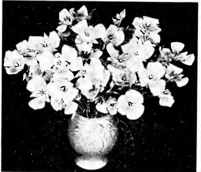
CALOCHORTUS CLAVATUS—Yellow Mariposa

South African and Cape Bulbs complete the offerings for four seasons of flowering. The Babianas for the earliest of spring followed by the fragrant Gladioli, new Ixias, the Leucocoryne ixioides, Lachenalias, Sparaxis hybrids, Streptanthera and several Moraea. Summer brings Mexican natives—Milla biflora and Ca-