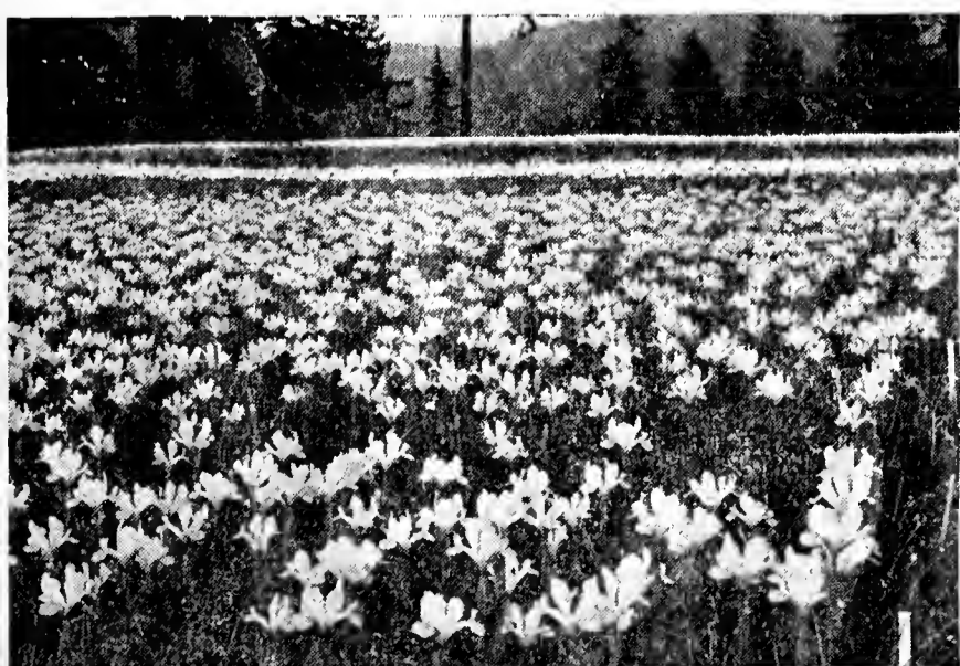
Bulbous Iris Production Field in Oregon

Our reason for selling is that our Nursery Business demands our entire attention. Price and terms reasonable—a good investment. Investigation is invited. If you are sincerely interested, complete information will be provided.