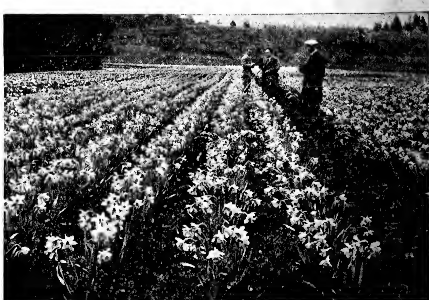
Narcissus Production Field in Oregon