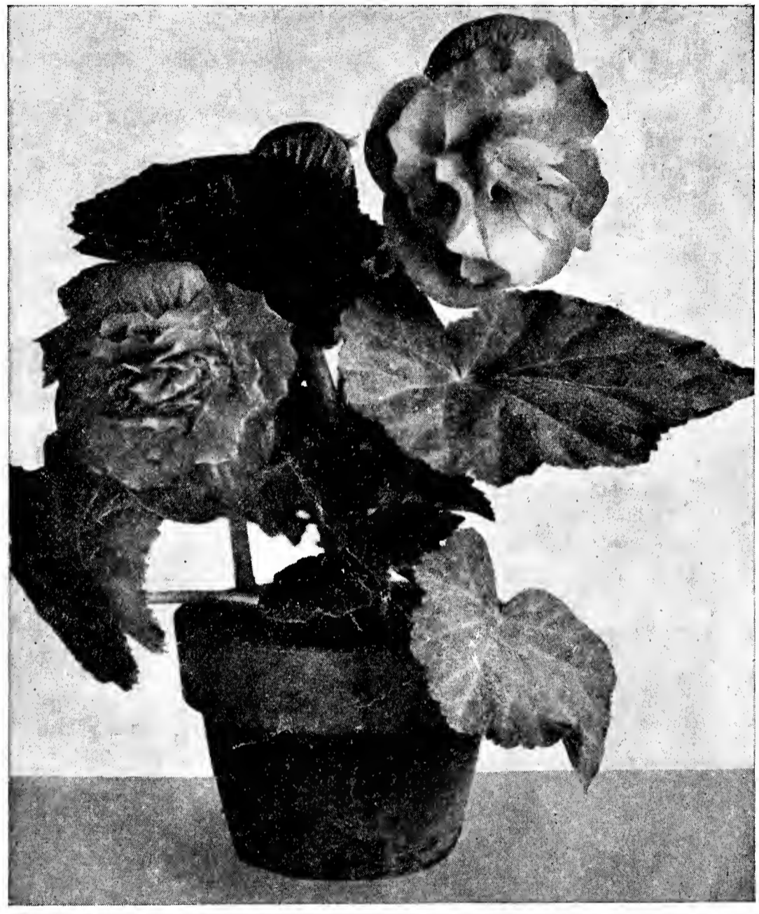
DOUBLE (CAMELLIA FLOWERING) TYPE