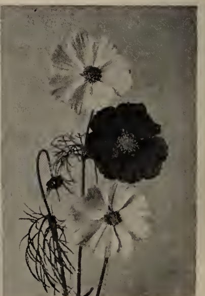
Cosmos Early Mammoth