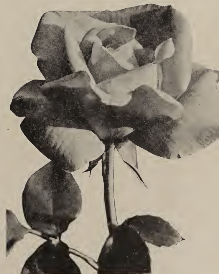
CL. CHAS. P. KILHAM

Boxed specimens 8 to 12 feet in immediate landscape effects, $3.50 each