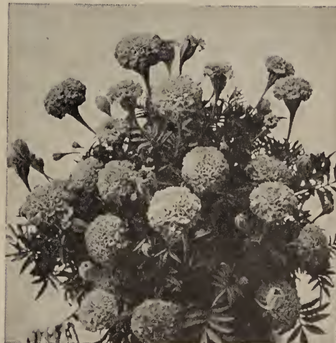
Dwarf French Marigold—GOLDEN BALL

New Double Nasturtium. DWARF GEM MIXTURE See Novelty List