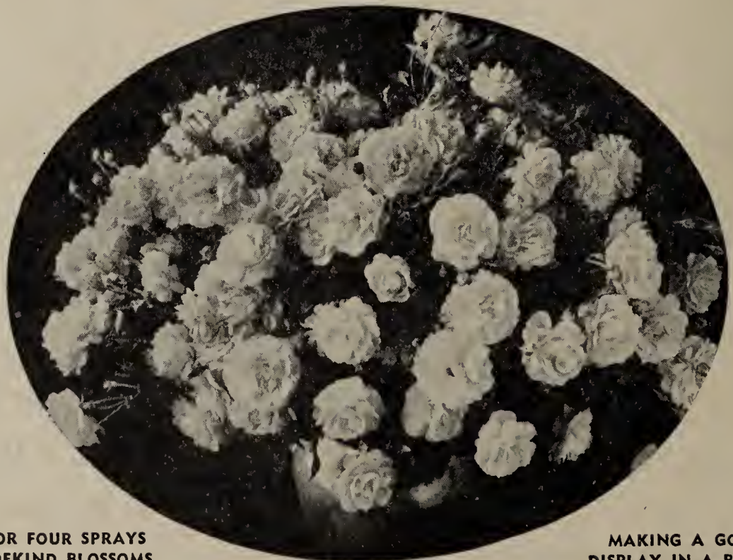
THREE OR FOUR SPRAYS OF HEIDEKIND BLOSSOMS

Like Heidekind, this is a new type of rose—one that will bring this glorious flower into many new uses in the garden and for cutting. Practically thornless, the Camellia shaped flowers are produced in astounding abundance in a color that is entirely distinct and difficult to describe—clear and brilliant rose red with a coral glow. Cut them any day in the year for small vases or luxuriant large decorations. They have wonderful keeping qualities. $1.00.