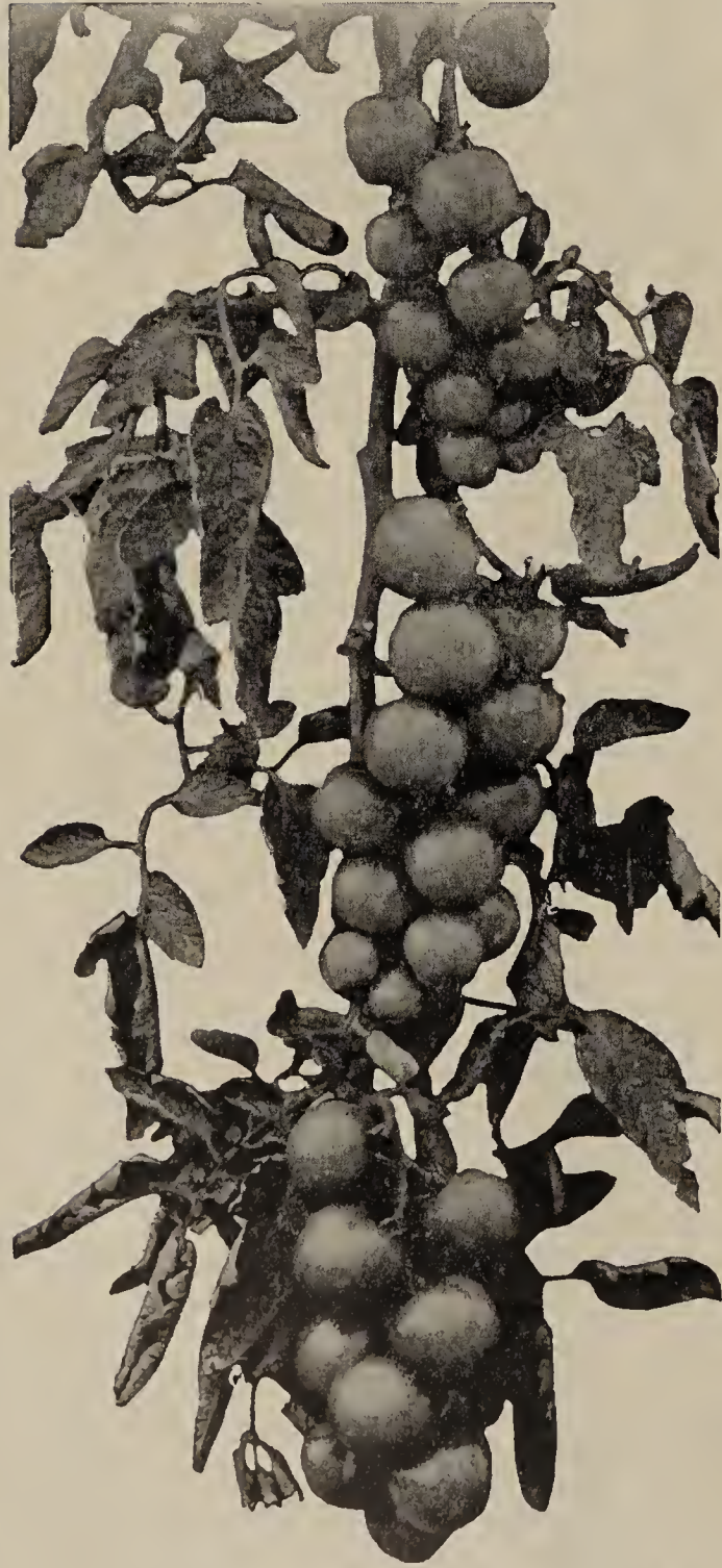
PAUL J. HOWARD'S GARDEN KING TOMATO

IDEAL. The new coreless Carrot. Quick, vigorous growing with sweet, tender flesh of rich color. The finest variety where quality is the main consideration. Packet, 10c; Oz., 40c.