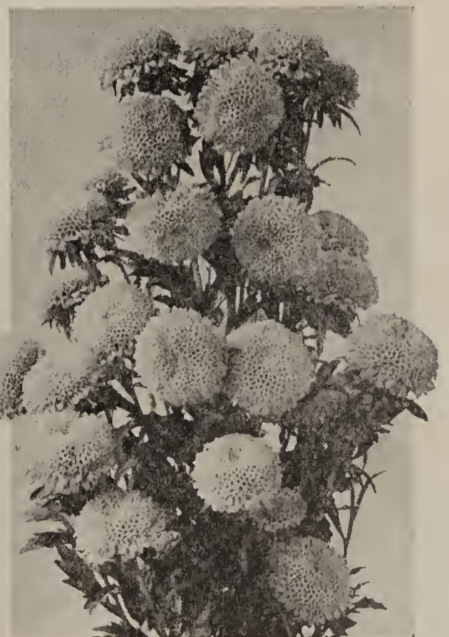
NEW POMPON ASTERS Very fine for cut flowers.

Sweet Sultans (Centaurea imperialis), rose, white, lavender, yellow, red, and mixed. Packet 10c.