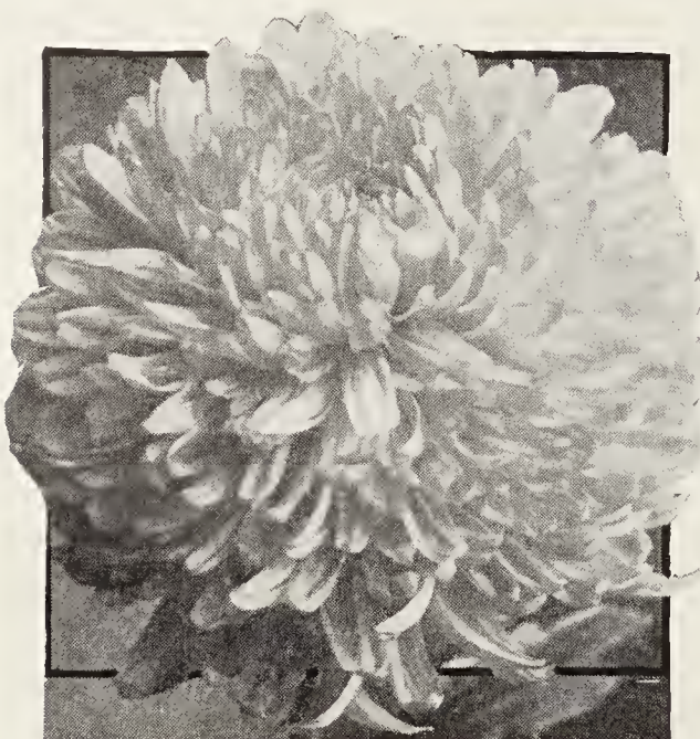
Chrysanthemums priced at 15 cts. each are $1.50 per doz.; 20-ct. varieties are $2 per doz.; 25-ct. varieties are $2.50 per doz.

Yellow William Turner. Same as William Turner, its parent, except that it is a beautiful lemon-yellow. A monster. 15 cts. each.