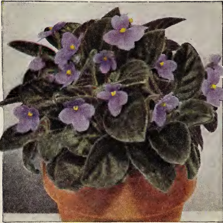
Saintpaulia (African Violet)

SAINTPAULIA. African Violet. This beautiful plant is a tender perennial for the house but can be set outside during the summer. The bronzy green foliage is thickly covered with fine hairs and the violet-colored flowers are freely produced. 50c. each, $5 per doz.