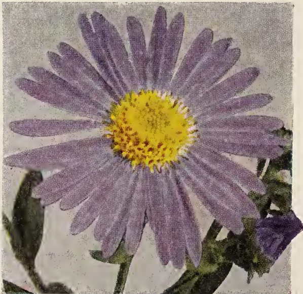
Aster Frikarti (Wonder of Staefa)

ANEMONE, September Charm. Two-inch flowers of delicate silvery pink, shaded with rose and mauve—a beautiful color. The 2-foot plants bloom in early fall. 35 cts. each, $3.50 per doz.