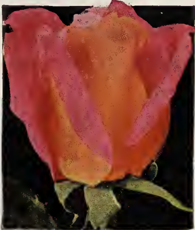
Pres. Herbert Hoover