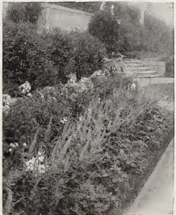
Veronica longifolia subsessilis

These Violas are perfectly hardy and will succeed in any good garden soil but must have full sun for best results. Shear close to ground twice each season to insure continuous bloom.