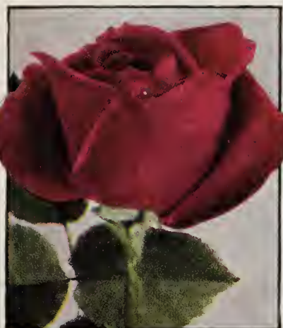
Etoile de Hollande