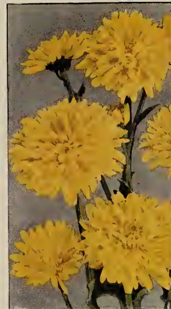
R. Marion Hatton. See page 19

Price of above varieties, 50 cts. each, $5 per doz. The set of 3 for $1.25