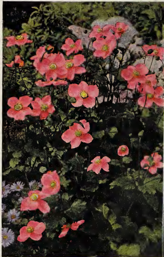
Anemone, September Charm