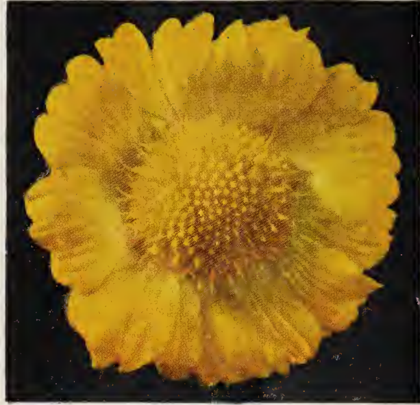
Gaillardia, Sun God