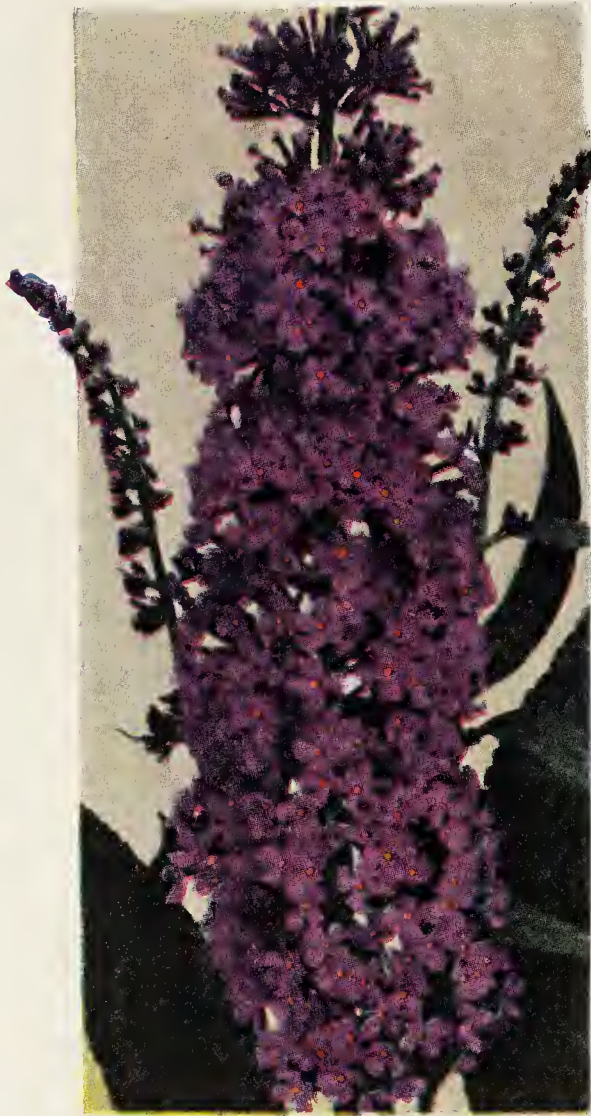
Buddleia, Ile de France. See page 15