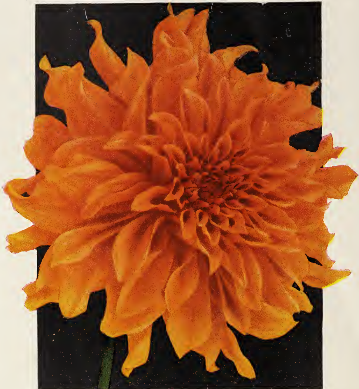
Dahlia, Jane Cowl