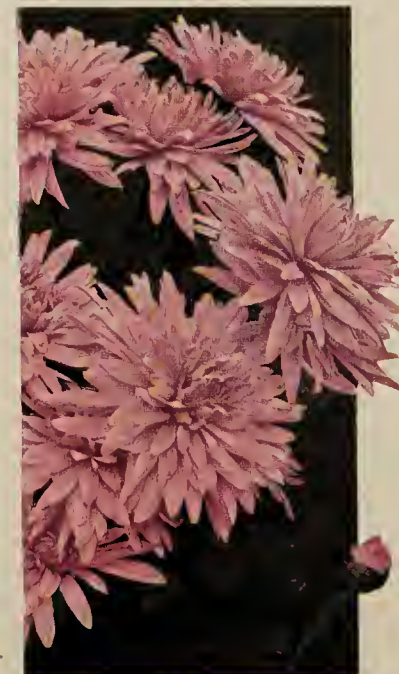
October Girl. See page 19