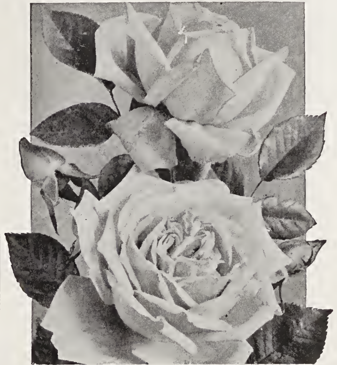
White Maman Cochet

Maman Cochet, White . T. A white form of Maman Cochet, but often flushed with pink on outer petals. Foliage equally good.