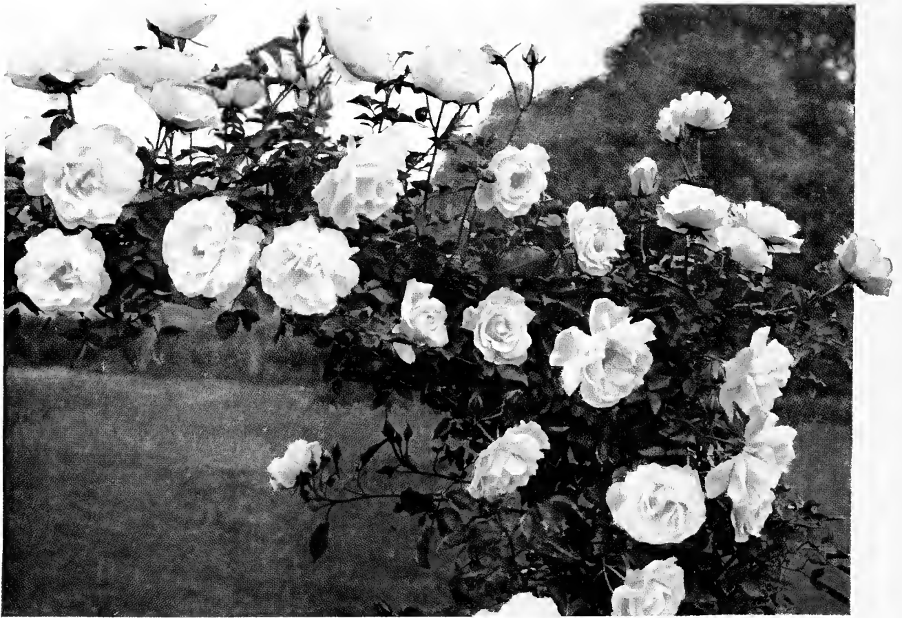
CLIMBING ROSE, MME. GREGOIRE STAECHELIN