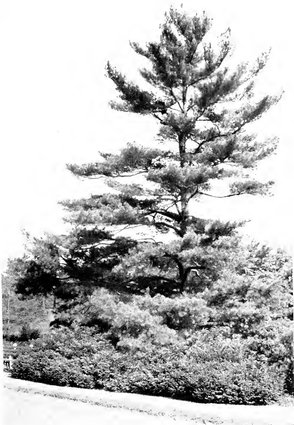
PINUS STROBUS (WHITE PINE)