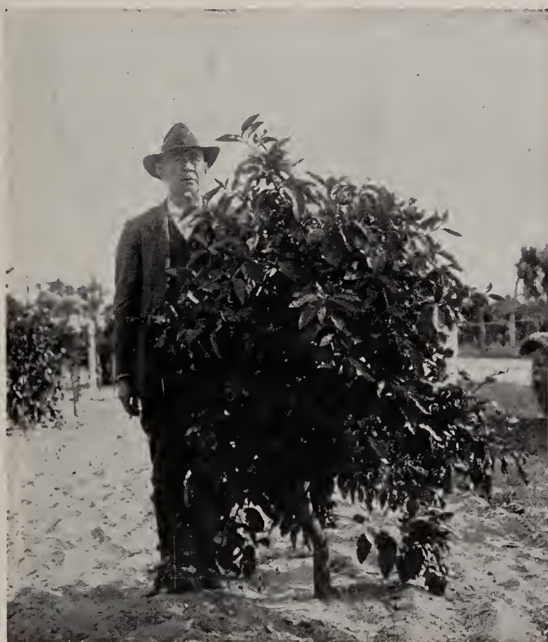
TREE TWO YEARS OLD

The Sour Orange Stock tree, we admit, is of slower growth during the first few years than the Rough Lemon Stock tree, but we consider this the best argument in favor of the Sour Orange Stock, as the slower and steadier growth has proven to be productive of trees that are much hardier not only against frost, but also against disease. Time and again it has been observed that in groves planted in mixed stock, all trees on Rough Lemon Stock had suffered severely from frost, Sour Orange Stock trees had not been touched at all. And the frequent attacks of die-back, lemon scab and similar diseases in comparatively young Rough Lemon Stock groves have very rarely been found in Sour Stock groves. Foot-rot is entirely unknown in groves planted on Sour Orange Stock. This fact has of late been very strongly brought be-