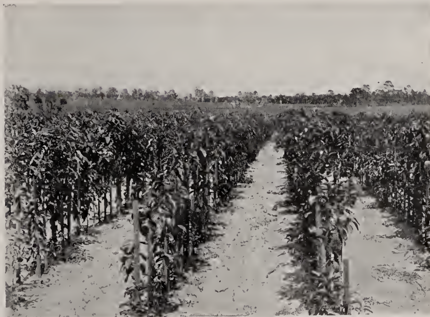
VALENCIA LATE BUDS

No other orange in Florida has become more popular with the public than the Parson Brown. It is of fine texture, excellent flavor, keeps and ships well. It begins to ripen as early as October and the crop comes on in a very uniform way. It is