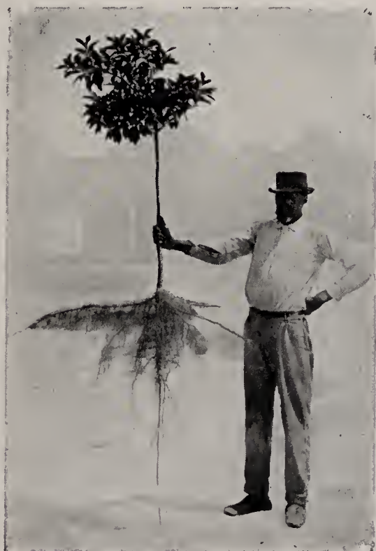
TWO-YEAR BUD AS IT GROWS IN NURSERY

at home and know just what to do. If set on rich land they will do extra well because of the excellent root system through which they take their nourishment from the soil.