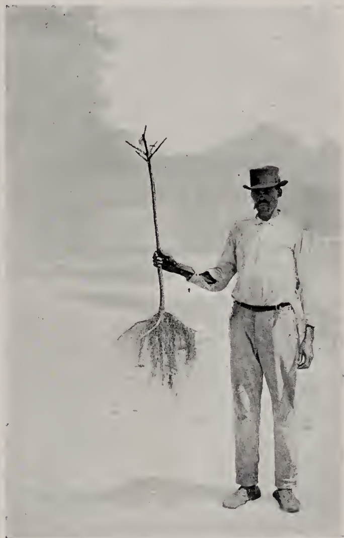
TREE TRIMMED FOR SHIPMENT

One of the most important points in a citrus tree is a good system of roots, and we have not overlooked this point in locating our nurseries. We selected light land on which to make our nurseries because of the fact that there we get a better root system. We do not push the growth of the trees by over-fertilizing, and we therefore force the tree to develop the maximum root system in order to get sufficient nourishment from the ground. By heavy fertilization we could easily obtain marketable sizes of trees in a much shorter time; but the root development would suffer and we prefer to go to the expense of taking care of the tree one year longer rather than to sell our customers trees that are not perfect in root system. Trees grown in our nursery will do well on any land that will grow citrus trees. If transplanted to light land they are