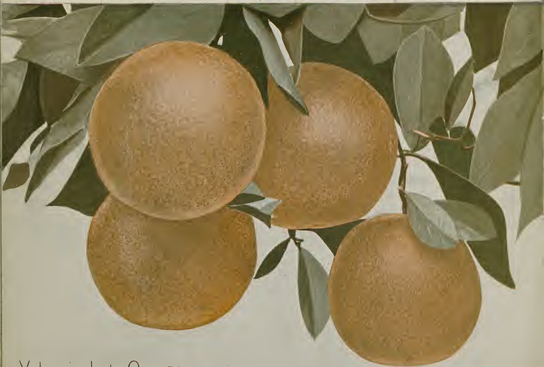
Valencia Late Orange