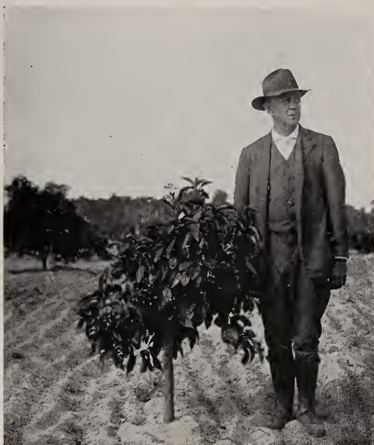
TREE ONE YEAR OLD

Orange is the native orange of Florida and its entire nature has adapted itself to the conditions of that State. Primarily this will be seen in the root system, which has the tendency of growing downward instead of spreading out six and more feet, and as a natural consequence the trees are far less subject to the suffering from long droughts which are so frequent in Florida. The deep-root system, furthermore, permits the tree to get the full benefit from the fertilizer even after the fertilizing ingredients have been washed to greater depth. This insures a more constant and even growth of the tree, while trees with a hollow and spreading root system, as such Rough Lemon Stock trees show, have a far more erratic growth, thriving immediately after fertilization but suffering as soon as the fertilizer has reached depths to which roots do not go.