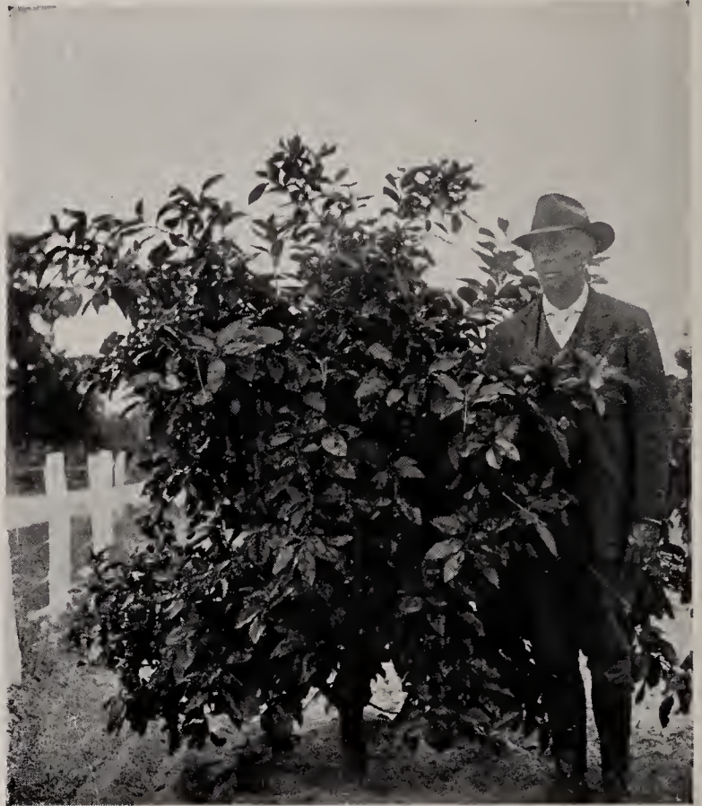
TREE THREE YEARS OLD

Anyone familiar with horticulture knows the great importance of proper