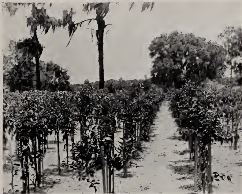
MARSH SEEDLESS GRAPEFRUIT BUDS

until late spring or early summer. After years of test, it has proven beyond doubt that it bears more regularly than any other grapefruit known. We advise all who are planting a grove for commercial purposes to plant this variety and they will make no mistake.