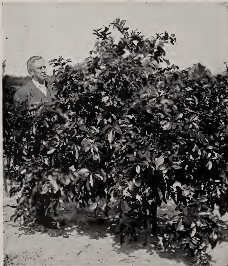
TREE FOUR YEARS OLD

bud-selection. It is the bud that gives the tree the fruit-bearing quality, hence the best results can be obtained only if the tree has been budded with wood coming from a first-class bearer.