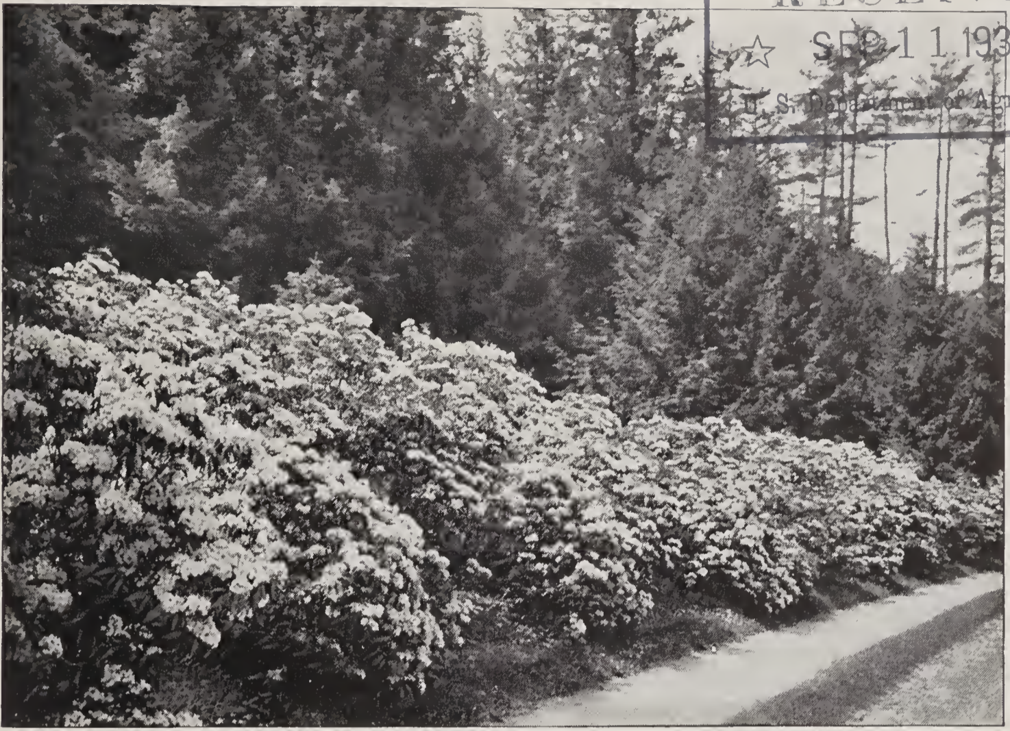
MOUNTAIN LAUREL. No more beautiful shrub can be used in woodland borders and mass plantings where native color effects are desired

LIBRARY RECEIVED ★ SEP 11 1936 ★ U. S. Department of Agriculture.