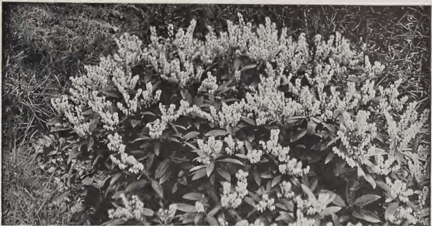
Pieris floribunda . See page 14