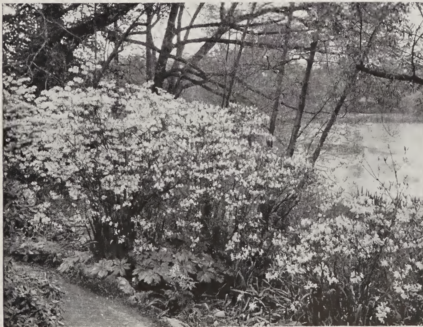
Azalea vaseyi makes a glorious show of color