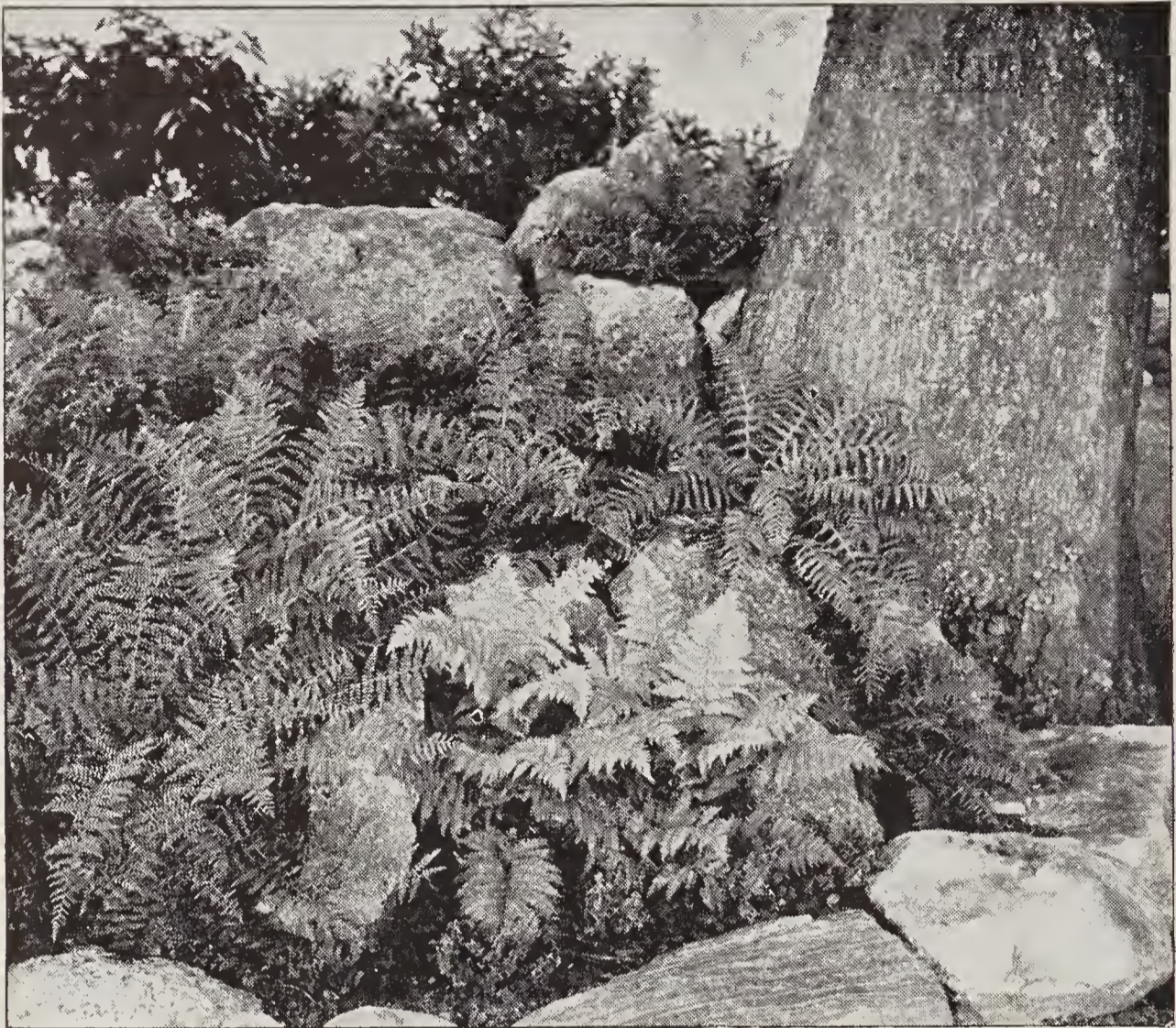
Ferns in a Rock-Garden