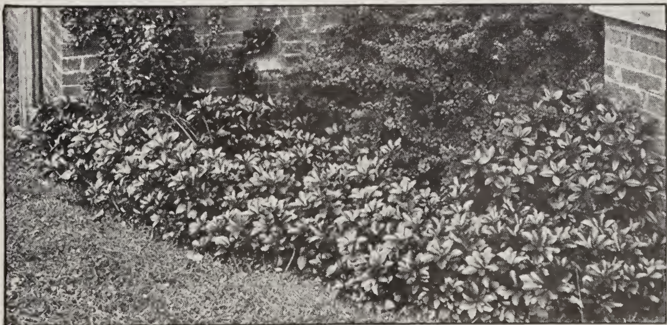
Pachysandra terminalis. See page 19

We know how to pack to insure delivery in good condition, even to foreign countries. Let us handle your orders for high-class native plant material We specialize in filling orders promptly. Rush orders solicited. Special Quotations on Carload Lots