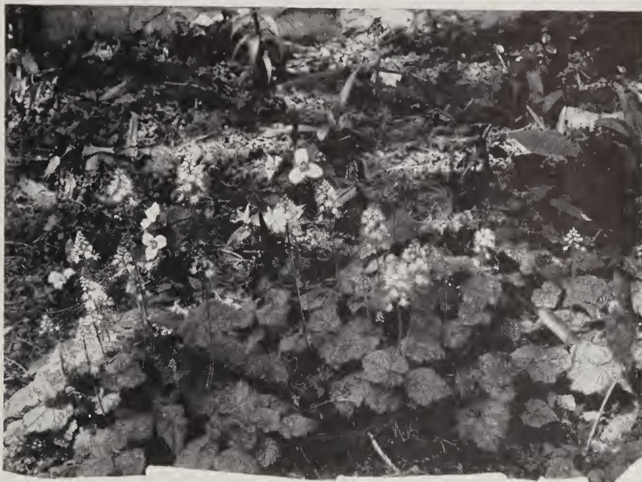
Trillium undulatum and Tiarella cordifolia