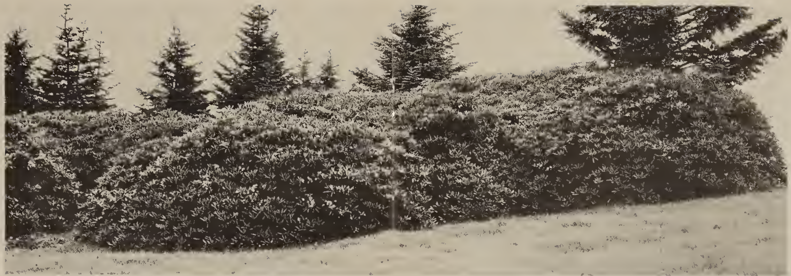
This picture shows Rhododendron catawbiense compacta . Natural planting in the Carolina mountains. Altitude 6,000 feet. My collected plants come from these fields