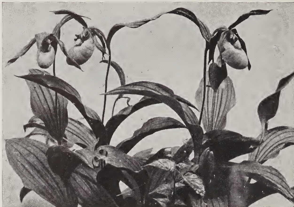
Cypripedium pubescens . See page 25