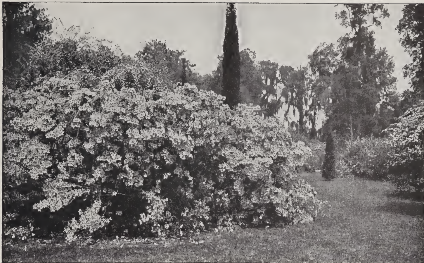
Azalea calendulacea . See page 4