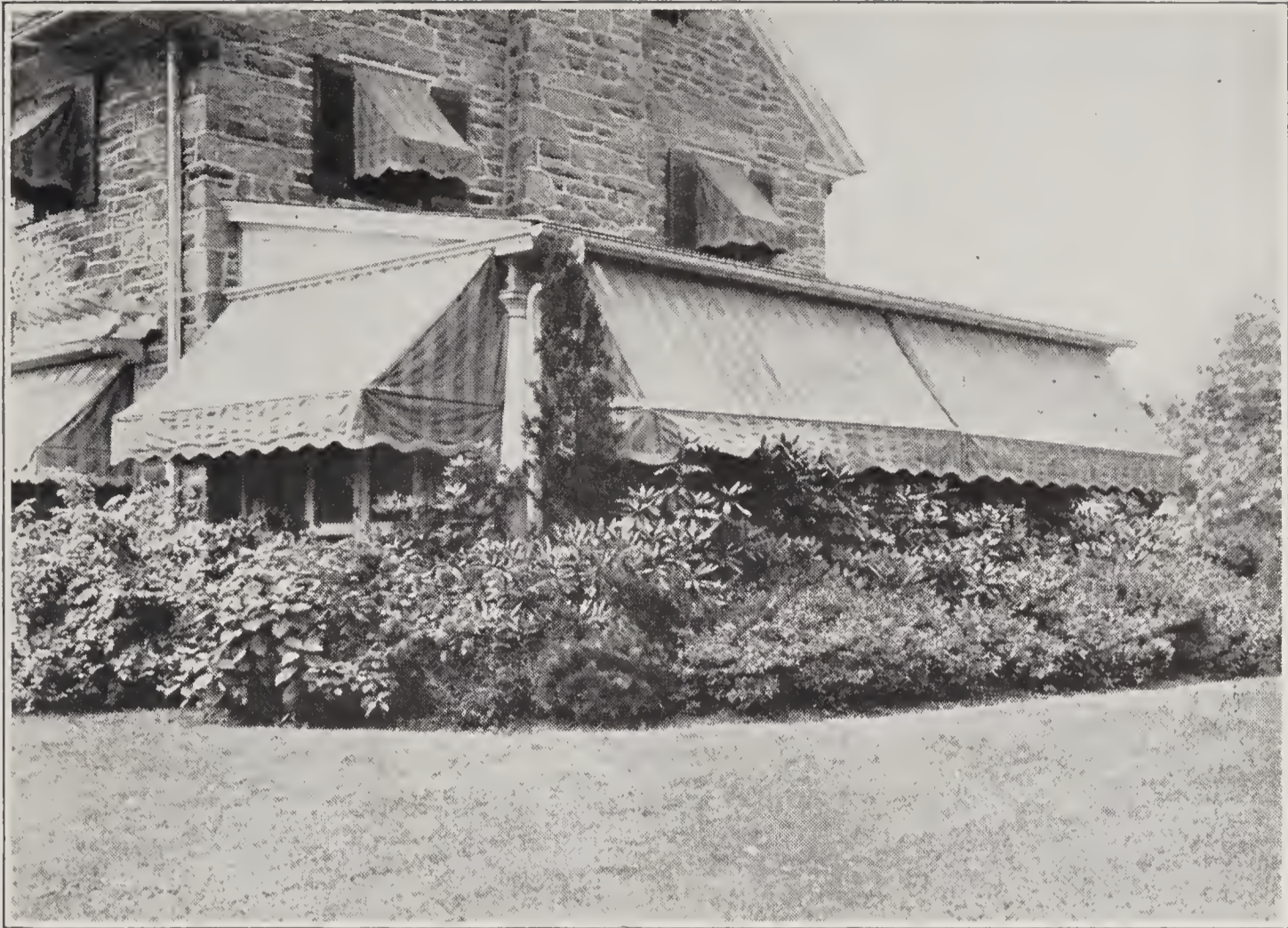
Foundation plantings of Broad-leaved Evergreens are both unusual and beautiful, giving color and character all the year