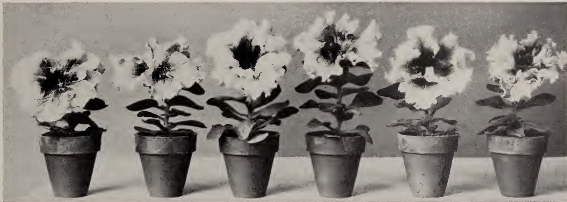
No. 1 Diener's Ruffled Monsters in 3-inch pots, 12 weeks after sowing