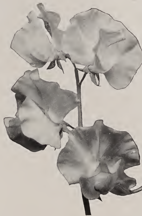
Giant Rose—1/3 Natural Size