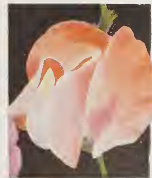
Spencer Sweet Pea.

SWEET PEA SEED Spencer's Orchid Flowering. Fancy mixed colors. Oz., 25c.