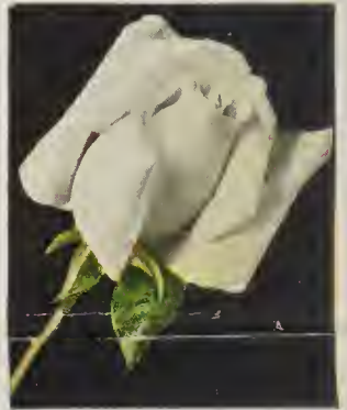
Kaiserin Auguste Victoria.

Radiance. The finest pink we know. The buds are long, pointed, and the blooms cup-shaped. A beautiful shade of carmine-pink; flowers on long, stiff stems.