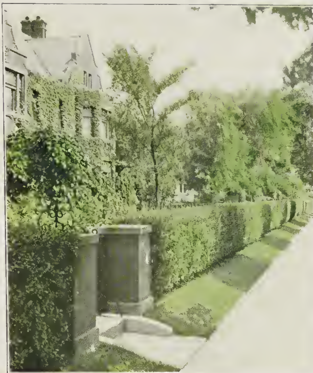
Amoor River Privet.