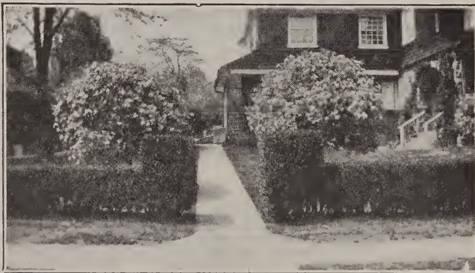
MALUS ATROSANGUINEA, CARMINE CRAB