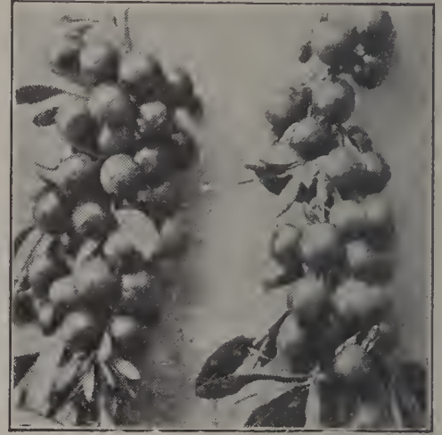
Masses Of Fruit Completely Cover Branches

In landscape planting these Bush Cherry are also desirable as they are of striking ornamental value and their dwarf bushy nature is of great aid in foundation planting work, or they may be planted close enough together for a low fruiting hedge on the lawn or in the garden. The foliage which is a beautiful silvery green, turns to a rich red and gold color in fall and adds a very desirable touch to any landscape planting. The profuse masses of large fragrant white flowers in the spring, which completely cover the branches, are a glorious sight.