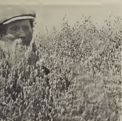
Hoffman's clean, vigorous seed makes heavy crops of good oats. . . . New blood in your seed means more bushels to harvest.

A. H. HOFFMAN, INC. LANDISVILLE, PA. • (LANCASTER COUNTY)