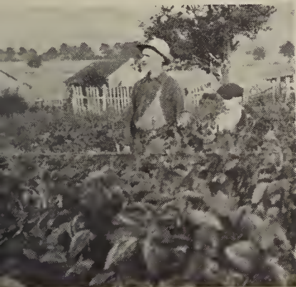
Soy Beans, popular crop for hay, beans or soil improvement—See New Catalog, pages 30 to 32.