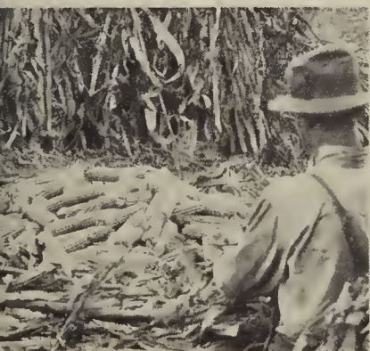
Hoffman's Quality Seed Corn makes more bushels for you . . . and truly fills your silo. Please read details in Catalog, pages 40 to 51.