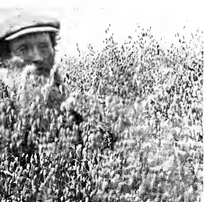
Hoffman's clean, vigorous seed makes heavy crops of good oats. . . . New blood in your seed means more bushels to harvest.

A. H. HOFFMAN, INC. LANDISVILLE, PA. • (LANCASTER COUNTY)