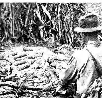
Hoffman's Quality Seed Corn makes more bushels for you . . . and truly fills your silo. Please read details in Catalog, pages 40 to 51.