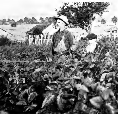
Soy Beans, popular crop for hay, beans or soil improvement—See New Catalog, pages 30 to 32.