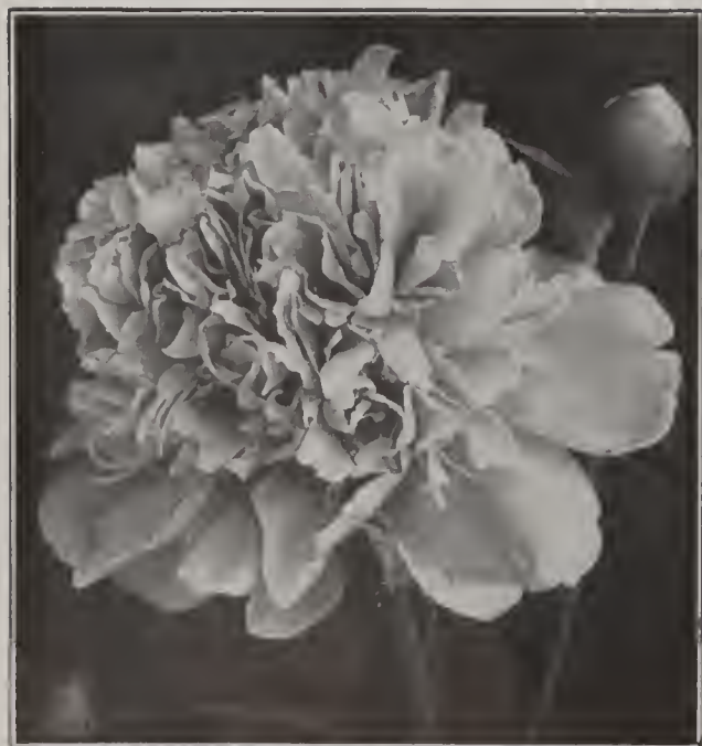
Peony, Karl Rosenfield

Bellamosa. A dark blue of the type of Belladonna.