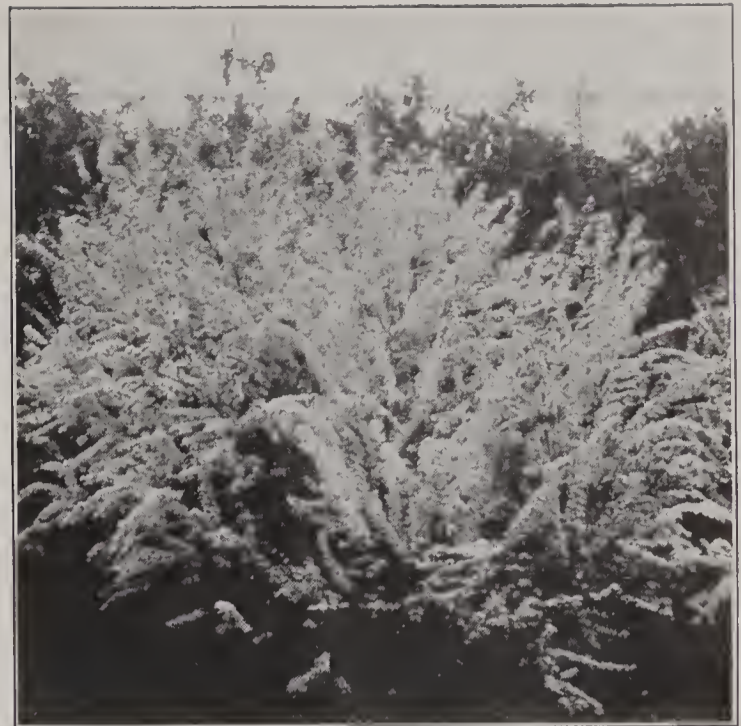
Snow Garland Spiraea