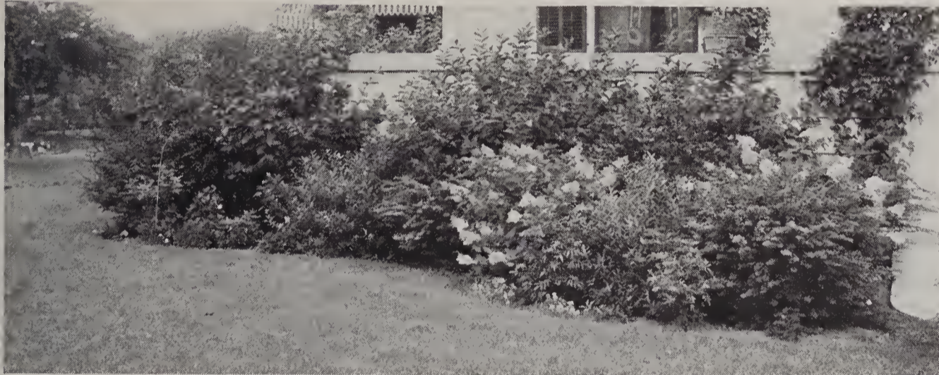
Beautify your home with plants especially selected for the Northwest