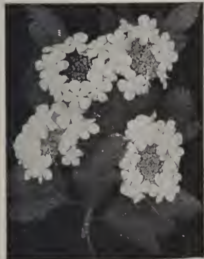
Flowers and Fruit of High Bush Cranberry