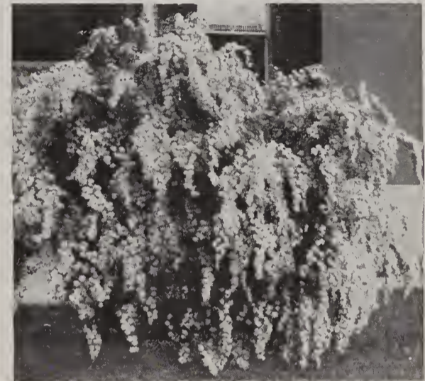
Spiraea Van Houttei