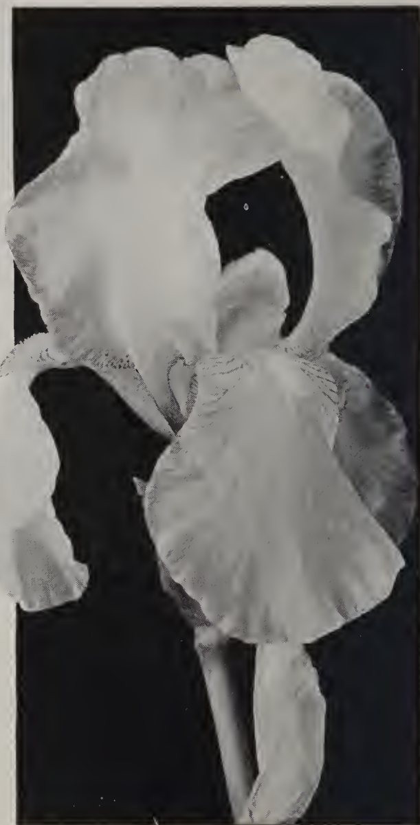
Iris, Quaker Lady

SARAH BERNHARDT. Flowers of remarkable size in clusters; full and double. Apple-blossom-pink with silver tips. Late.