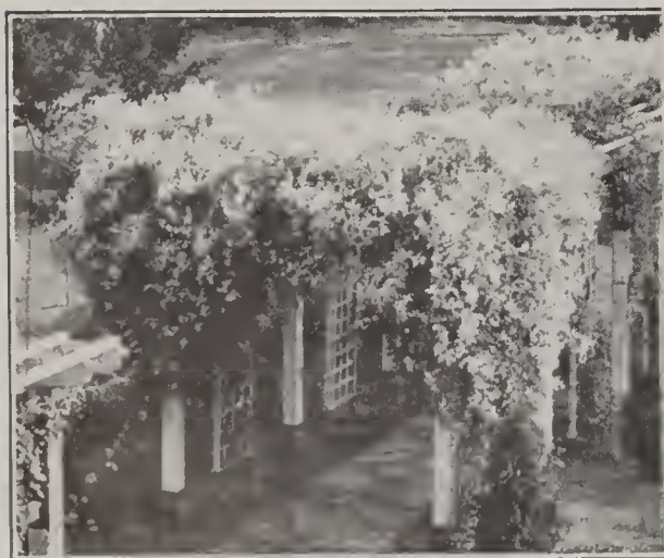
SILVER LACE VINE - Polygonum Auberti

CHINESE MATRIMONY VINE. Especially valuable to cover a bare, rocky or weed-covered bank; of very vigorous growth. Covered with red berries.