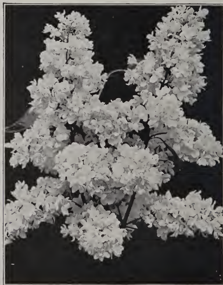
Hybrid Lilac, Belle de Nancy

Villosa. S. Also known as Summer Lilac. Flowers light purple in bud and nearly white when open. Fragrant; late bloomer. 8 to 10 ft.