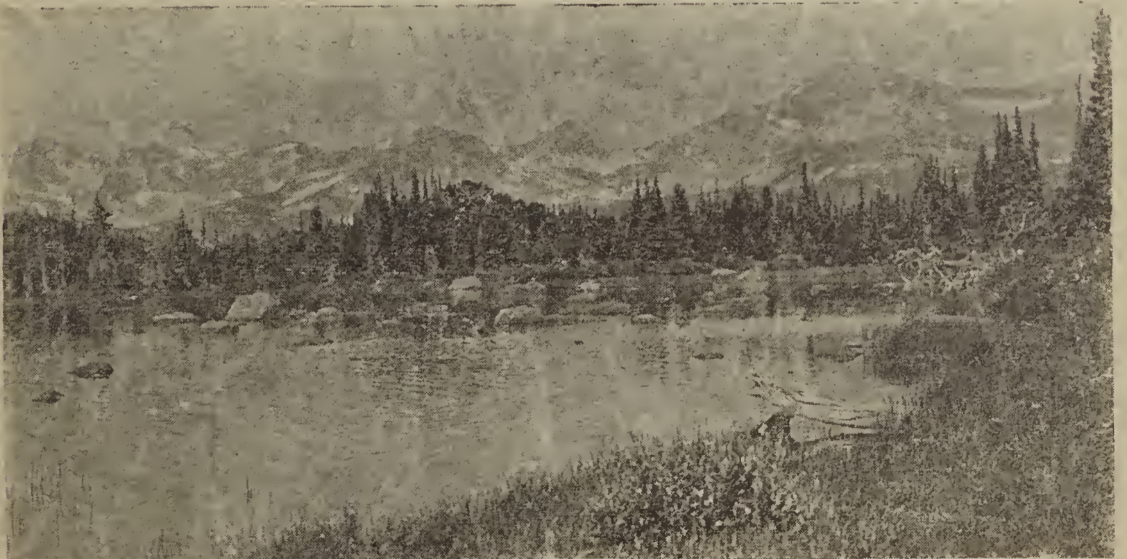
Red Rock Lake, Colorado

Mugho Pine. Dwarf, globose, compact, short needles of dark green; to six feet. 15 to 18 inches, $2.50 Each; 18 to 24 inches, $3.50 each. Shipping weight 40 to 65 lbs.