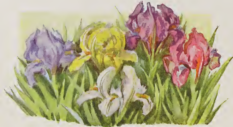
Miniature Bearded Iris

T HIS group is the result of crossing two distinct species, one of which is Pumila found in Austria-Hungary, South Russia or the Caucasus; the other is Chamaeiris , which is native to Southern France and Northern Italy. Pumila is a stemless Iris, whereas Chamaeiris produces its flowers on stems 6 to 10 inches in height. By crossing these, our modern miniature Irises have been produced with all of the beauty of Iris Pumila , on the flowering stems of Chamaeiris , and with all of the ruggedness of the latter variety. The results of these crosses have been charming beyond description. They have, in miniature form, all the characteristics of the Tall Bearded Iris and are prodigious bloomers. They begin to flower in April in our northern states and continue to the middle of May.