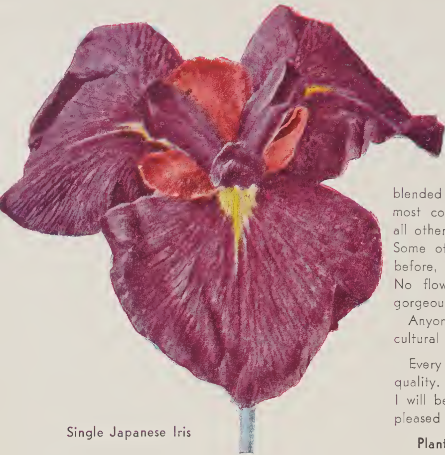
Single Japanese Iris

THESE are among the most gorgeous of the entire Iris family. There is nothing more showy than these fine Japanese Iris and as they blossom after the others have finished flowering, they thus prolong the Iris season for several weeks. There are giant singles and doubles, self colors, mottled, striped and blended effects, subtle soft tints and intense deep colors in a most comprehensive range. They are different in form from all other Irises. Many of them are as large as a dinner plate. Some of those listed below have never been offered by me before, having never until now had sufficient stock to list them. No flower garden should be without a collection of these gorgeous Japanese Iris.