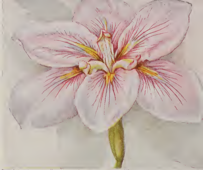
Ganymede (See page 38)

Oriole —36 in. EARLY DOUBLE RICH BURGUNDY RED, with a smoothness of texture and a carriage that makes it especially attractive. An unusually brilliant color.