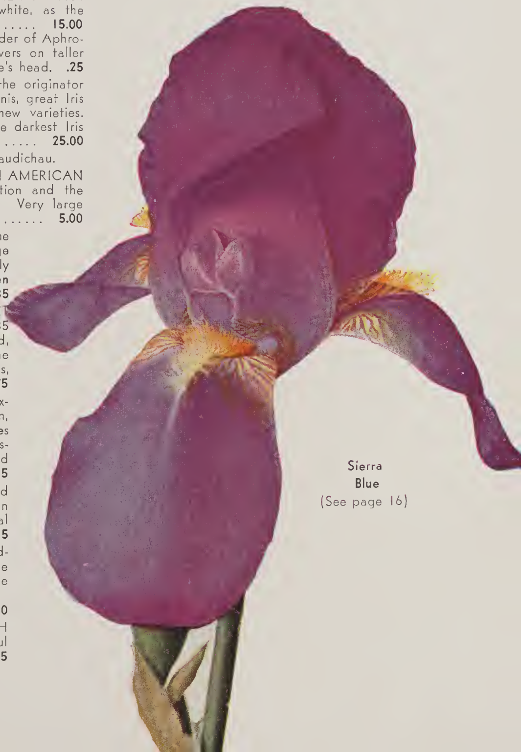
Sierra Blue (See page 16)