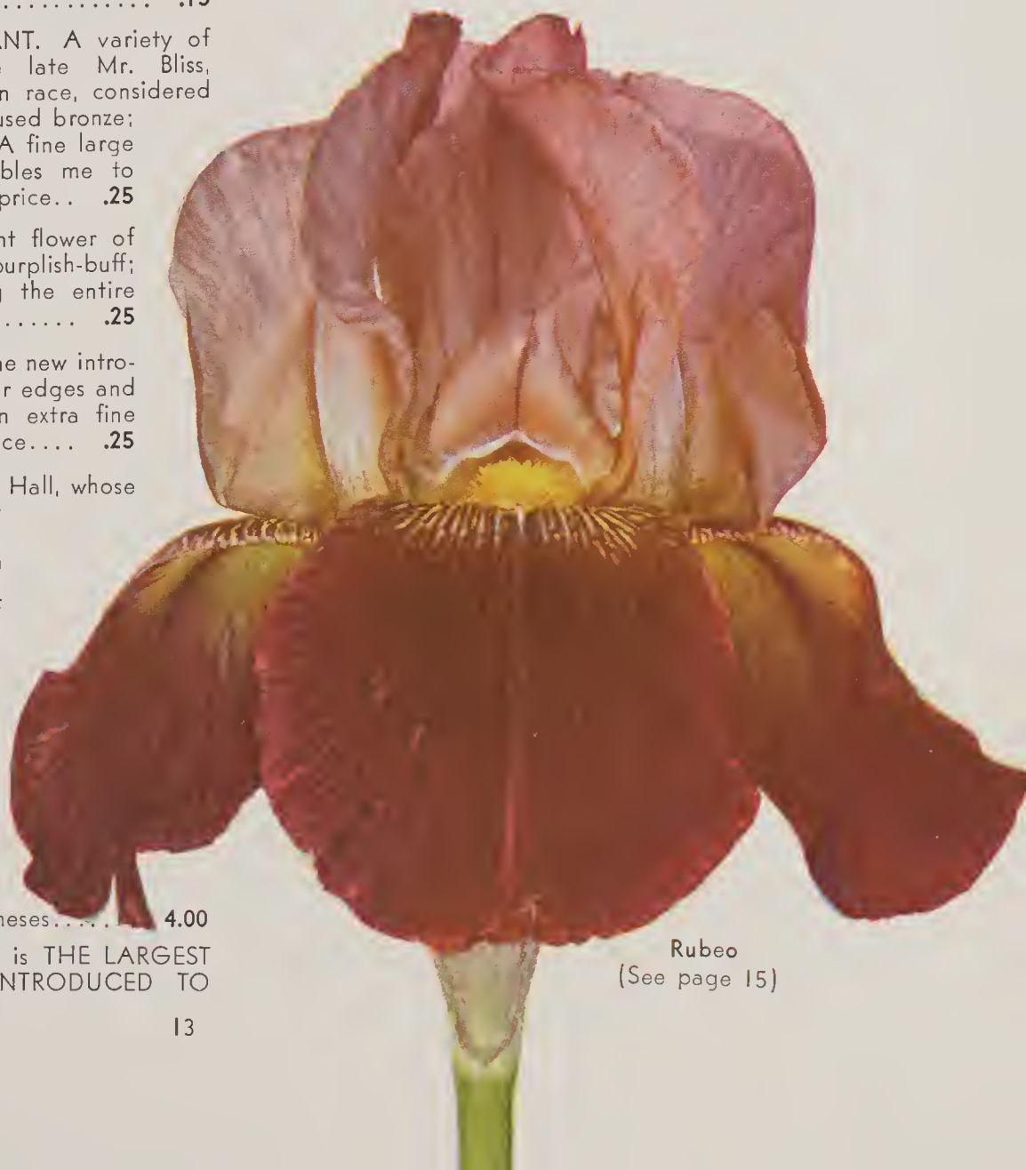
Rubeo (See page 15)

Pacific —36 in. EARLY. A magnificent clear deep blue of gigantic size. One of the most marvelous deep clear, pure blues imaginable. . . . . .25