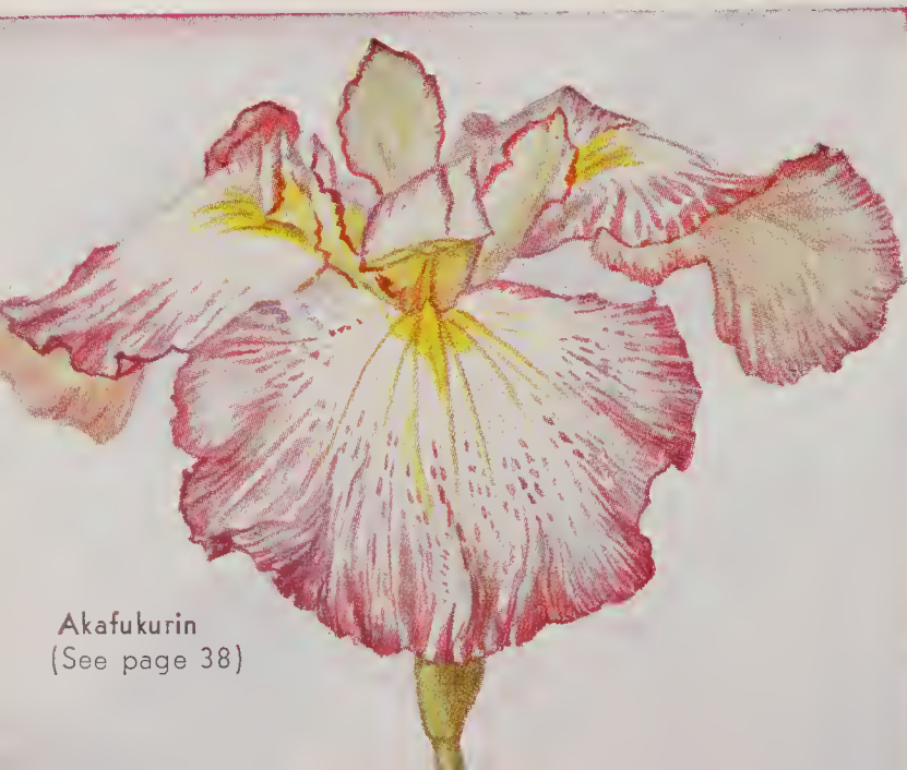
Akafukurin (See page 38)

Doris Childs —32 in. Double. Pearl-white, deeply veined rosy-plum. Centre petals deep plum, edged white.