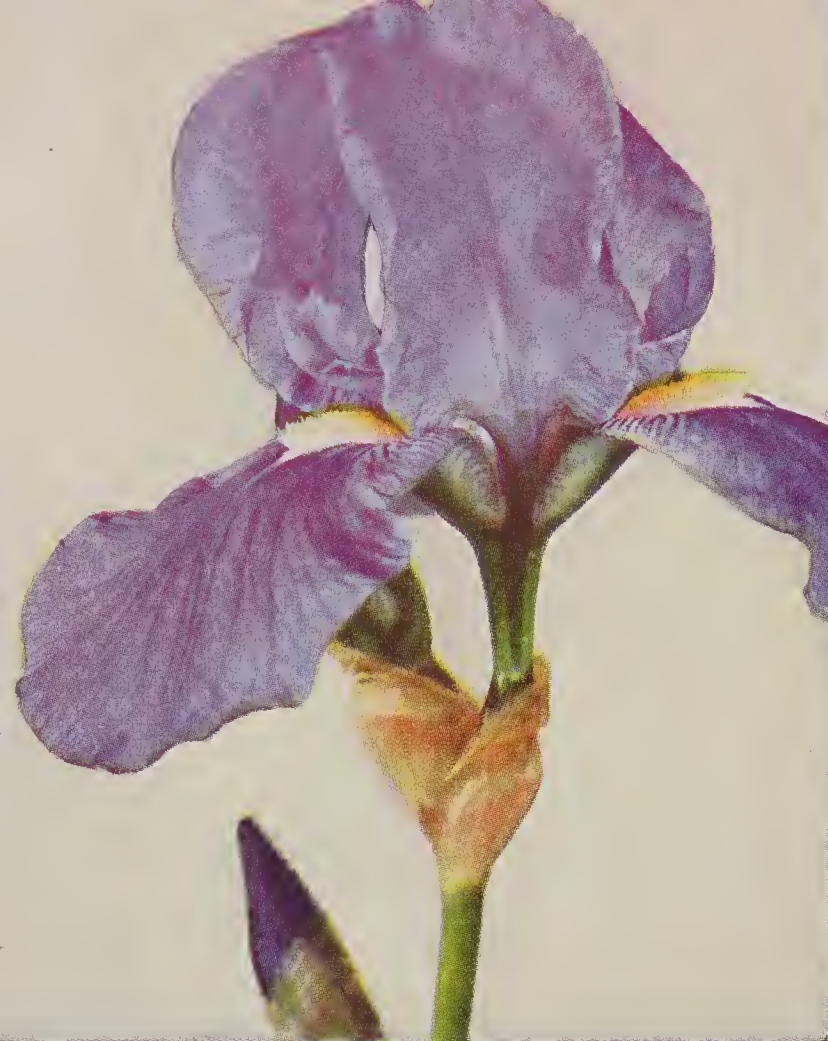
Santa Barbara (See page 16)