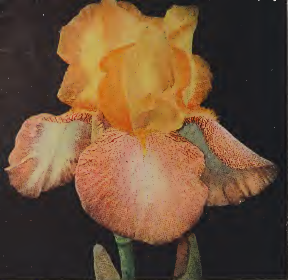
King Karl (See page 10)

well as our biggest seller by mail. Nothing new has appeared that is equal to it in its class. Besides huge size, perfect form, good color and aristocratic bearing, it has a delicious locust fragrance, being one of the most fragrant of all Irises. Sold only a few years ago for $25. for a single plant, it is now within the reach of all..... .25