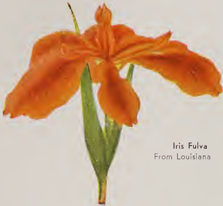
Iris Fulva From Louisiana