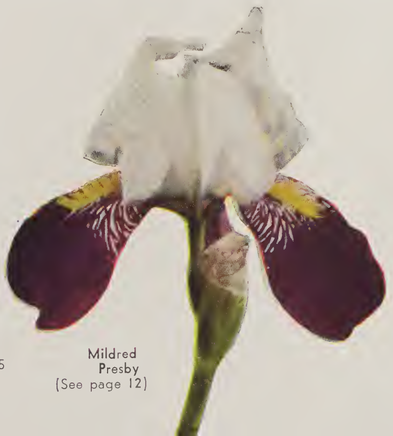
Mildred Presby (See page 12)

San Francisco —44 in. EARLY. WINNER OF THE DYKES MEMORIAL MEDAL, HIGHEST INTERNATIONAL HONORS. One of the largest and finest Iris of the "Plicata" type. A massive flower of perfect form, double the size of other "Plicatas" marking a new era in this group. White, with a feather-stitched edging of lavender-blue. An extra fine stock of fine plants enables me to make a low price on this magnificent variety..... .25