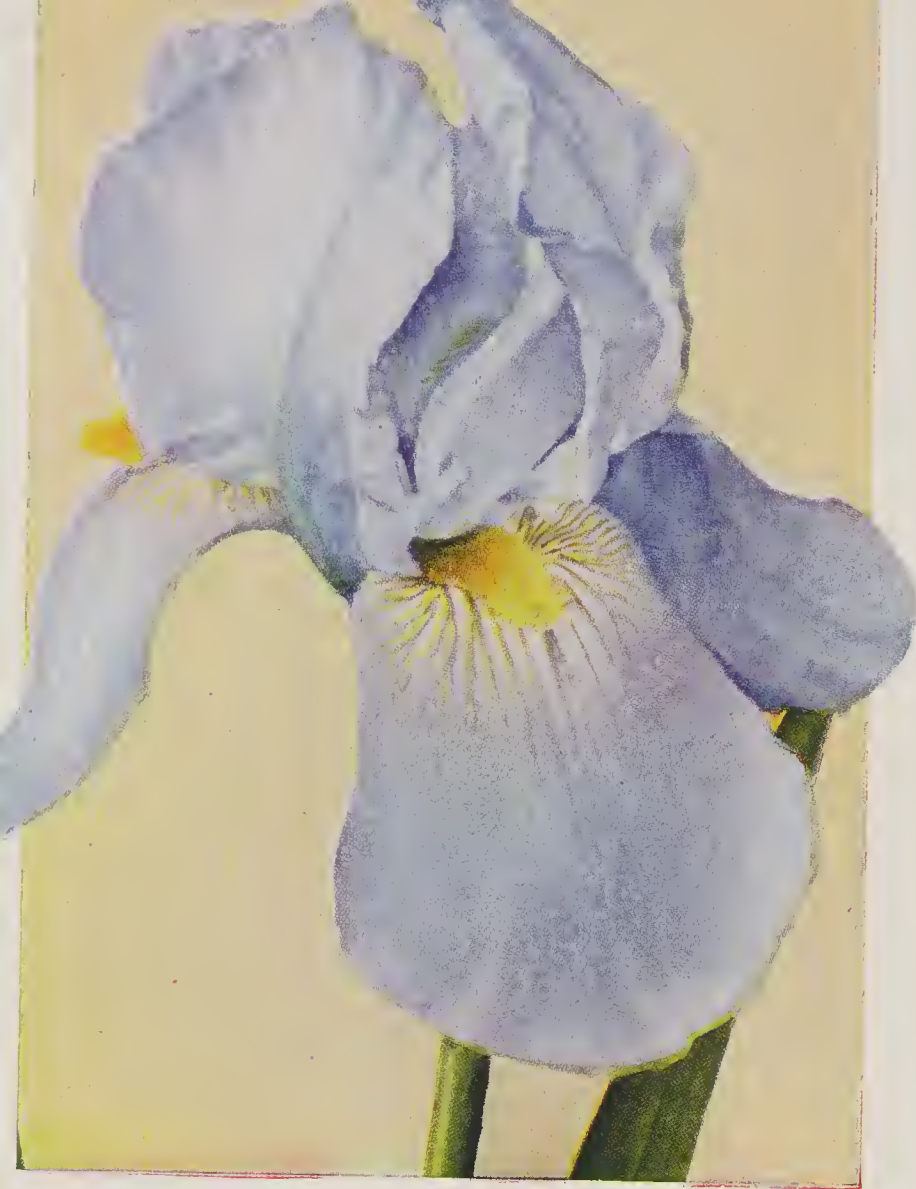
Pale Moonlight (See page 14)