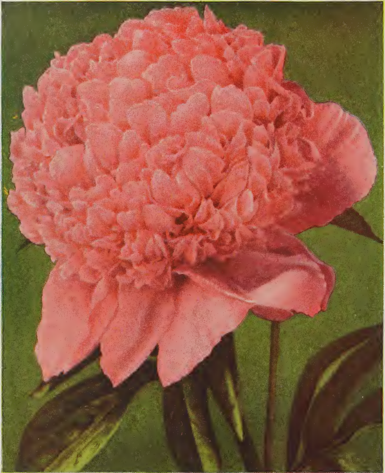
Mons Jules Elie

T HIS list contains only the very finest Peonies. No variety is included in this list unless it is officially rated at 80 or over, which is the official rating of the American Peony Society for "very good." Most of them are rated 85 or better and about 50 of them are rated 90 or better. The five very highest rated varieties are included. They are Le Cygne 9.9, Therese 9.8, Kelway's Glorious 9.8, Solanga 9.7 and Mrs A. M. Brand 9.6. In fact, this collection includes ALL of the very finest and highest rated Peonies.