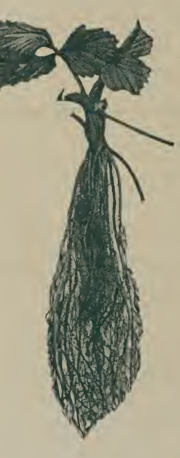
WALLER'S NEWGROUND PLANT

Answer: Dependable quality plants are the cheapest plants that you can set. WALLER quality plants are the best yield insurance that your money can buy.