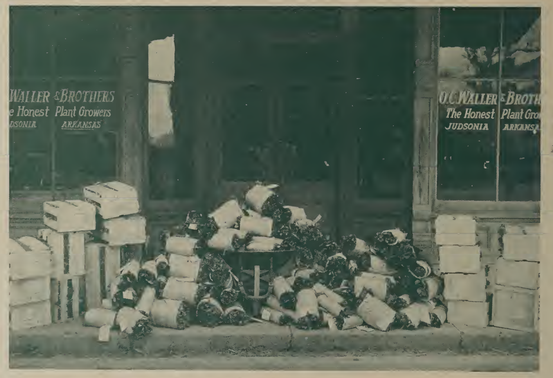
One day mail order shipment of strawberry plants