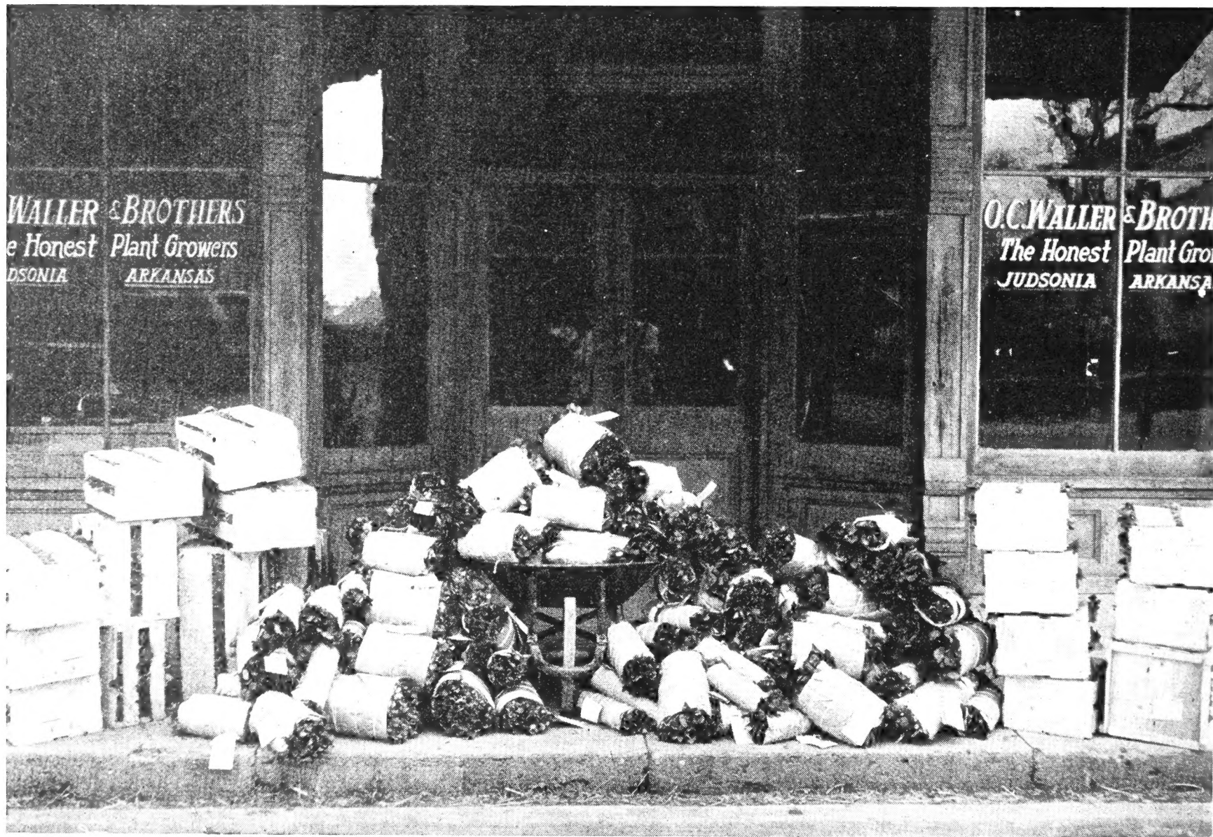
One day mail order shipment of strawberry plants