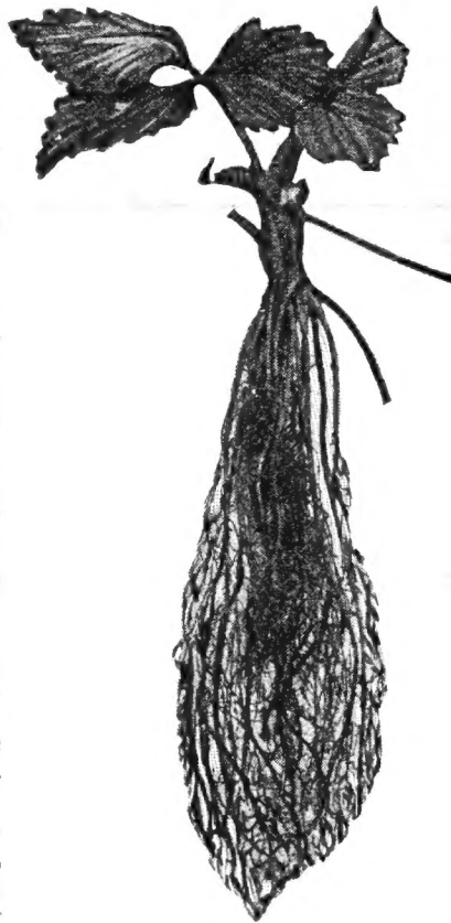
WALLER'S NEWGROUND PLANT

Plants so grown, culled, packed, and shipped must be right.