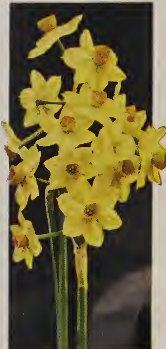
Rising Sun Narcissus

Exhibition and Superior Hyacinths Are Also Excellent for Growing Indoors