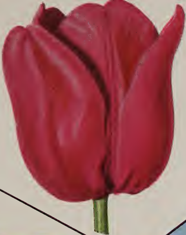
PRIDE OF HAARLEM

RECEIVED ★ NOV 1937 ★ U. S. Department of Agriculture