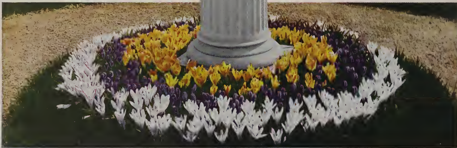
Mammoth Yellow, Albion (purple), Mont Blanc (white), Crocus

The "hole-in-one" bulb planting tool. Removes the soil up to a depth of 5 inches, making a perfect planting hole for many kinds of bulbs. 60c postpaid.