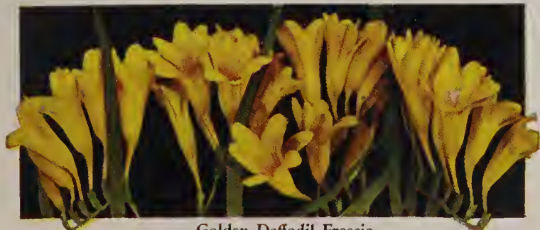
Golden Daffodil Freesia

Exhibition and Superior Hyacinths Are Also Excellent for Growing Indoors