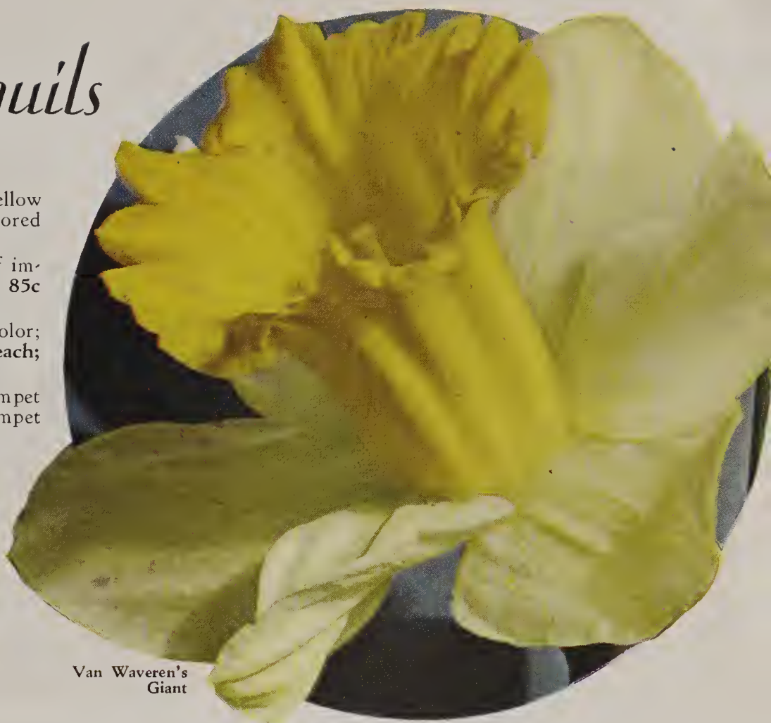
Van Waveren's Giant

OLYMPIA. A much improved and enlarged Emperor; very free flowering and exceptionally hardy. 12c each; 90c per doz.; $6.25 per 100.