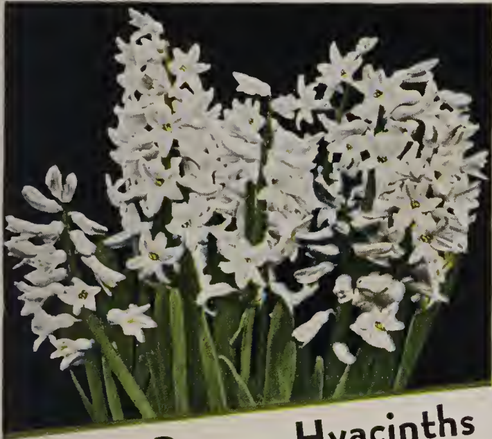
French Roman Hyacinths 15c each; $1.50 per doz.; $10.00 per 100.