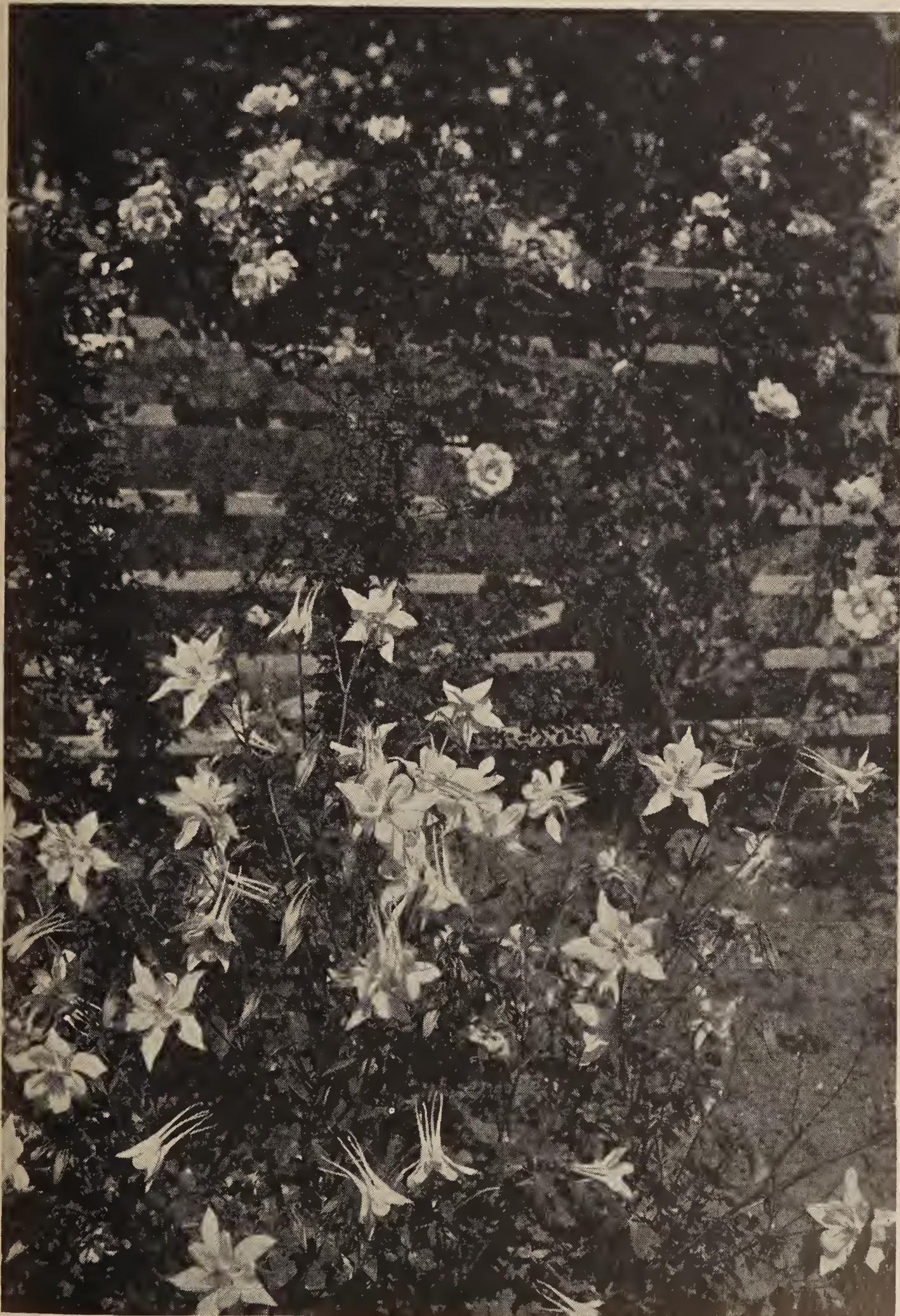
Individual plant of Hoodacres Aquilegia. Typical for size of blossom and length of spur.