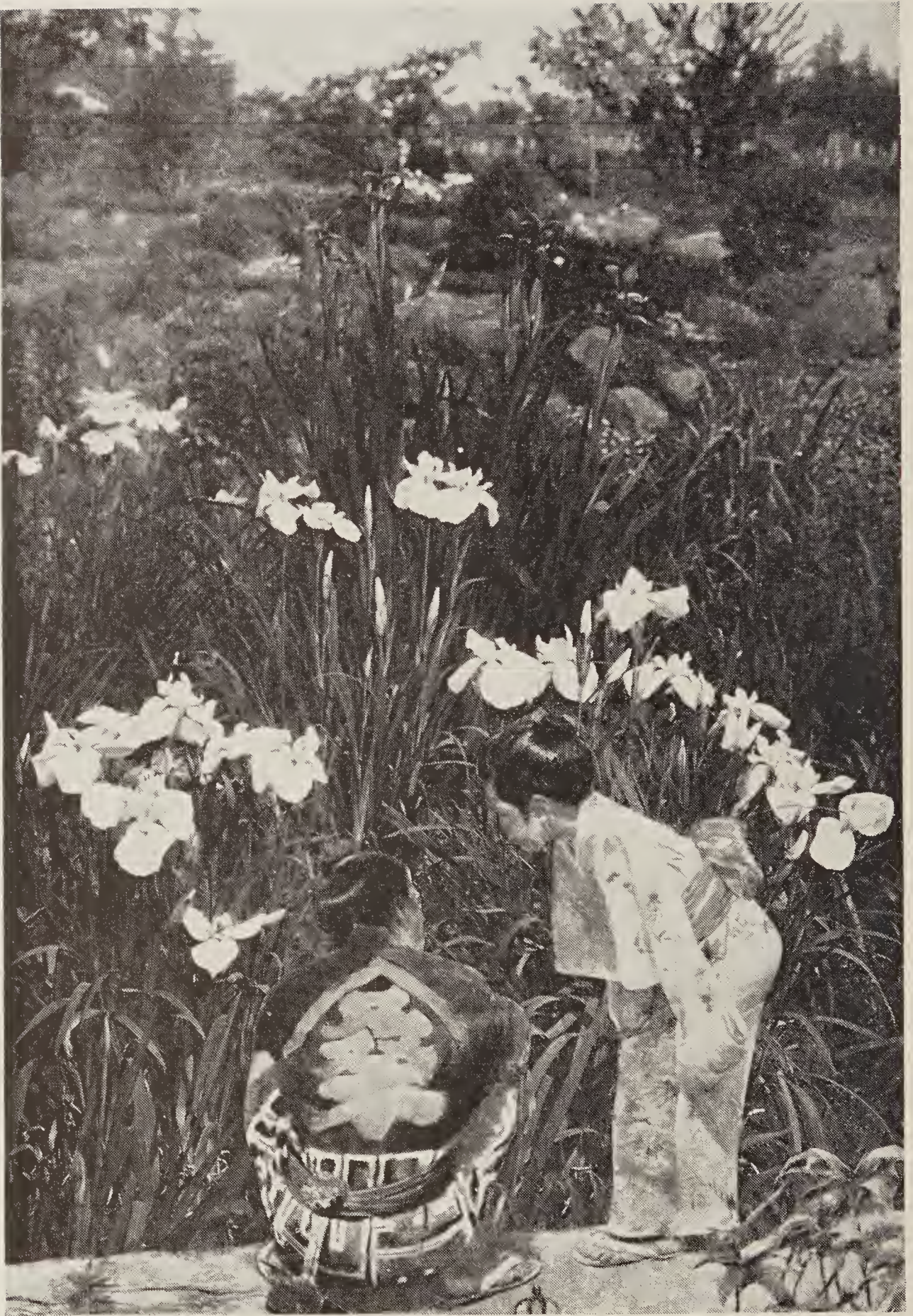
Our Visitors from Japan