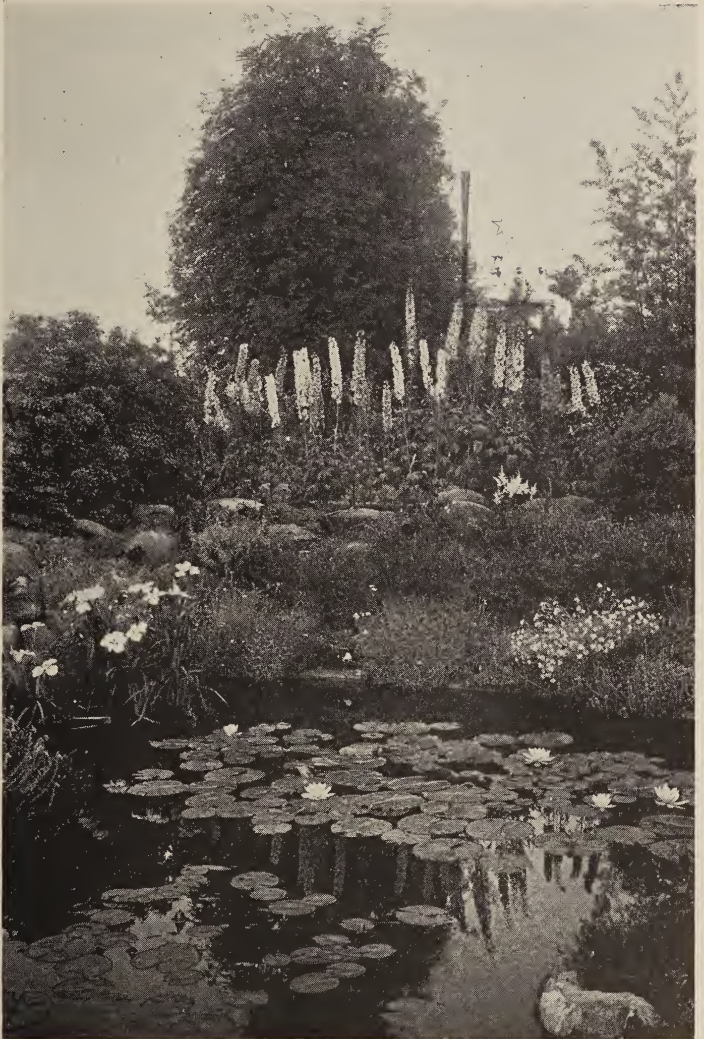
A section of sunken Alpine Garden and Pool at Hoodacres.