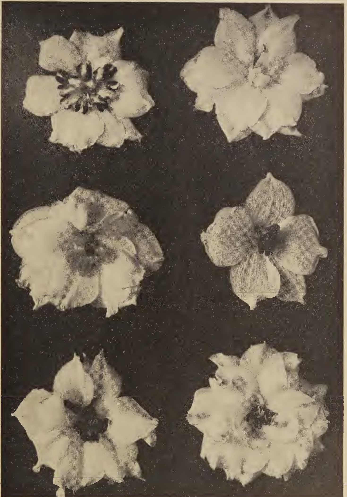
The HOODACRES WHITE varieties represented above are, in order of placement: VIKING, PEARL NECKLACE, ANGEL'S BREATH, VESTA, VELVABEE and a many-petaled specimen. (Florets about three-fourths natural size.)