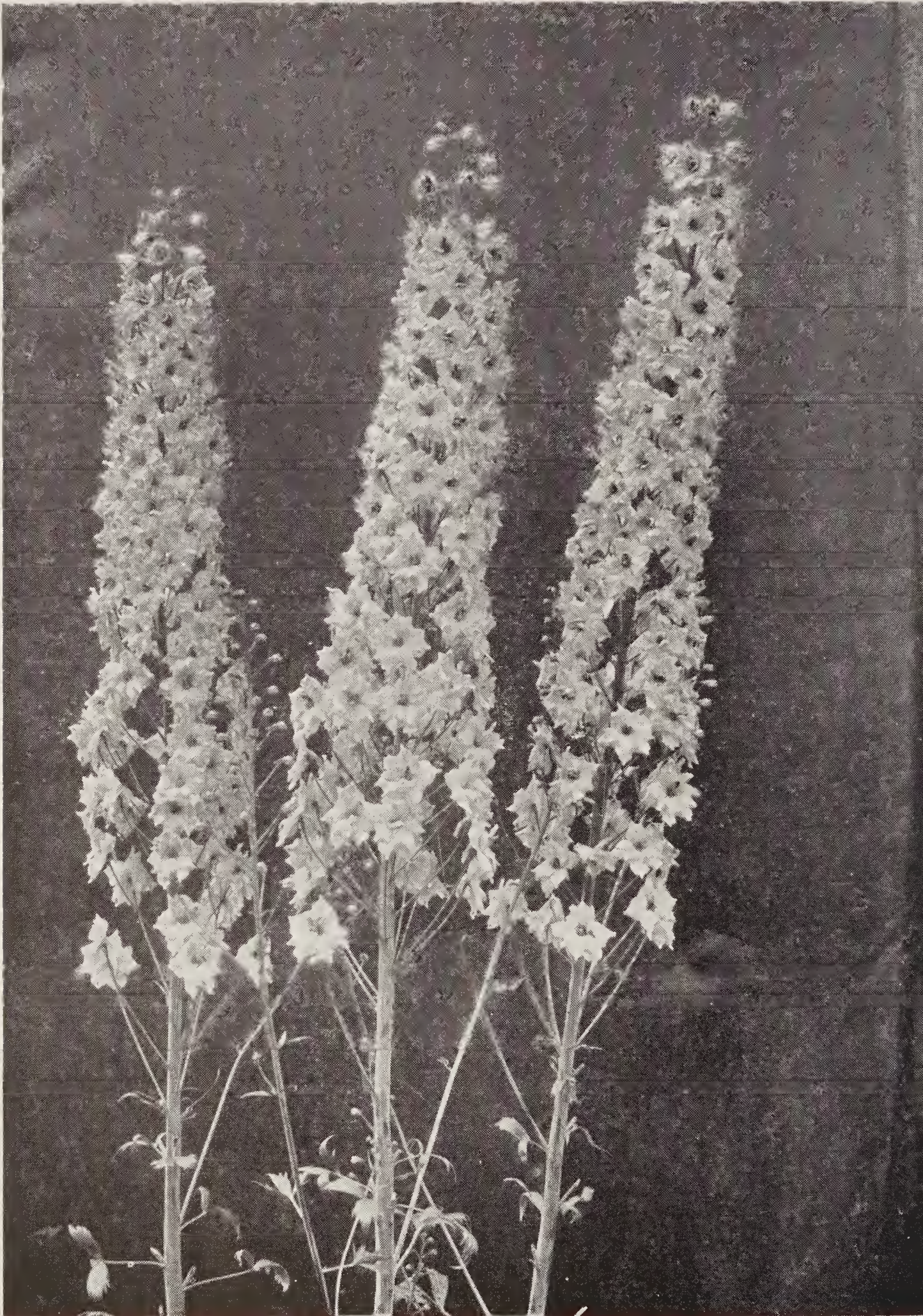
The IDEAL WREXHAM Form as Developed at Hoodacres.