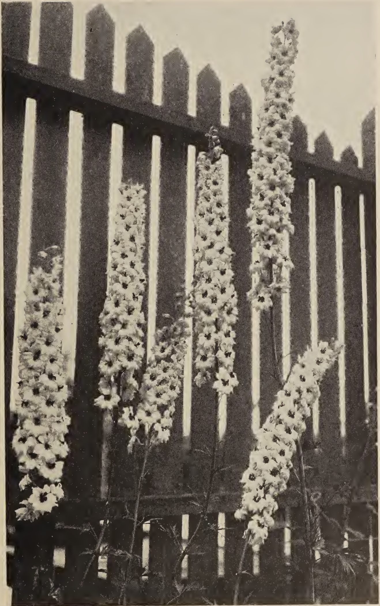
HOODACRES WHITE, VELVABEE Vaulting an Eight-Foot Fence.