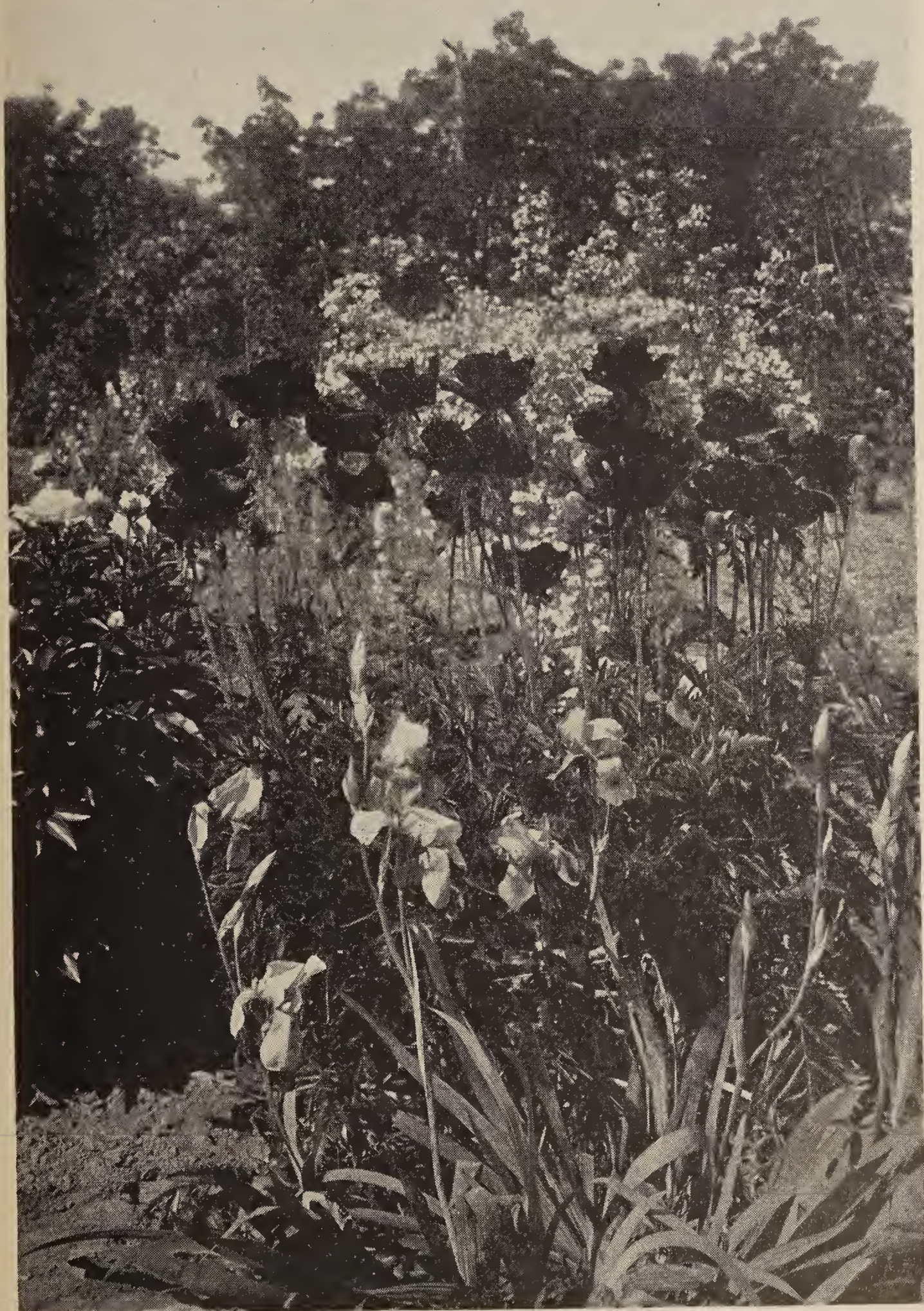
A plant of the great Oriental Poppy, AUSTRALIA, showing why its relative size and sturdy growth makes possible its wonderful color display.