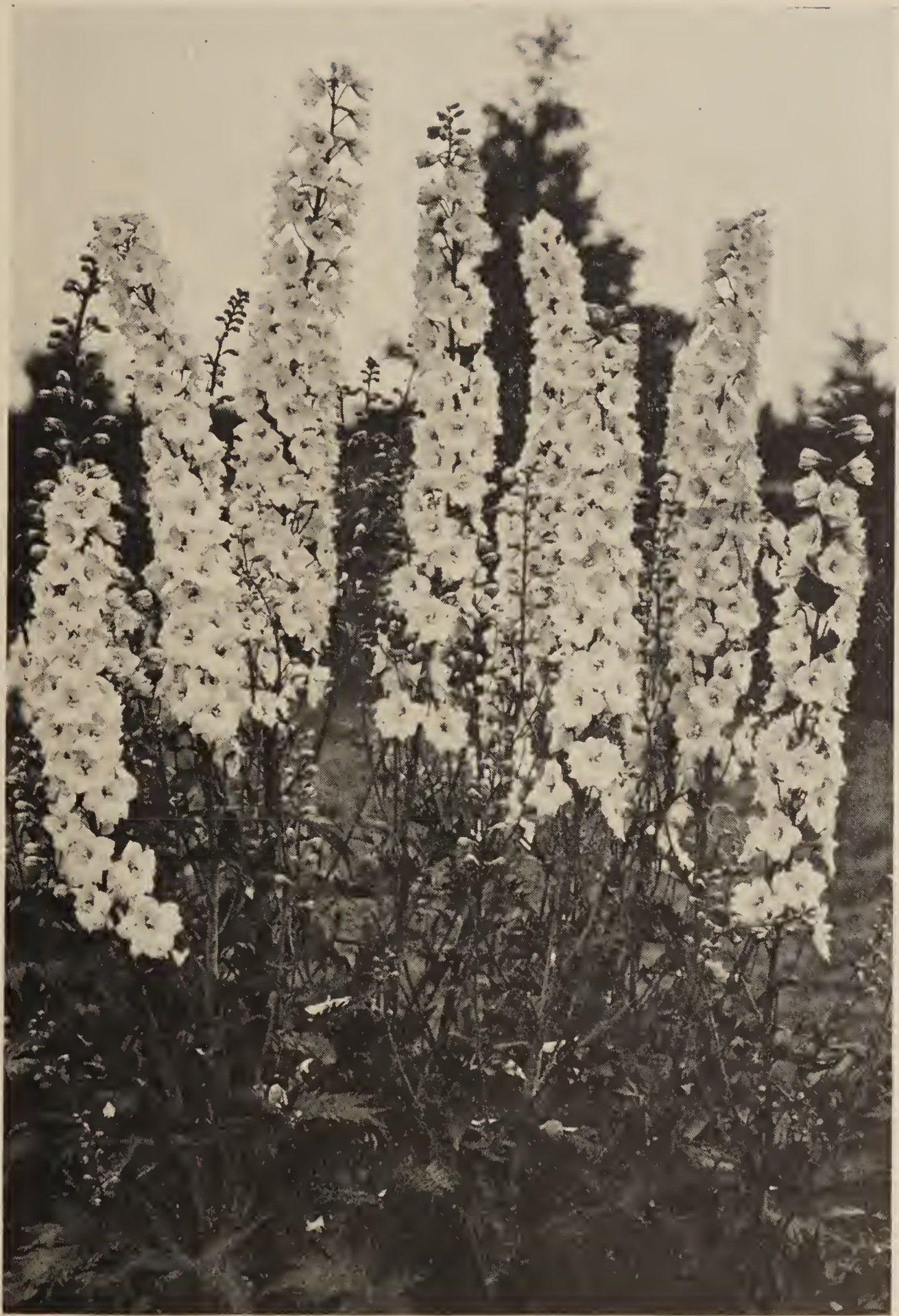
SHIPS MAST, Hoodacres White, one plant.