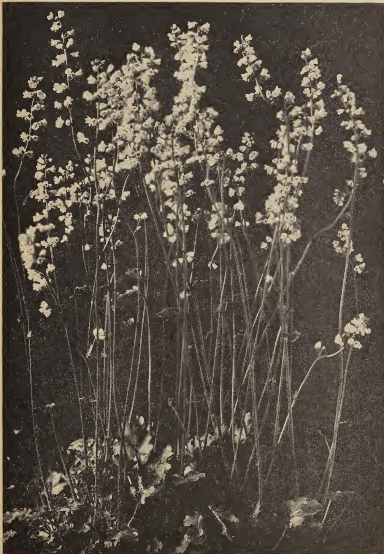
Hoodacres Hybrid Heuchera