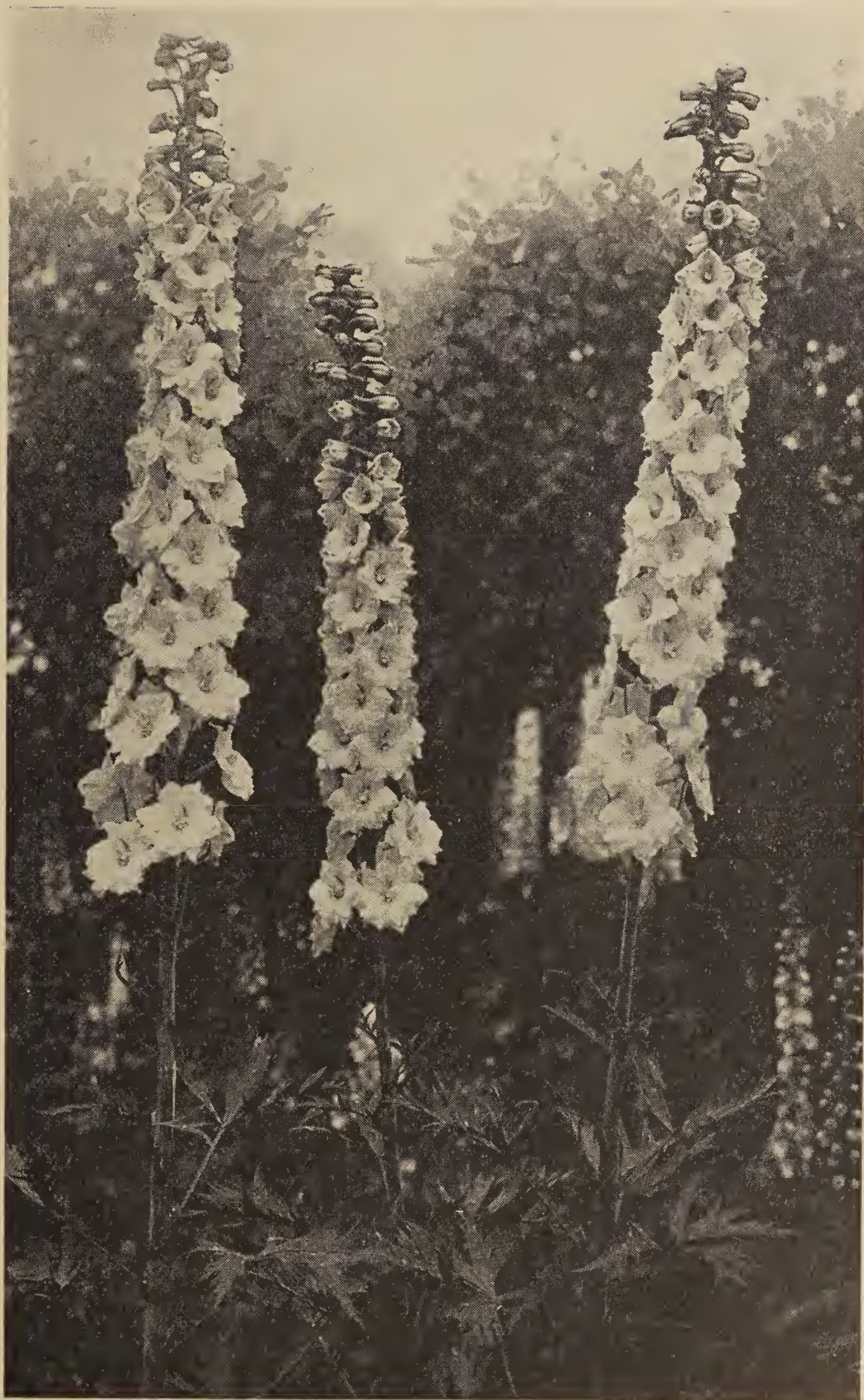
THE BRIDE, Beautifully Blushing.