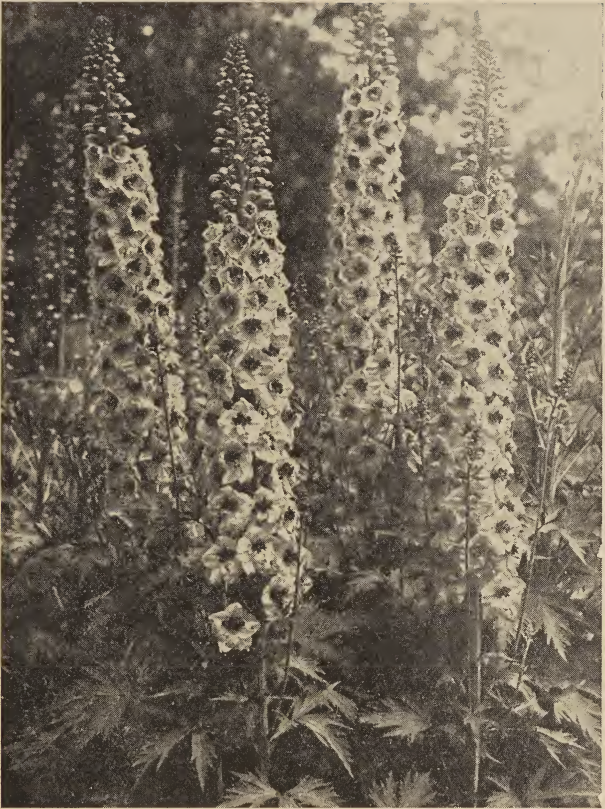
A Typical Wrexham Plant.