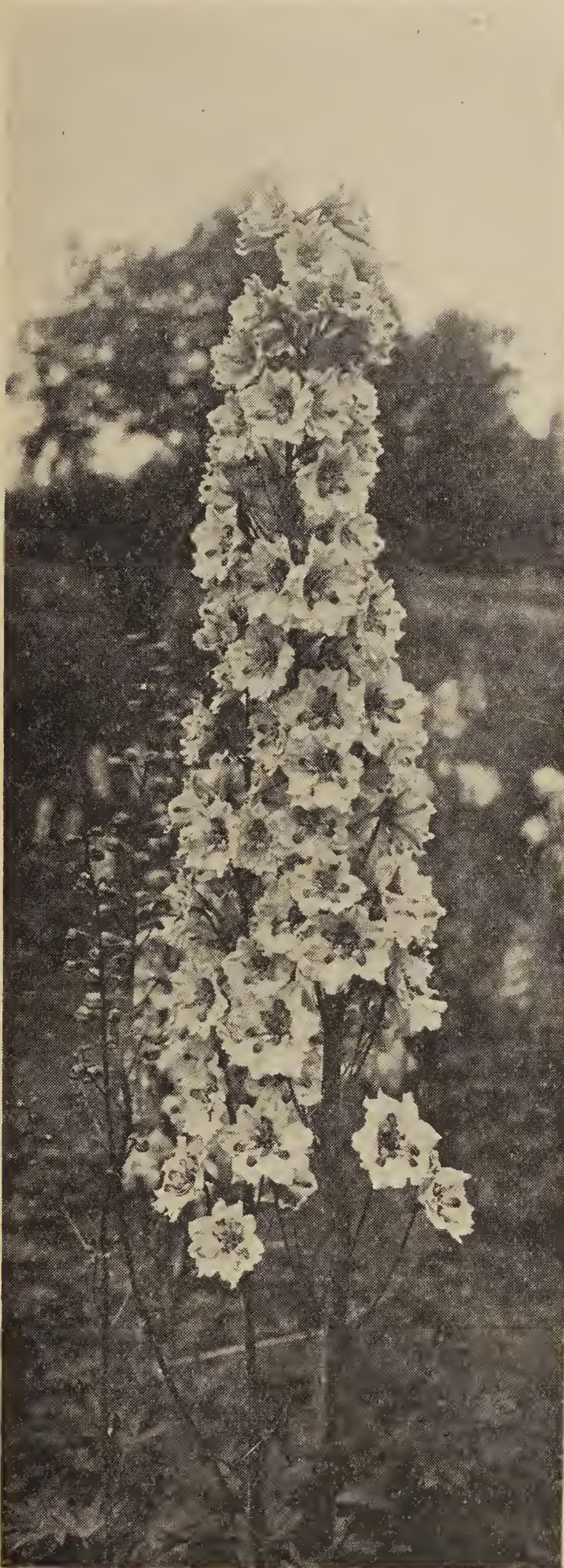
A surprising development of petals centre, in the Opalspire class.