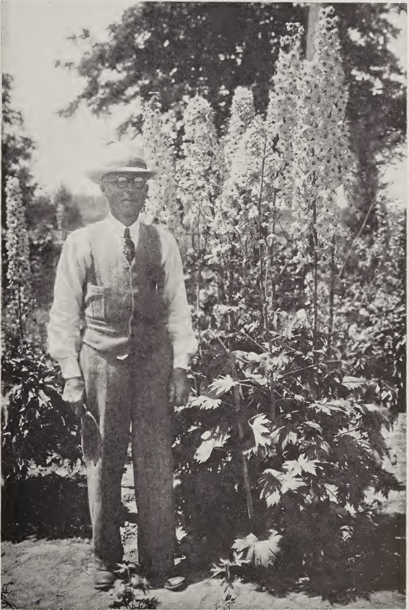
One Plant of REX OREGONUS