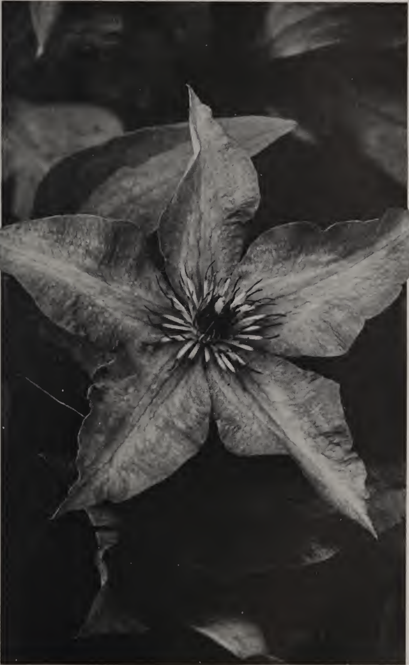
CLEMATIS, THE PRESIDENT