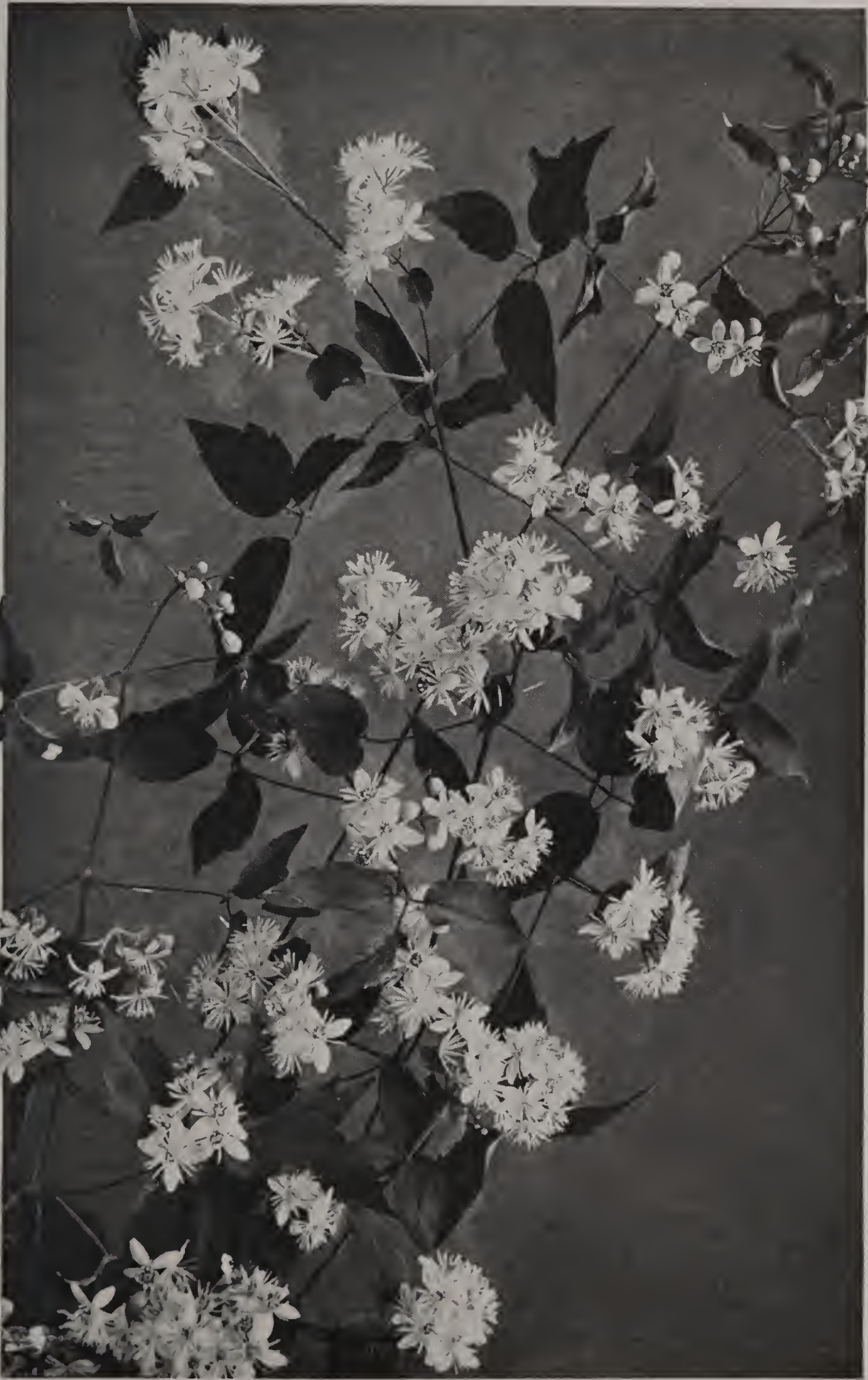
CLEMATIS VIRGINIANA, VIRGIN'S-BOWER