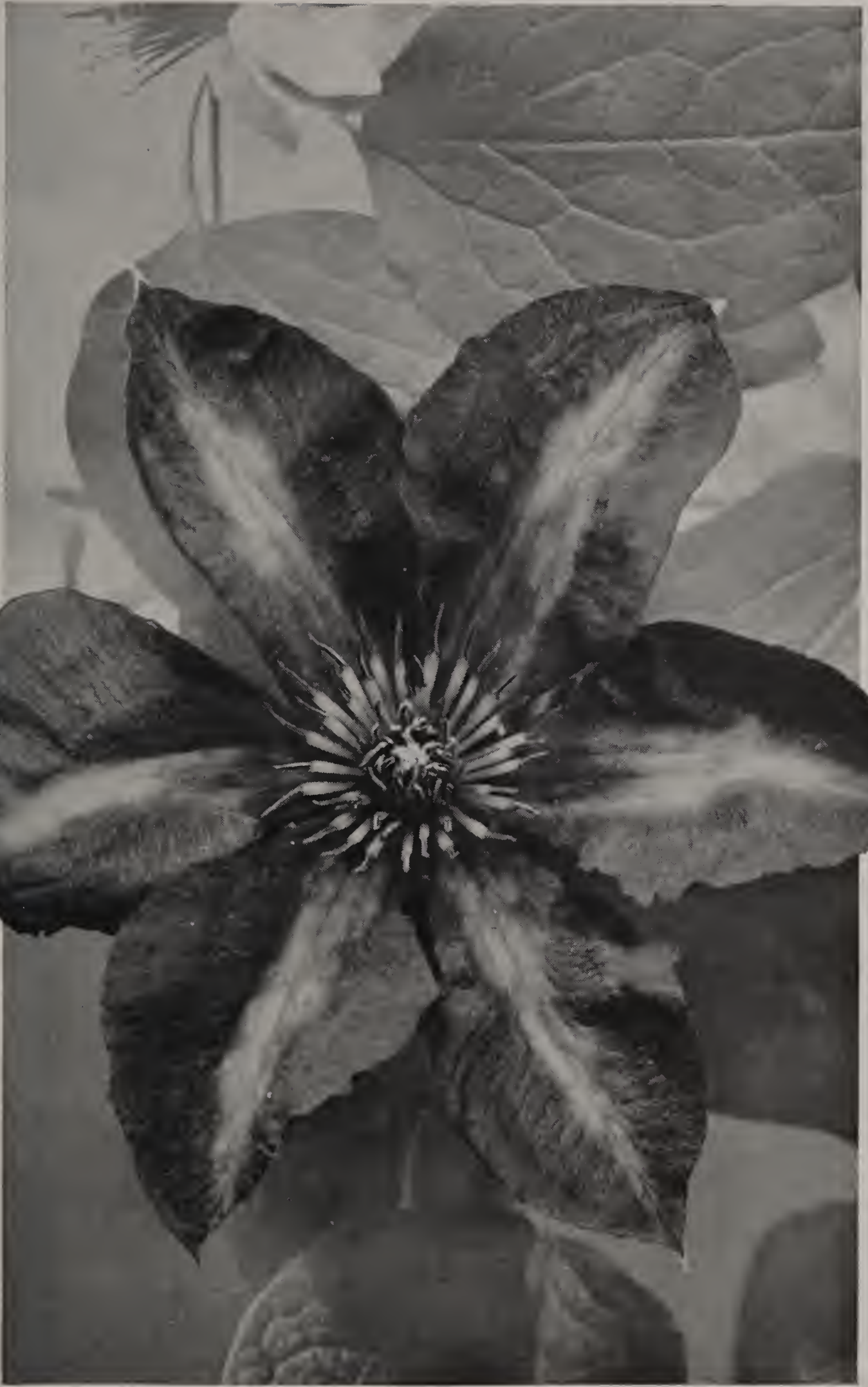
CLEMATIS, GIPSY QUEEN