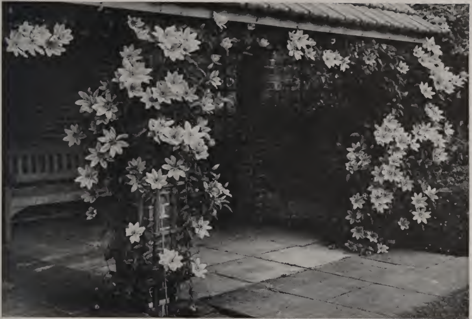
CLEMATIS, NELLY MOSER, LENDS ITSELF TO PILLAR TREATMENT

below zero without injury when a protective mulch had been used. It is the alternate freezing and thawing during winter months that does harm to plants, hence the reason for using a mulch. In the case of Clematis the injury occurs at the collar of the plant. For regions north of Washington, mulching is especially recommended not only the first winter, but as a cheap insurance every winter.