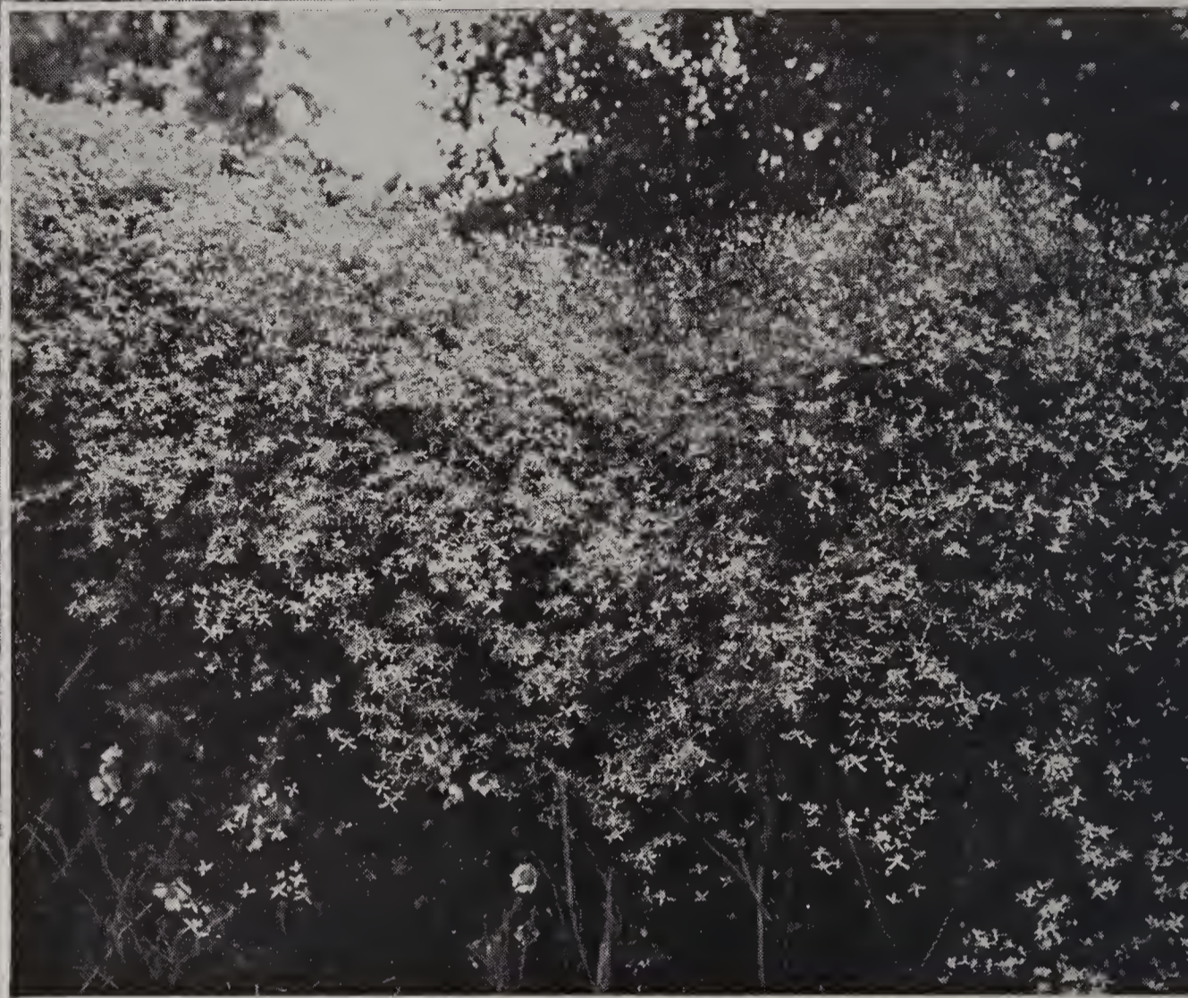
CLEMATIS FLAMMULA, A MEDITERRANEAN SPECIES