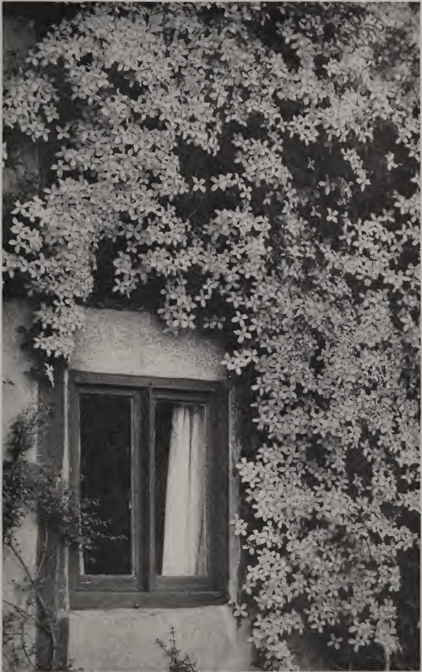
CLEMATIS MONTANA RUBENS