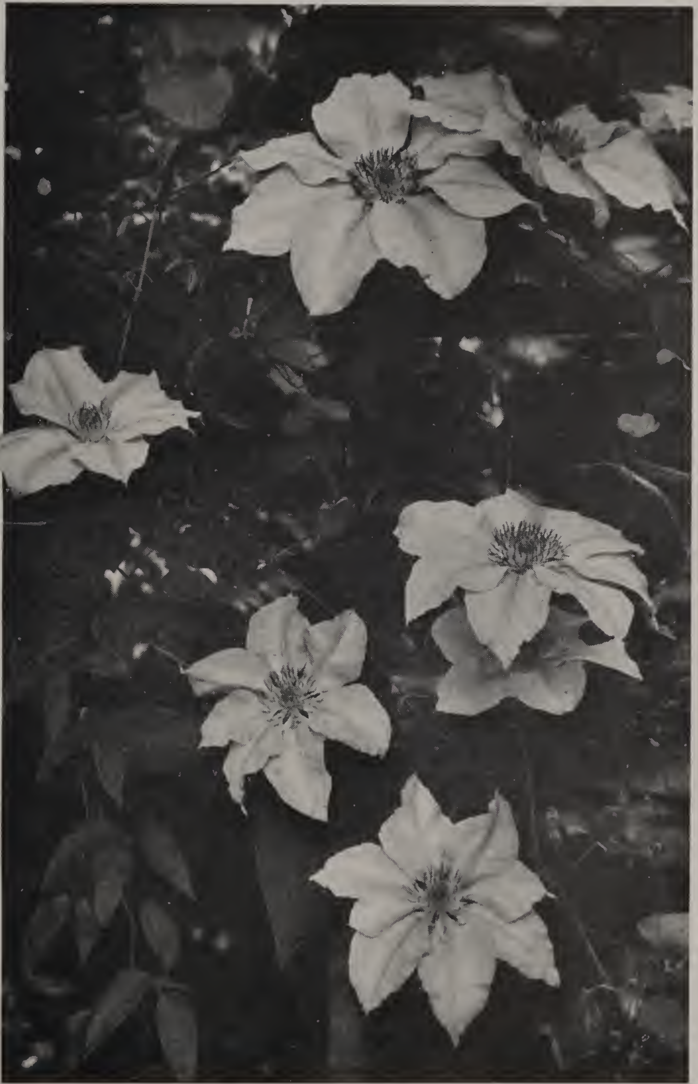
CLEMATIS, LADY CAROLINE NEVILLE