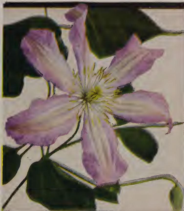
Comtesse de Bouchaud

Duchess of Albany, a hybrid of the scarlet Clematis of Texas, has a charm all its own.