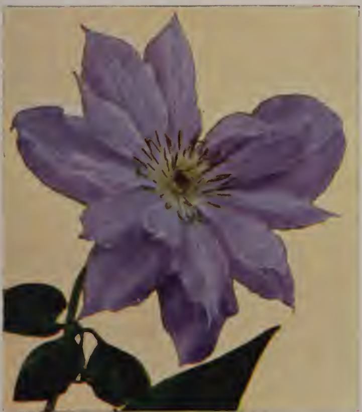
Belle of Woking