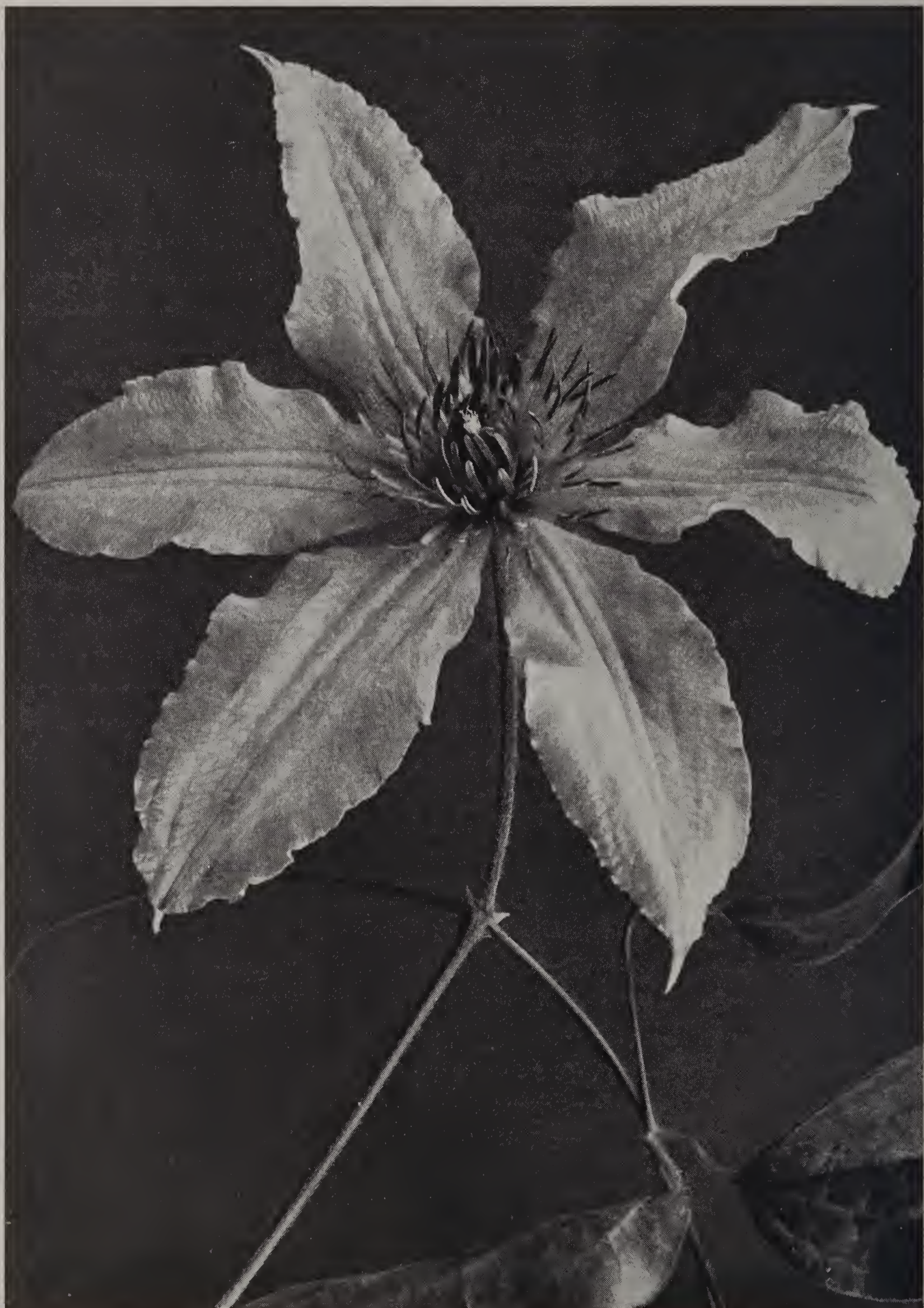
CLEMATIS, PRINS HENDRIK