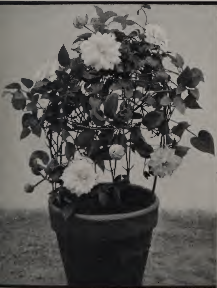
CLEMATIS ADAPTED TO POT-CULTURE See page 28

Prices cover strong two-year plants, grown on their own roots. Postage or express prepaid by us. Shipments will be made at proper planting time in your locality.