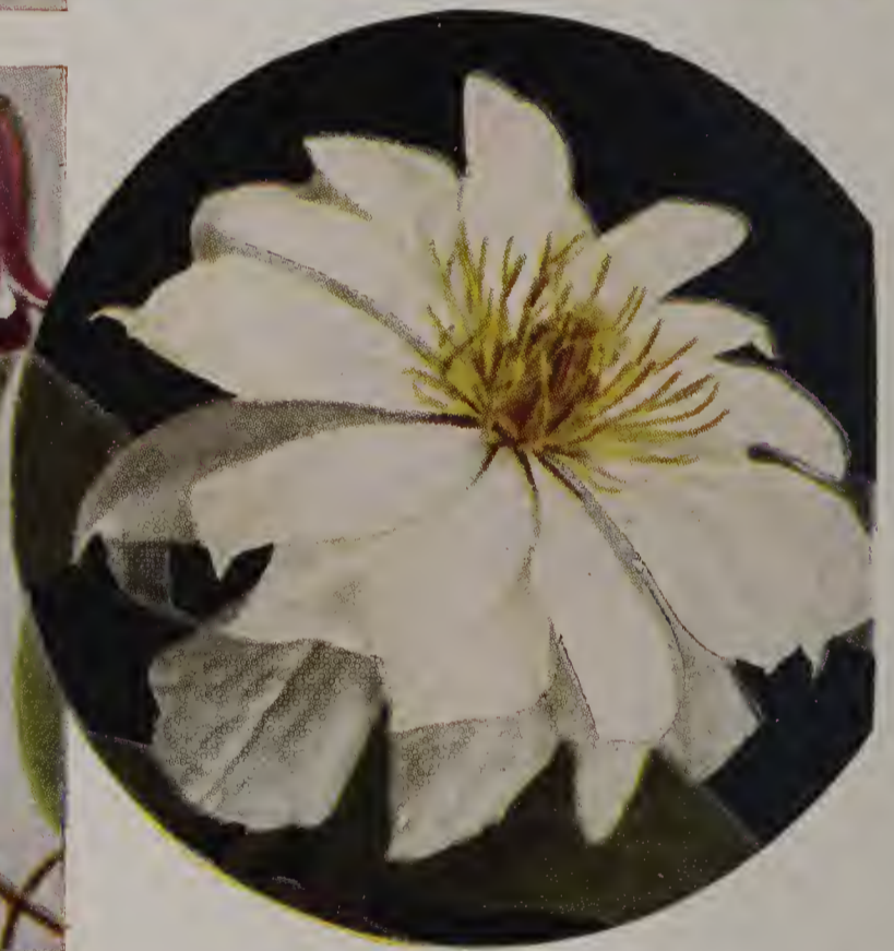
Duchess of Edinburgh