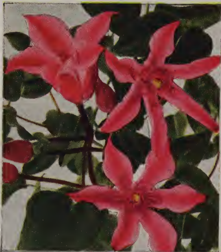
Duchess of Albany