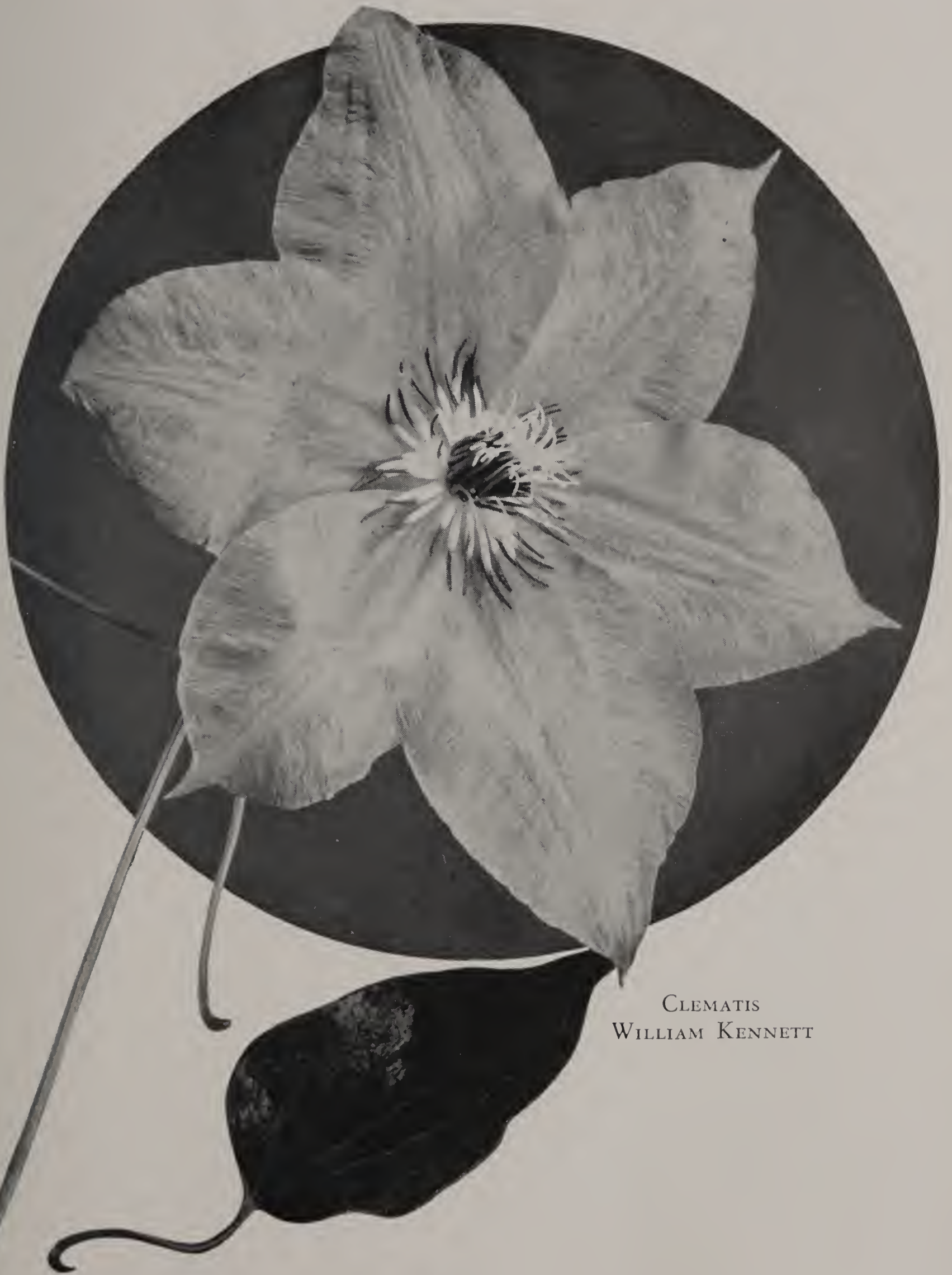
CLEMATIS WILLIAM KENNETT