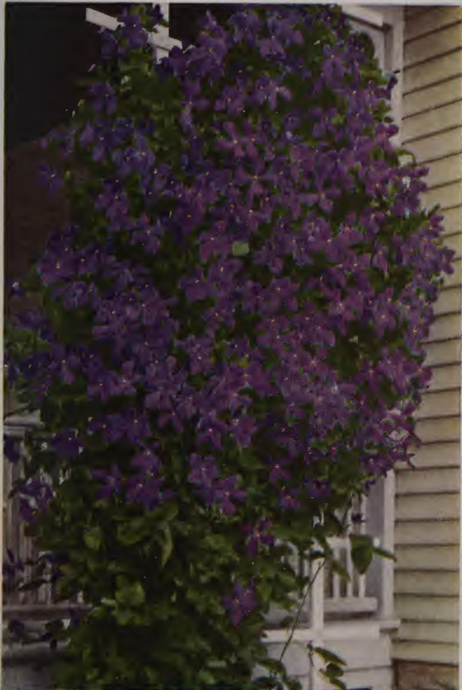
CLEMATIS JACKMANI, BLOOMING ABUNDANTLY