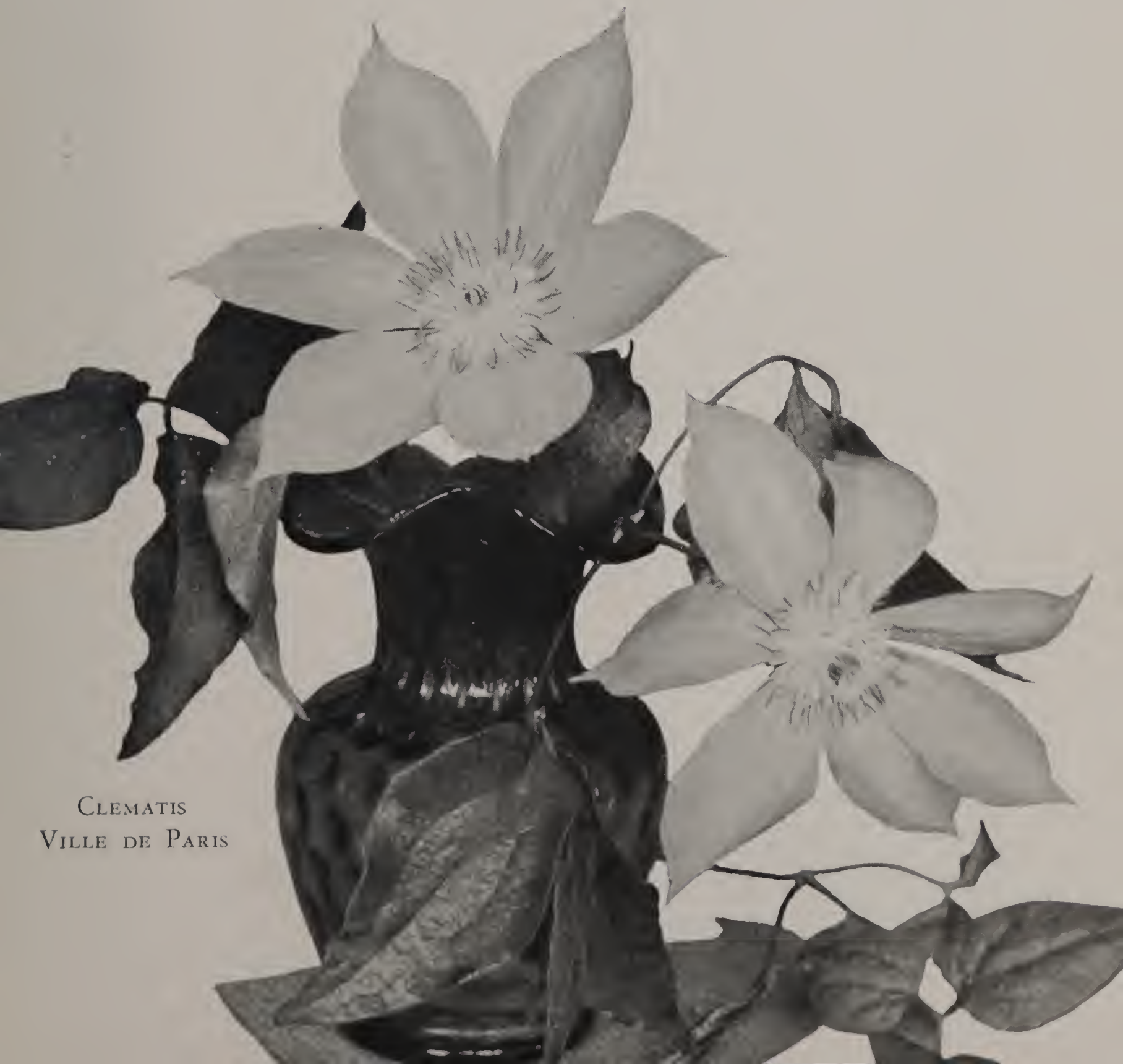
CLEMATIS VILLE DE PARIS