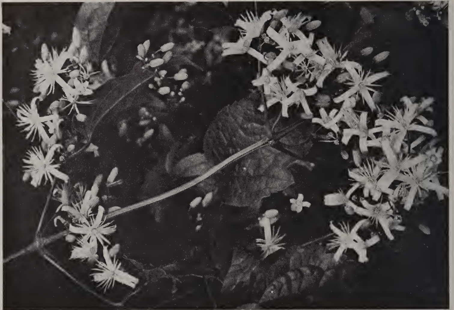
CLEMATIS JOUINIANA, SPINGARN VARIETY