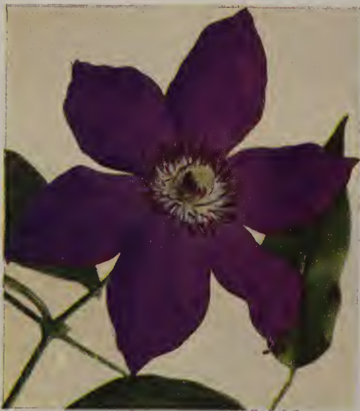
Ville de Paris