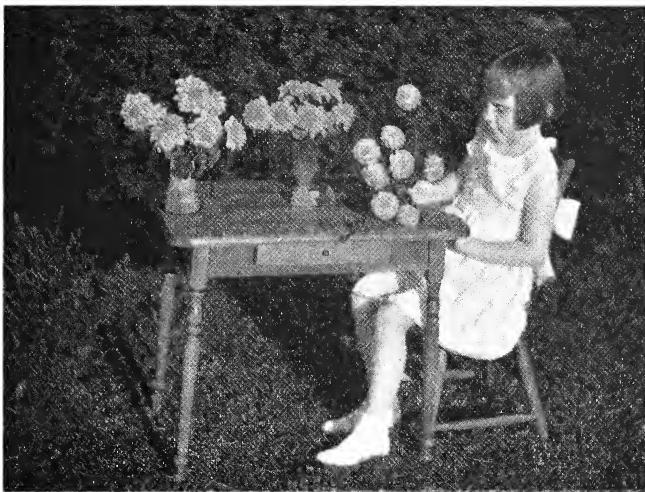
BUCKEYE JR., RED HEAD, BUCKEYE BABY