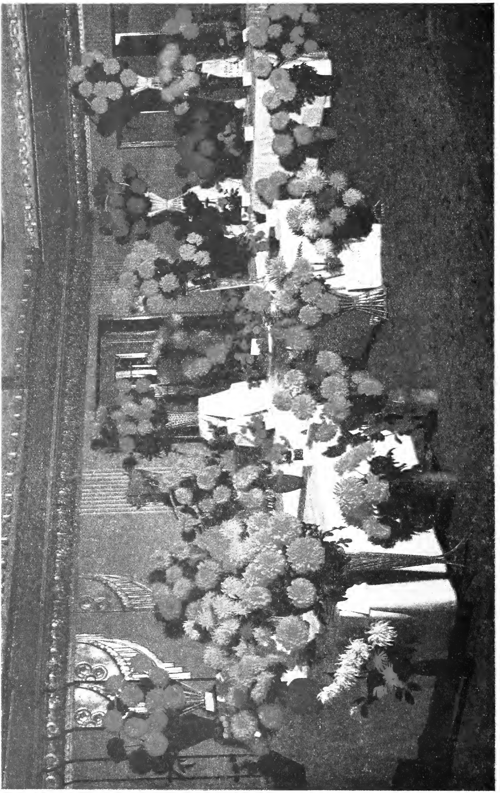
DAHLIAS IN ALL THEIR GLORY AT THE SHOW