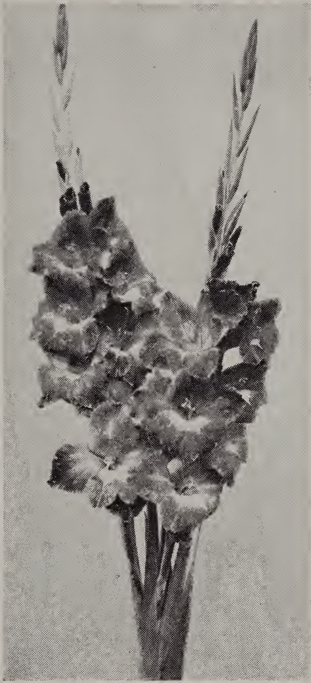
TENNYSON—See preceding page.