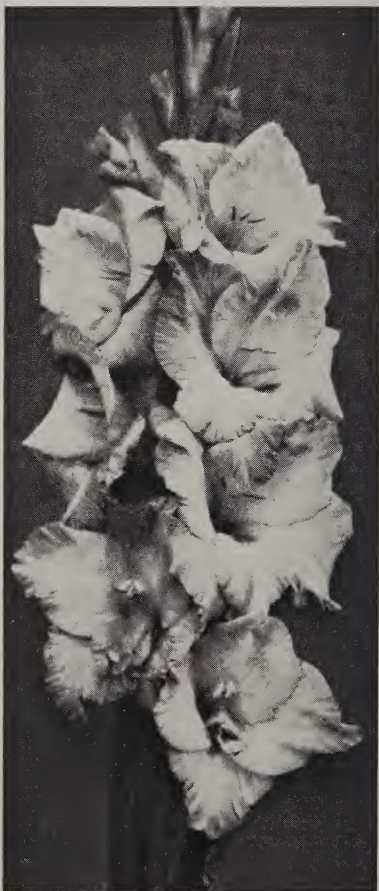
GEORGETTE —See page 4.

Tennyson. Nopal red, heavily striped with rich oxblood red, cream throat blotch. Tall spike, well formed flowers of good substance. Lighter in color in sandy soil, heavier soil brings out all the richness of coloring. L. 3 for 15c; M. 5 for 15c.