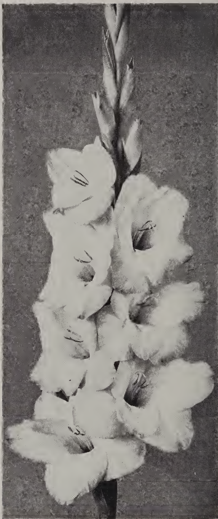
MINUET — See page 6.

Mrs. E. J. Heaton. Tall salmon with cream throat. L. 2 for 15c; M. 3 for 15c; S. 4 for 15c.