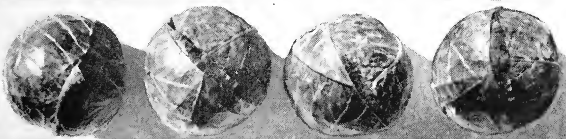
IMPROVED COPENHAGEN MARKET — Our 1932 Introduction