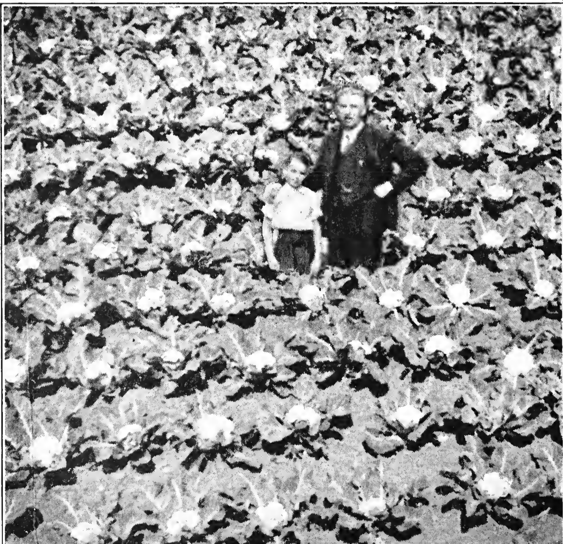
DANAMERICA SUPER SNOWBALL - Our 1934 Introduction