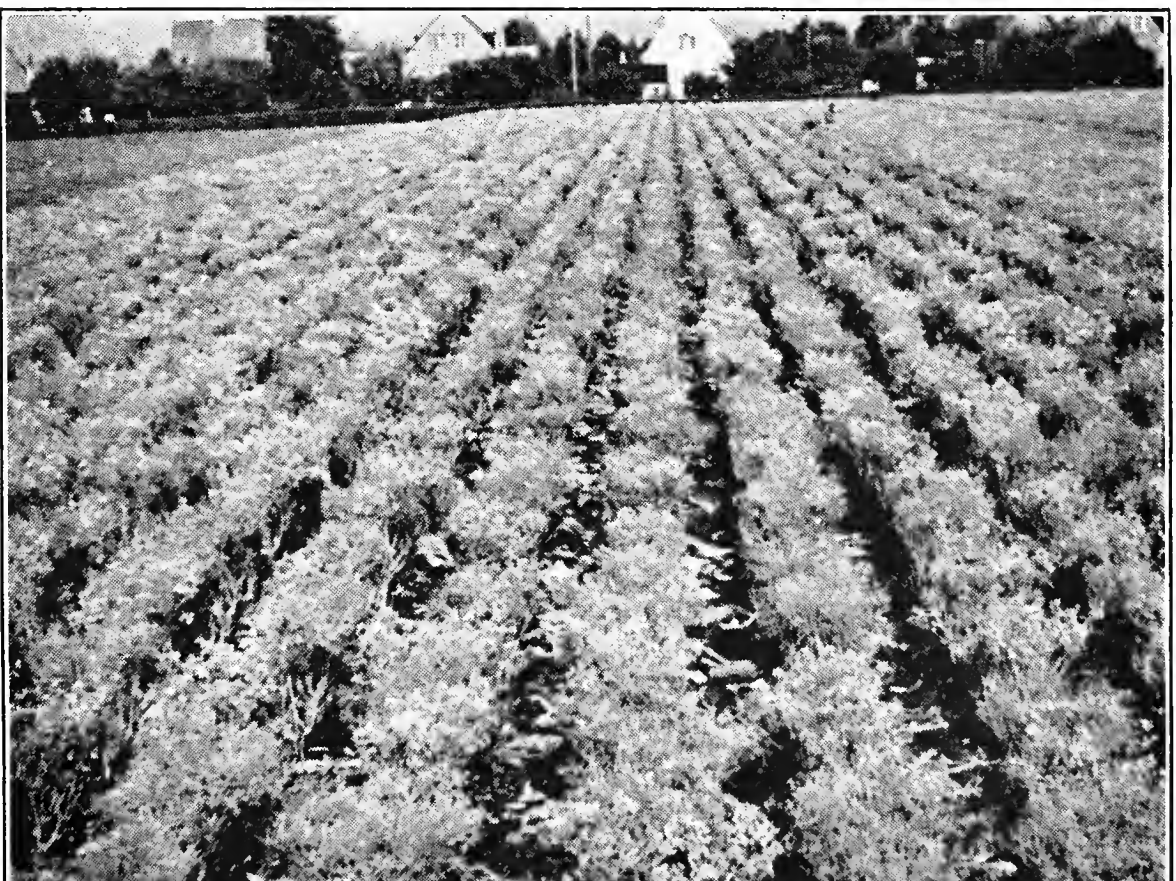
DANAMERICA SUPER SNOWBALL—In Seed, 1937 Harvest