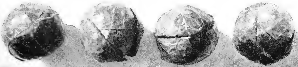
THE GOLDEN ACRE — Introduced By Us In 1922