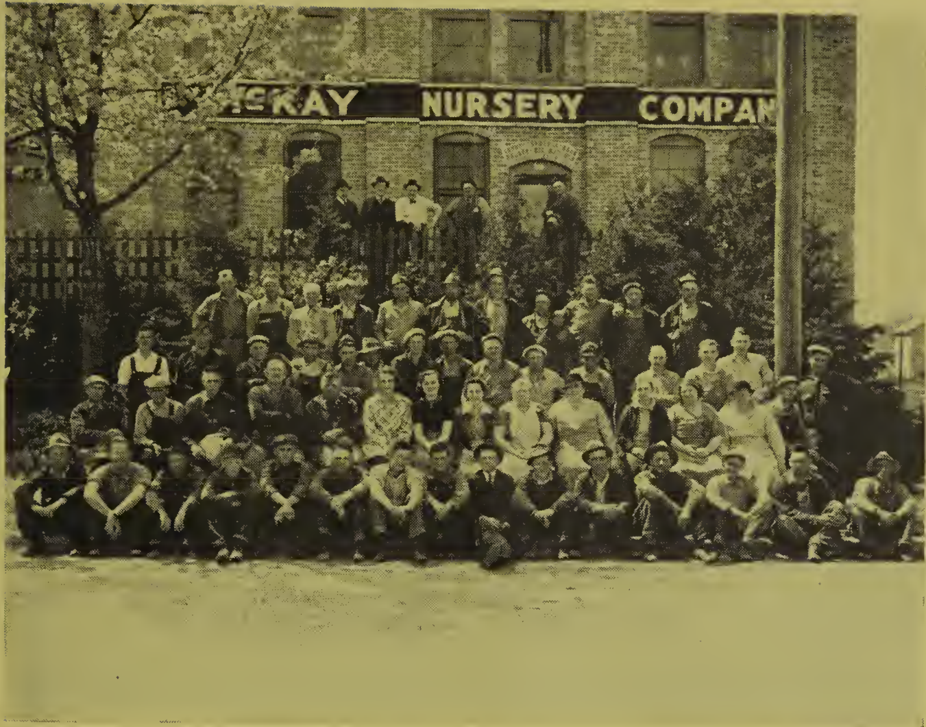
A portion of the McKay Nursery employees.