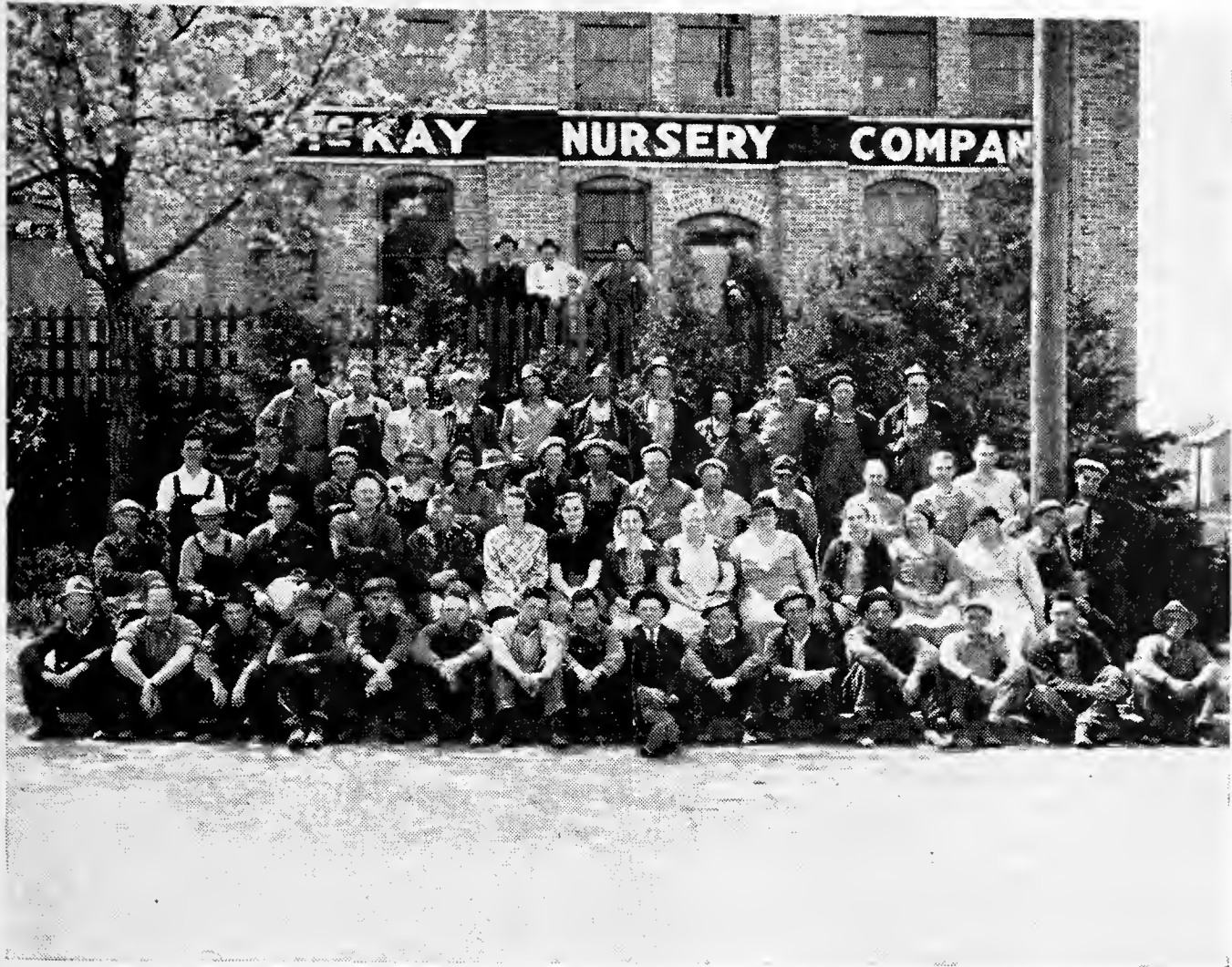
A portion of the McKay Nursery employees.