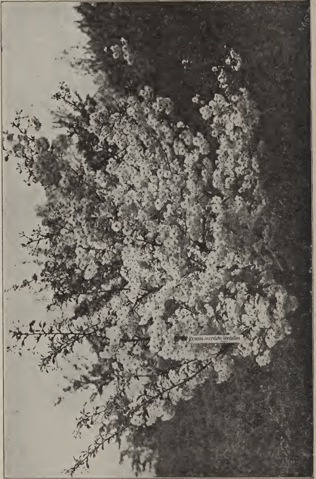
DOUBLE FLOWERING JAPANESE CHERRY.