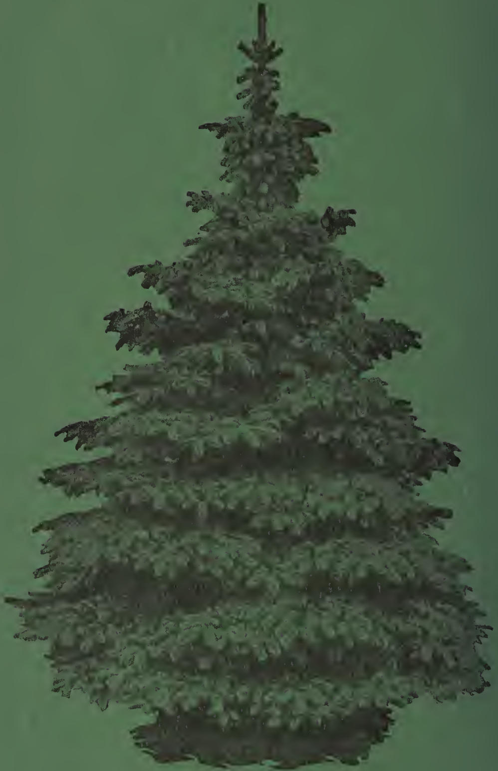
KOSTERS BLUE SPRUCE