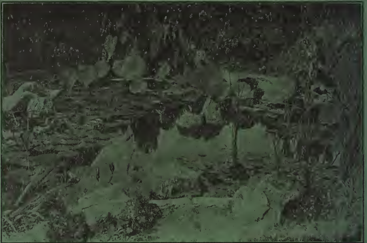
WATER LILIES AT THE WEST END NURSERY.