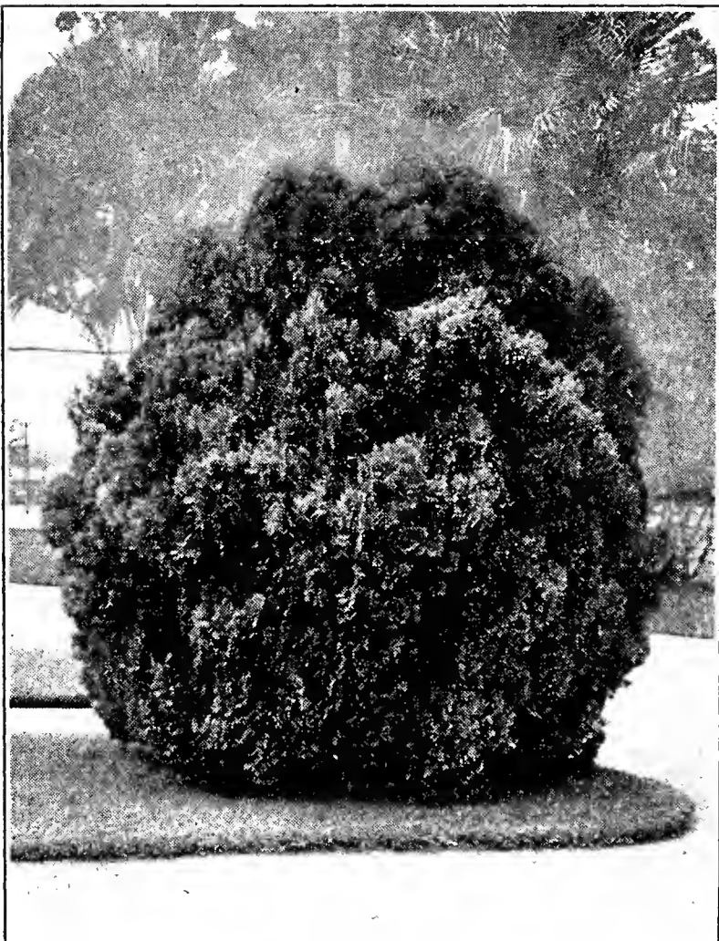
THUYA AUREA NANA