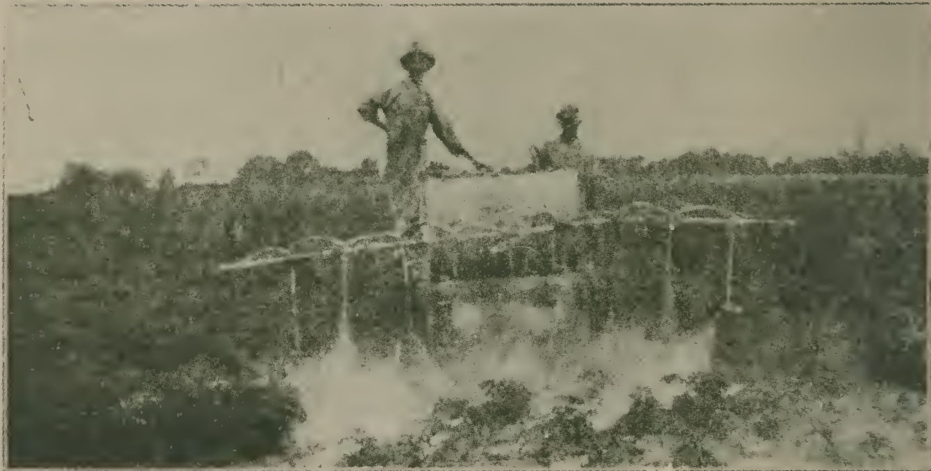
Spraying Tomato Plants