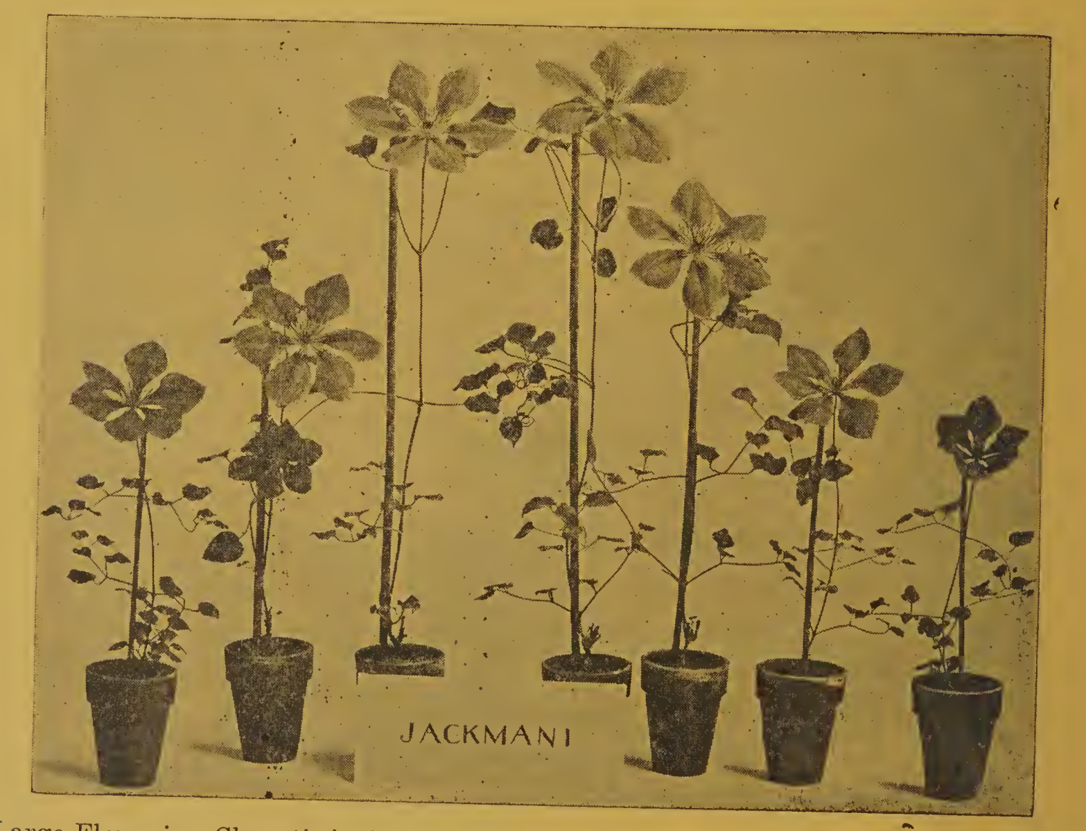
Large Flowering Clematis in 3" pots, with 24" green stakes. Special shipping containers furnished to guarantee safe arrival.