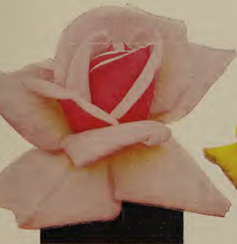
EDITH NELLIE PERKINS

PARAMOUNT ROSES ARE GUARANTEED TO GROW AND BE TRUE TO NAME