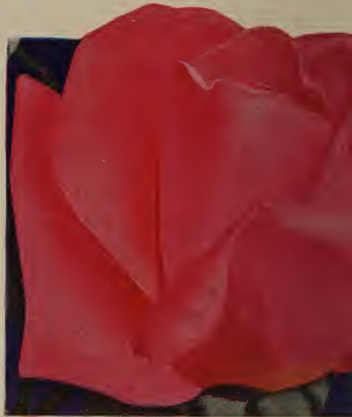
SOUV. DE MME. C. CHAMBARD

The Same 6 Roses in $4.75 Super-Colossal Size Delivery Free