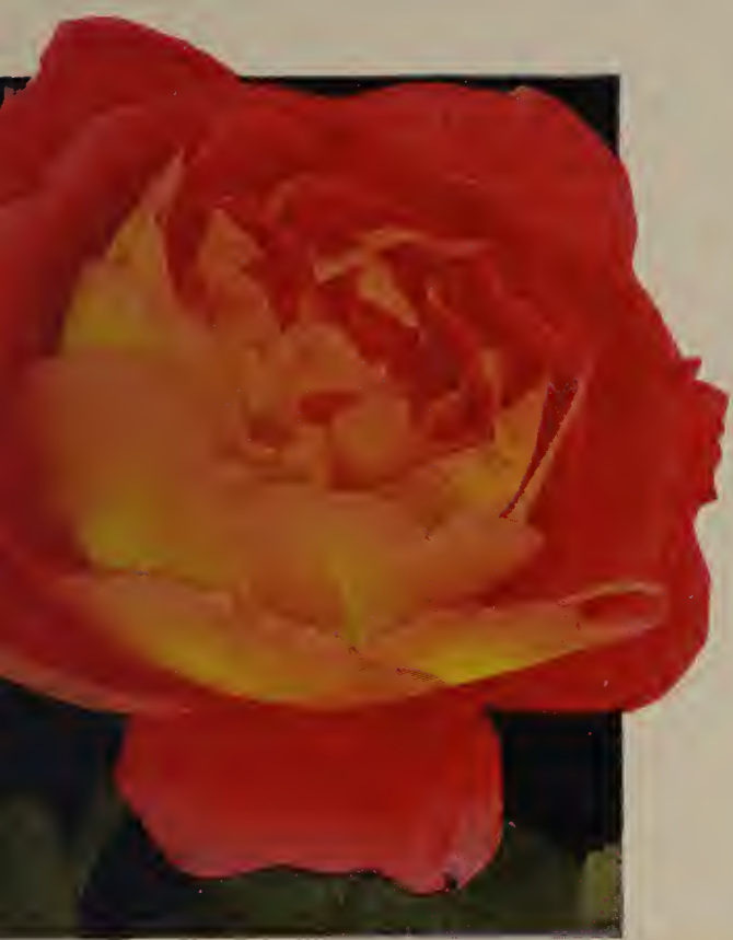
CONDESA DE SASTAGO