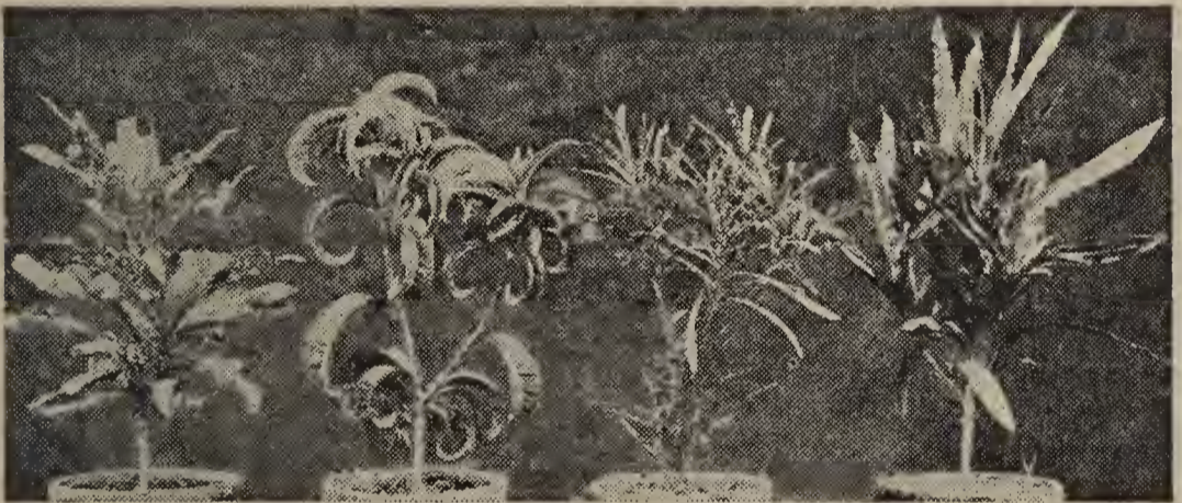
Fig. 16½—Crotons. 4 Types

YELLOW ELDER Stenolobium sambucifolia . Foliage light green, beautiful masses yellow flowers twice a year. Small, 25c; Med. 45c; Large, 75c.