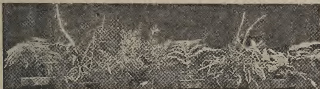
Fig. 55 .. 56 .. 57 .. 58 .. 59 .. 60 Fig. 55—Lace Asparagus Fern. Fig. 56—Tape Worm Plant. Fig. 57—Asparagus Fern. Fig. 58—Artillery Plant. Fig. 59—Pteris Fern. Cut Leaved. Fig. 60—Pteris Fern Variegated.

SPANISH MOSS Dendropogon usneoides . The well known wild, long moss found growing all over Florida. Beautiful and odd. Small, 10c; Med. 25c; Large, $1.00.