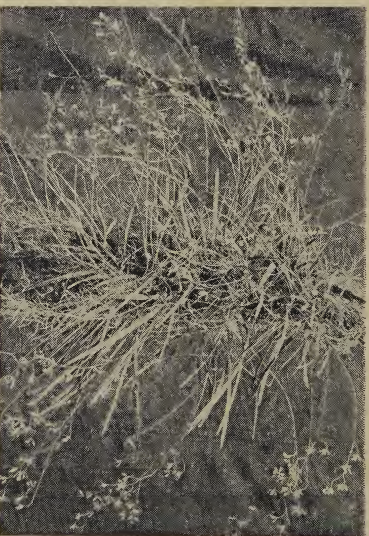
BUTTERFLY ORCHIDS (Epidendrum Tampuanse)