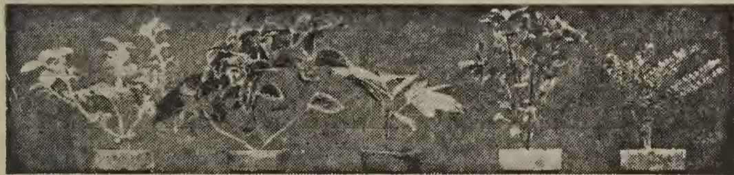
Fig. 72 .. 73 .. 74 .. 75 .. 76

CHRYSANTHEMUM. Showy semi-double flowered bushy types, colors, yellow or pink. Small, 15c; Med. 25c;