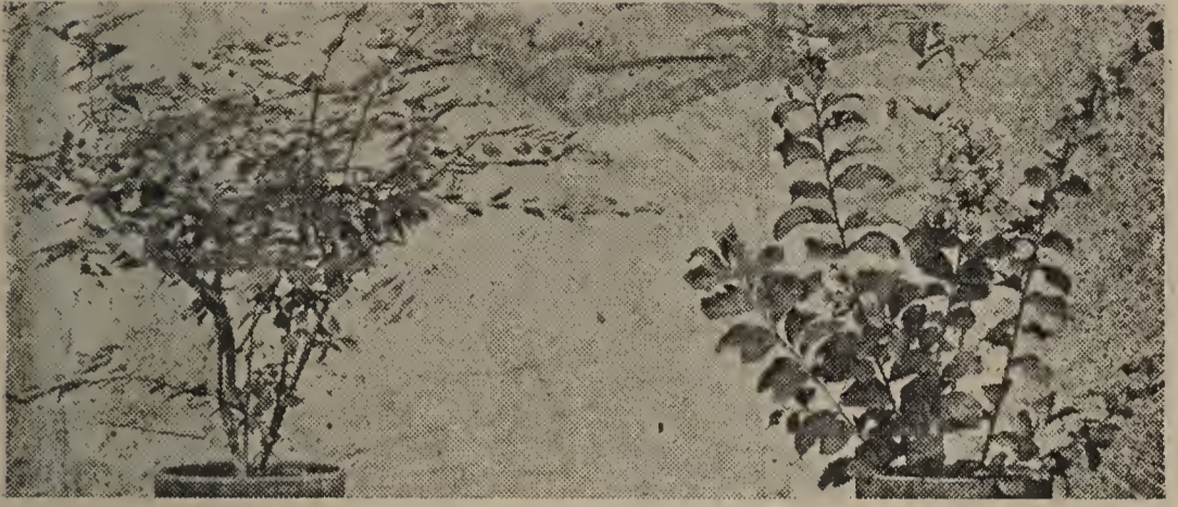
Fig. 7—ABELIA GRANDIFLORA