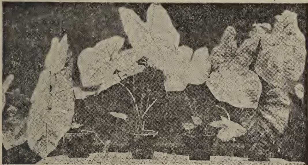
Fig. 71— Caladium Fancy Leaved .

BLUE SAGE Daedalacanthus nervosus . Prominent veined, dark green leaves; fine heads of dark blue flowers in winter. Small, 15c; Med. 25c; Large, $1.00.