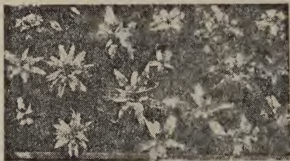
Fig. 77— Cryptanthus acaulis growing in a flat filled with peat moss. Top view.

CLUB MOSS OR MOSS FERN. Tall type, green-like fern, 3 to 5 inches. Small, 25c; Med. 50c; Large, -----