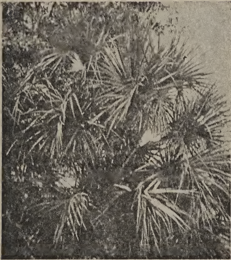
Fig. 25—Cabbage Palmetto.

COONTIE or COMPTIE Zamia integrifolia . A dwarf cycad, excellent for tubs and urns in dry, sunny positions. Small, Med. 50c; Large, $1.50