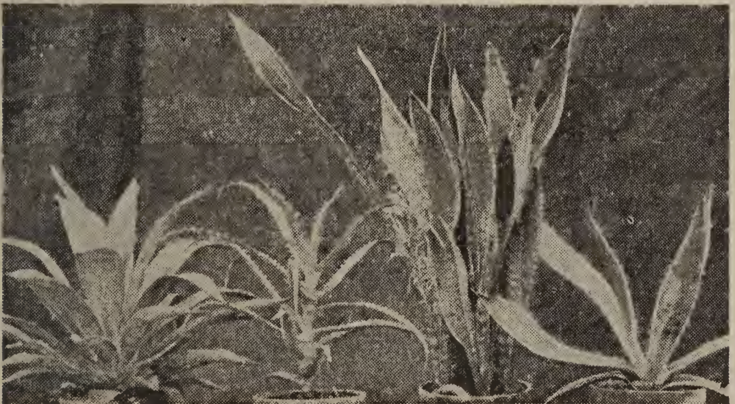
Fig. 40 41 42 43 Fig. 40—Dwarf Century Plant. Fig. 41—Aloe Arborescens. Fig. 42—Golden Striped Snake Plant. Fig. 43—Striped Century Plant.

OPUNTIA sp Small. Native Florida small types. Yellow flowers. Small, 10c; Med. 25c; Large, 50c.