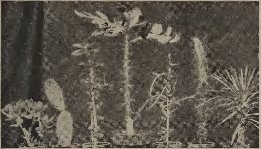
Fig. 33 34 35 36 37 38 39 Fig. 33—Jade Plant. Fig. 34—Opuntia sp. Large. Fig. 35—Crown of Thorns. Fig. 36—Opuntia Braziliensis. Fig. 37—Pencil Cactus. Fig. 38—Cereus triangularis. Fig. 39—Spanish Bayonet.