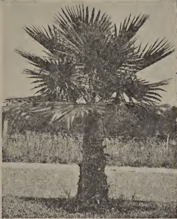
Fig. 24—Thread Palm.