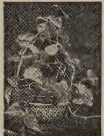
Fig. 28—Sky Vine. Fig. 29—Philodendron Cordatum

HALLS HONEYSUCKLE . Flowers white, turning yellow, fragrant. Hardy. Small, 15c; Med. 35c; Large, 50c.