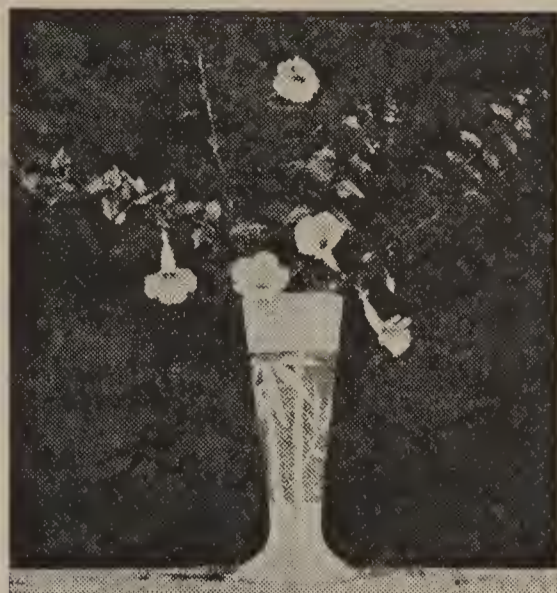
Fig. 15--Thunbergia Erecta.

GOLDEN TRUMPET: Allamanda. One of the most gorgeous tropical plants grown in Florida. Can be grown either as a vine or shrub. Flowers large, pure golden yellow, contrasting beautifully with the glossy green foliage. Small, 25c; Med. 50c; Large, 75c.