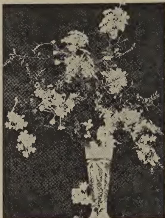
Fig. 16—Plumbago Capensis.

MALPIGHIA COCCIGERA, Dwarf Holly. A charming very small shrub with holly-like small, prickly leaves and bright pink flowers, scarlet berries. Small, 15c; Med. 35c; Large, 65c.