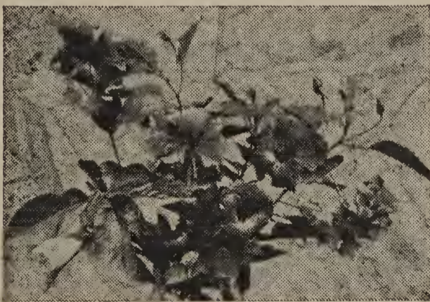
Fig. 9— Chinese Hibiscus

CHINESE PRIVET. Small bright green leaves, can be sheared into almost any shape. Hardy to Virginia. Small, 10c; Med. 20c; Large, 75c.