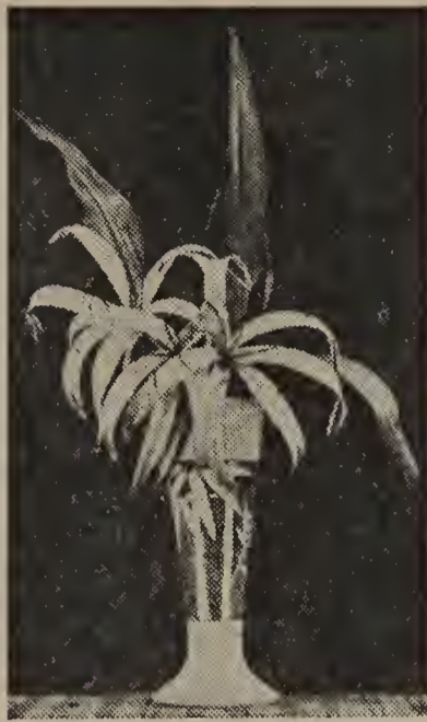
Fig. 85—Crinum Flowers.