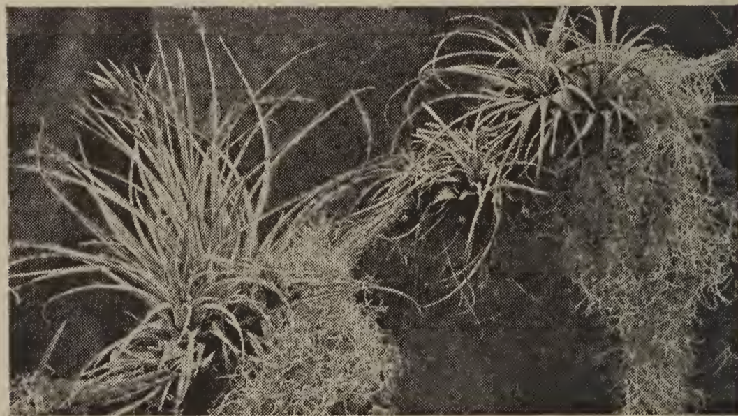
Fig. 54—Air Pines and Spanish Moss growing on a limb of a Cypress Tree.

WATER HYACINTH Piaropus crassipes . A beautiful floating water plant with bright blue flowers borne in hyacinth like spikes. One of the very best water garden plants. Small, 15c; Med. 25c; Large, 50c.