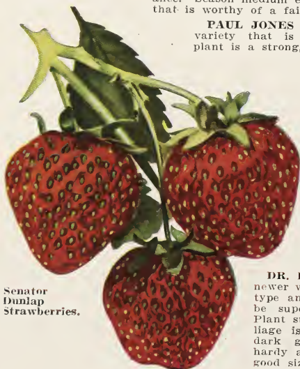
Senator Dunlap Strawberries.

DR. BURRILL. One of the newer varieties. Of the Dunlap type and claimed by some to be superior to that variety. Plant strong and healthy. Foliage is large, of a beautiful dark green color and very hardy and healthy. Berry is good size, bright red, uniform in shape, and of good quality.