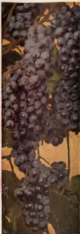
Concord Grapes. Reduced Size.

WORDEN. A splendid grape of the Concord type, but earlier; larger in bunch and berry and of decidedly better quality; vine as hardy as the old standby and in every way as healthy.