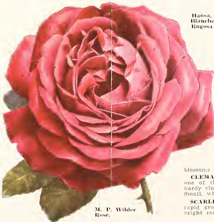
M. P. Wilder Rose.

SCARLET TRUMPET HONEYSUCKLE . A strong, rapid grower; blooms very freely the entire season; bright red trumpet-shaped flowers.