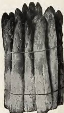
Conover's Colossal Asparagus.

VICTORIA. Early, large, good for either market or home use.