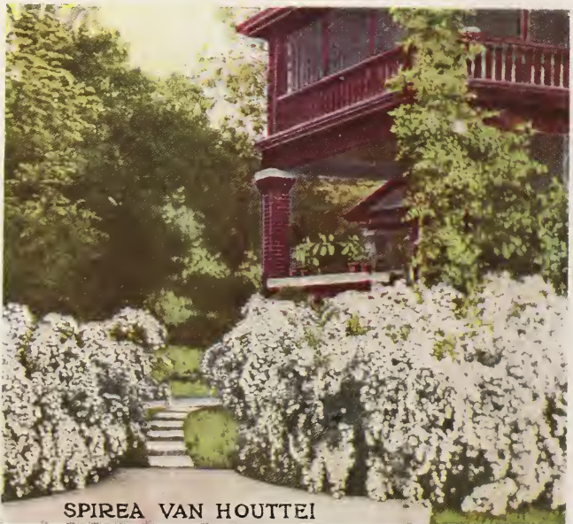
SPIREA VAN HOUTTEI

WEIGELA EVA RATHKE. A charming new Weigela with bright crimson flowers; a beautiful, distinct shade. Blooms all summer. Not quite so hardy as Rosea.