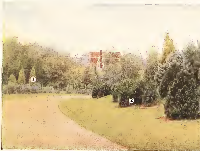
No. 1, Pyramidal Arbor-Vitae. No. 2, Mugho Pine. No. 3, Colorado Spruce. No. 4, Colorado Blue Spruce. No. 5, American Arbor Vitae. No. 6, Norway Spruce.