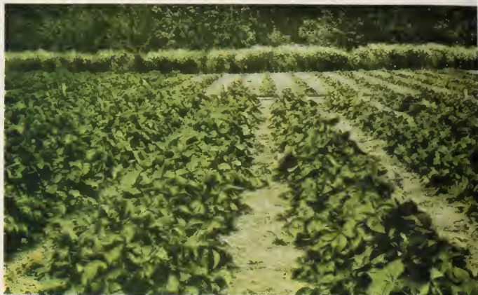
Strawberry Bed Showing Plants Grown in the Mat