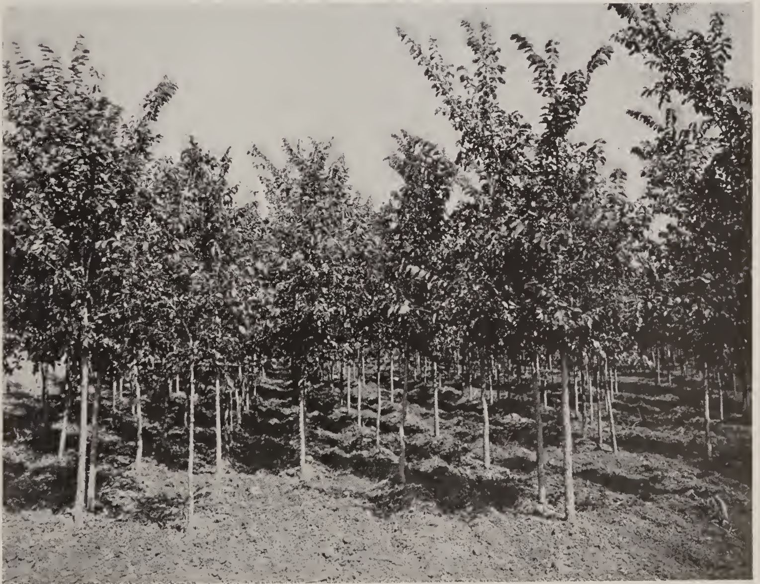
A Block of Well Spaced American Elm

COTTONWOOD ( Populus deltoides )—Large and spreading and desirable for quick shade; leaves like the Poplar and because of their continued rustling give a sound of cool breezes even on the hottest days.