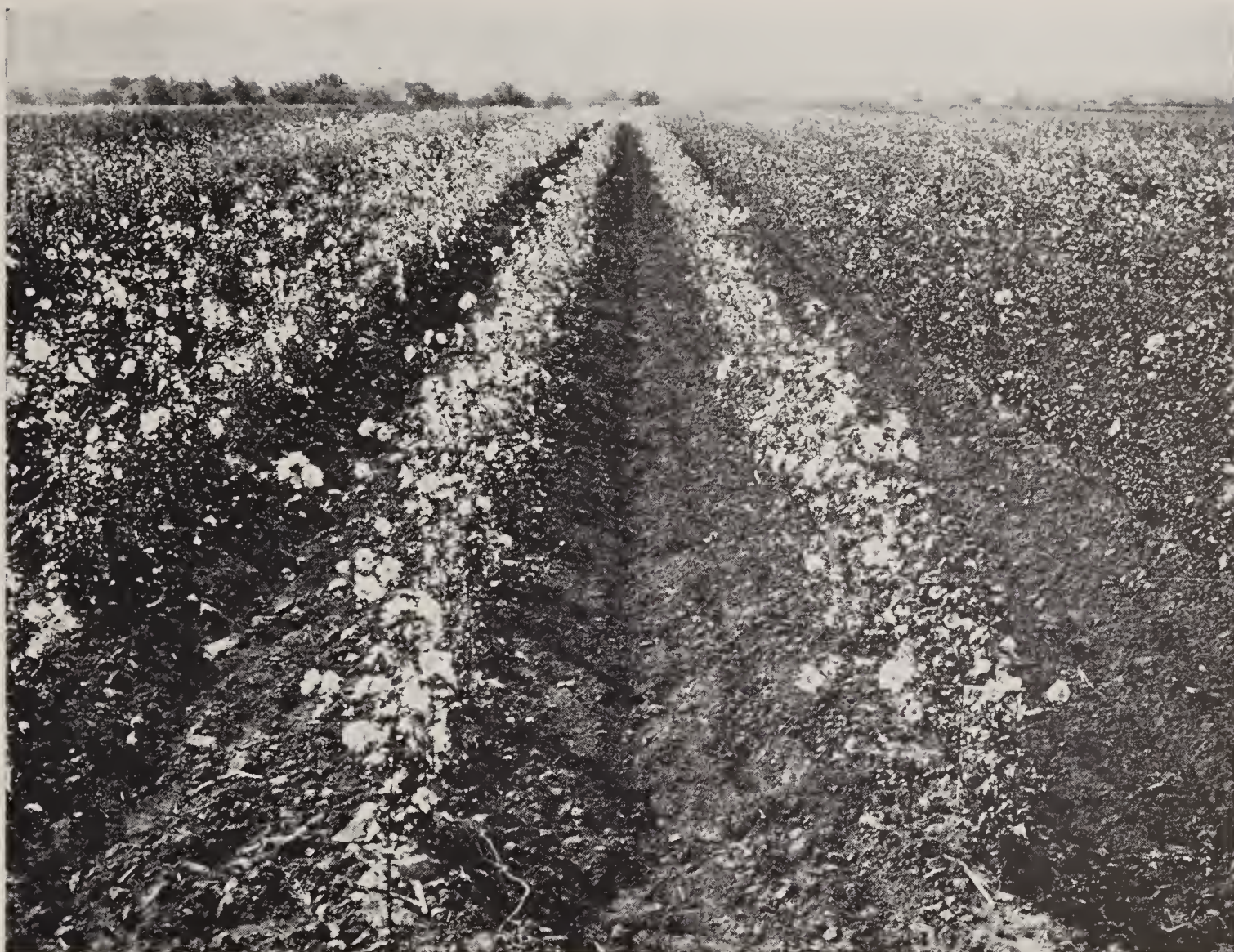
Field of Althea in Bloom

BROOM, SCOTCH ( Cytisus scoparius )—Will grow better in poor but well-drained, sandy soil than in heavy clay. While the plant is not evergreen, the slender straw-like twigs remain green, giving the effect of an evergreen. The yellow, pea-shaped flowers are very showy in early summer. Not hardy in Sections B and northern portion of Section C.