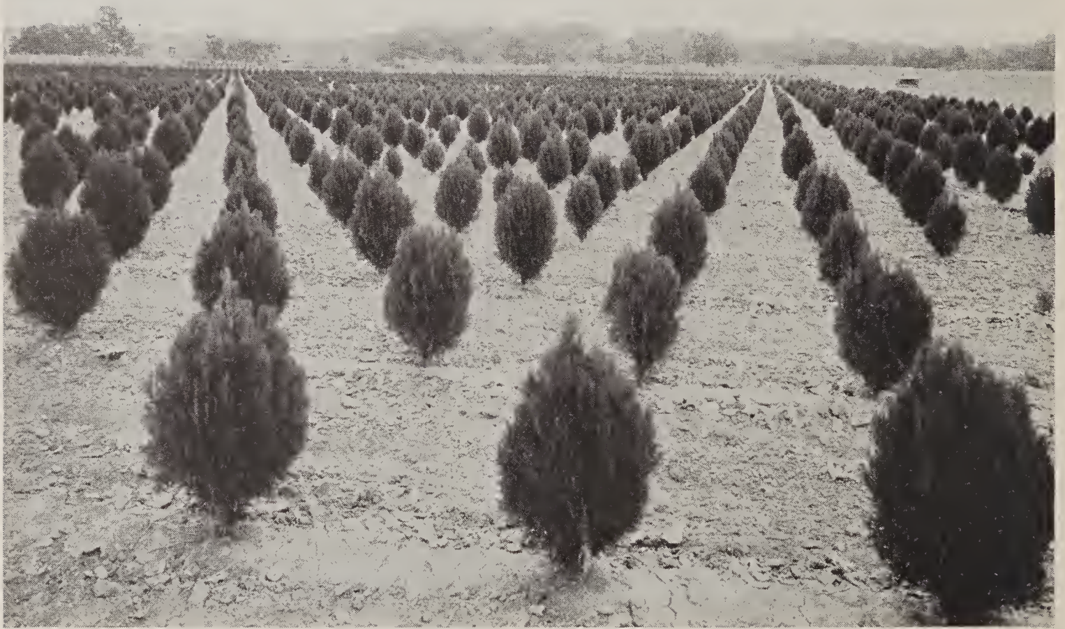
Berckman's Golden Arborvitae