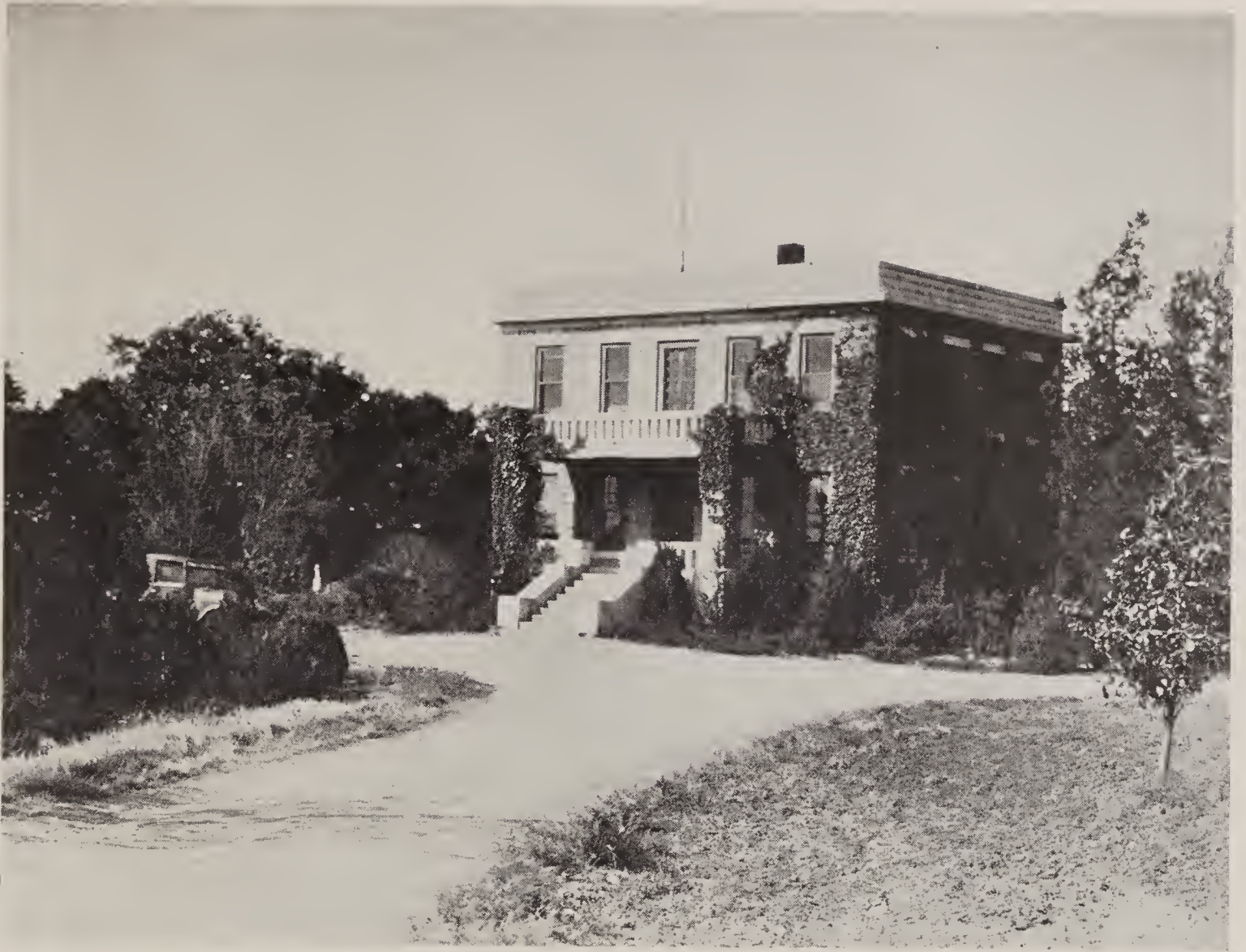
Office Building on Nursery