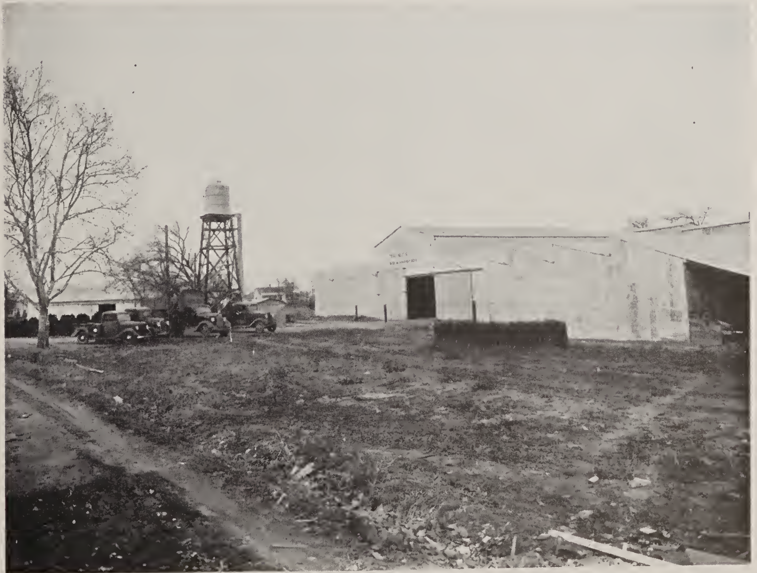
View of Our Packing House

YUCCA, RED ( Hesperaloe parviflora )—a native plant of Southwest Texas. Leaves long, slender and pliant. Flower stalks five to six feet tall are covered with coral red flowers in late summer and fall. A striking and rare plant. Should have some protection in winter by covering with mulch.