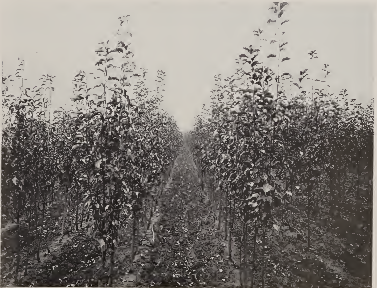
An Extra Fine Block of Pear Trees

WILKINSON —Of Honey or Pallas strain. Large, sweet, and one of the best. Section D.