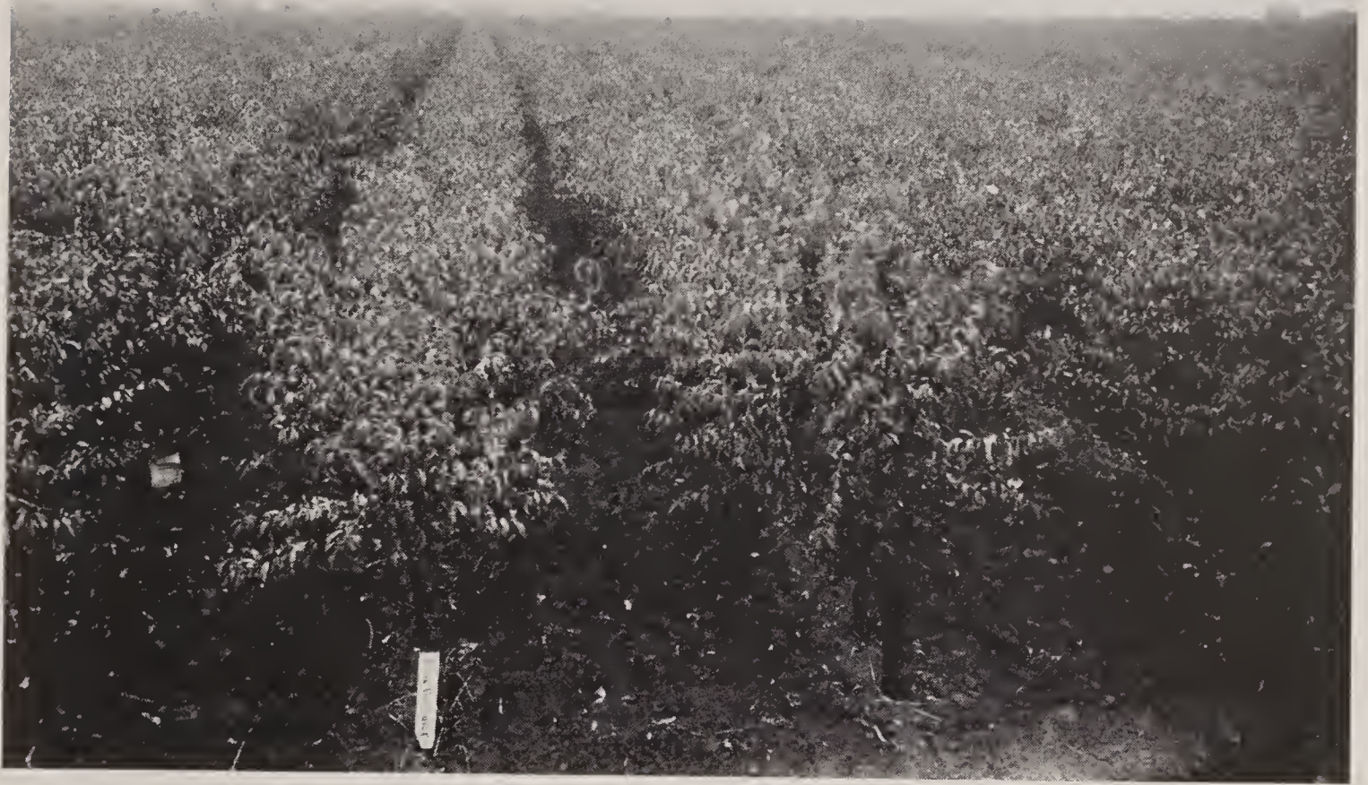
A Field of Peach Trees—We Grow Peach Trees in Quantities