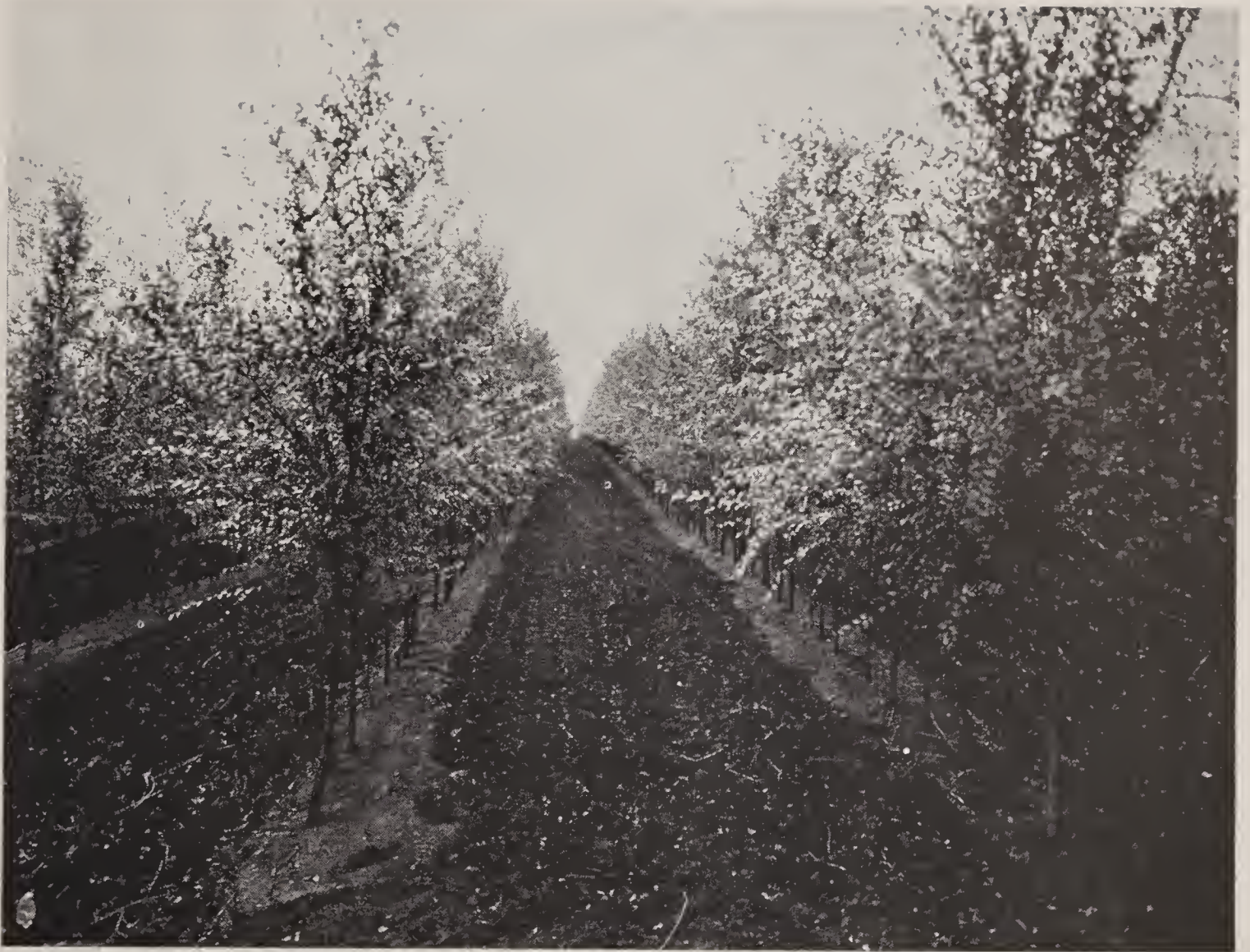
Chinese Elm—A Specialty With Us