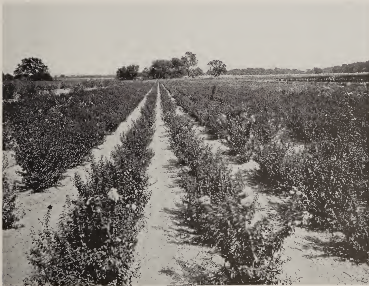
Block of Crape Myrtle