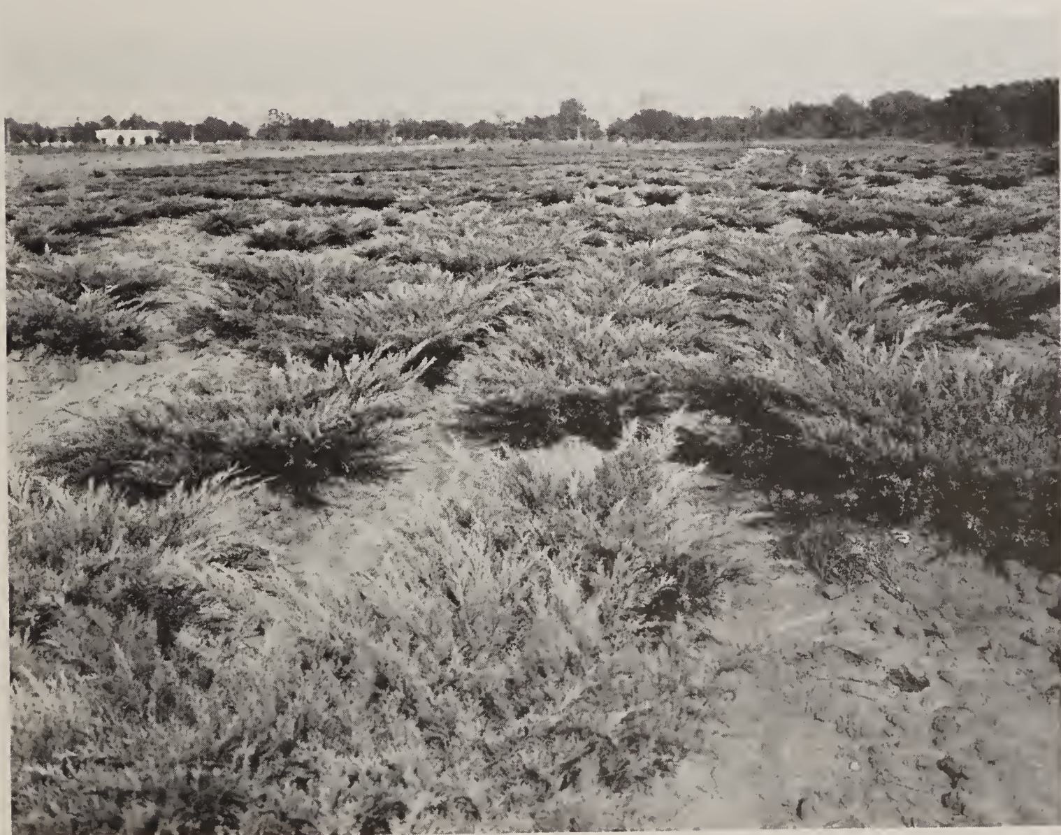
Field of Pfitzer Juniper

PINE, JAPANESE BLACK ( Pinus thunbergi )—A Japanese variety attaining great height, with spreading and somewhat drooping branches, forming a broad, pyramidal head. The needles are stiff, sharp, and bright green.