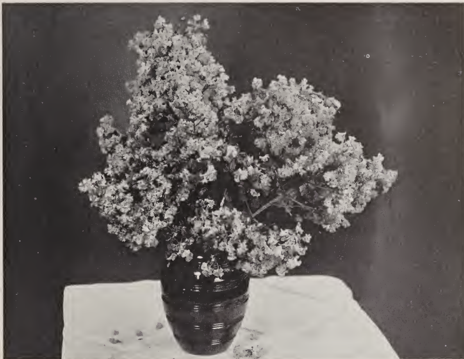
Sprays of Crape Myrtle