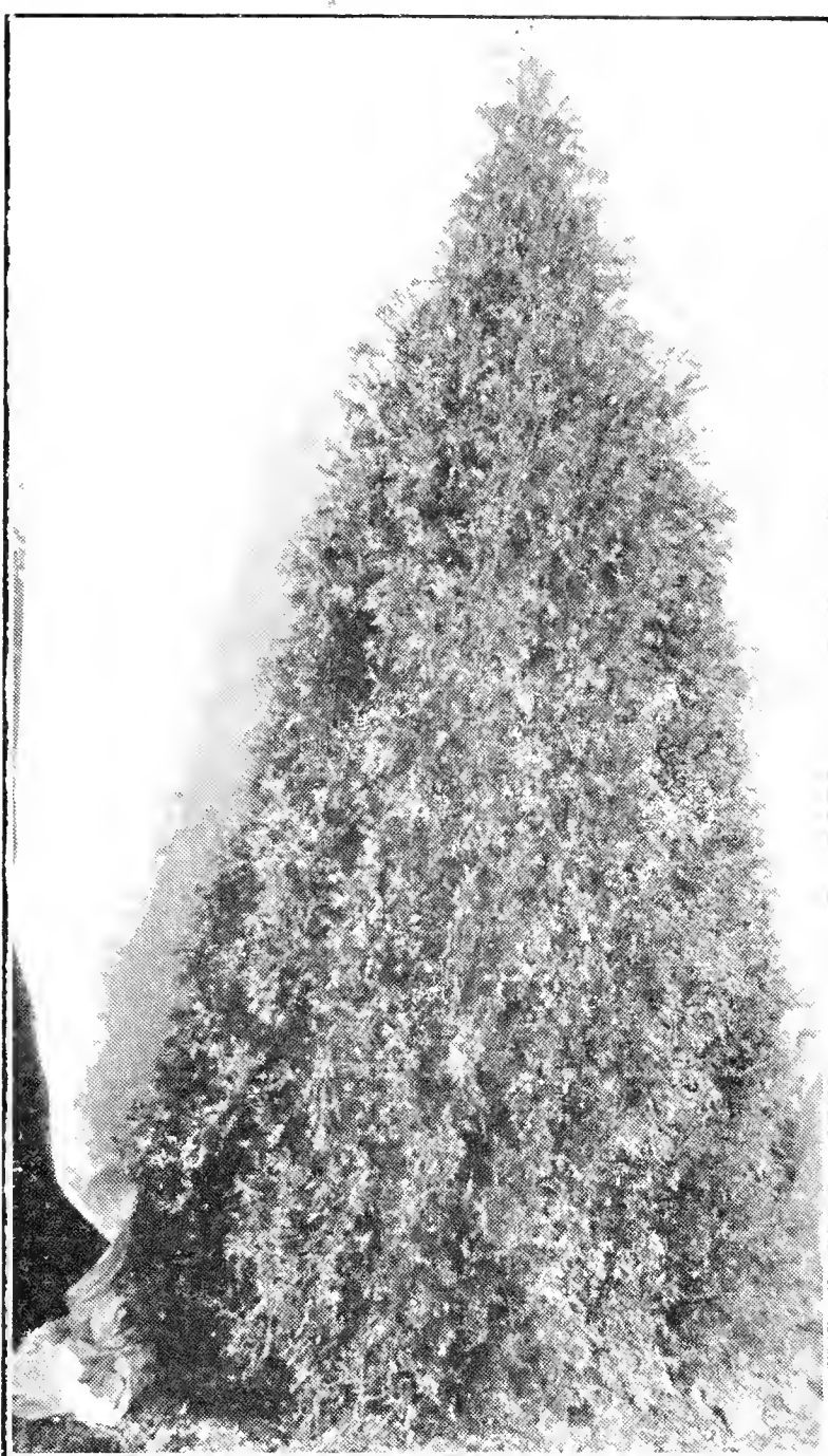
THUJA OCCIDENTALIS 10 to 12 Ft.