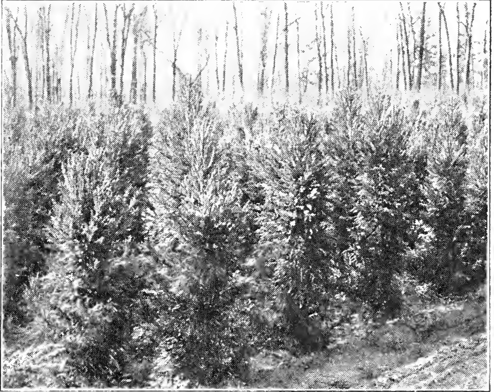
CRYPTOMERIA JAPONICA LOBBI