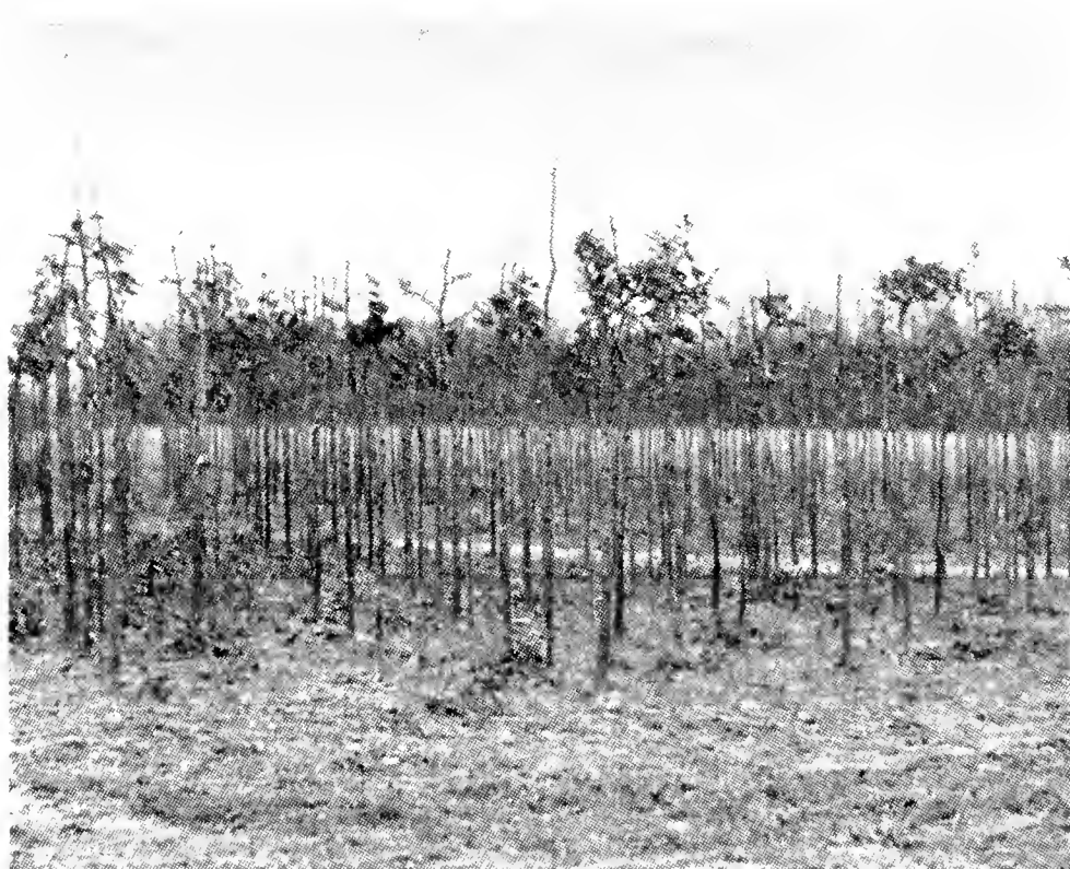
QUERCUS PALUSTRIS AND RUBRA