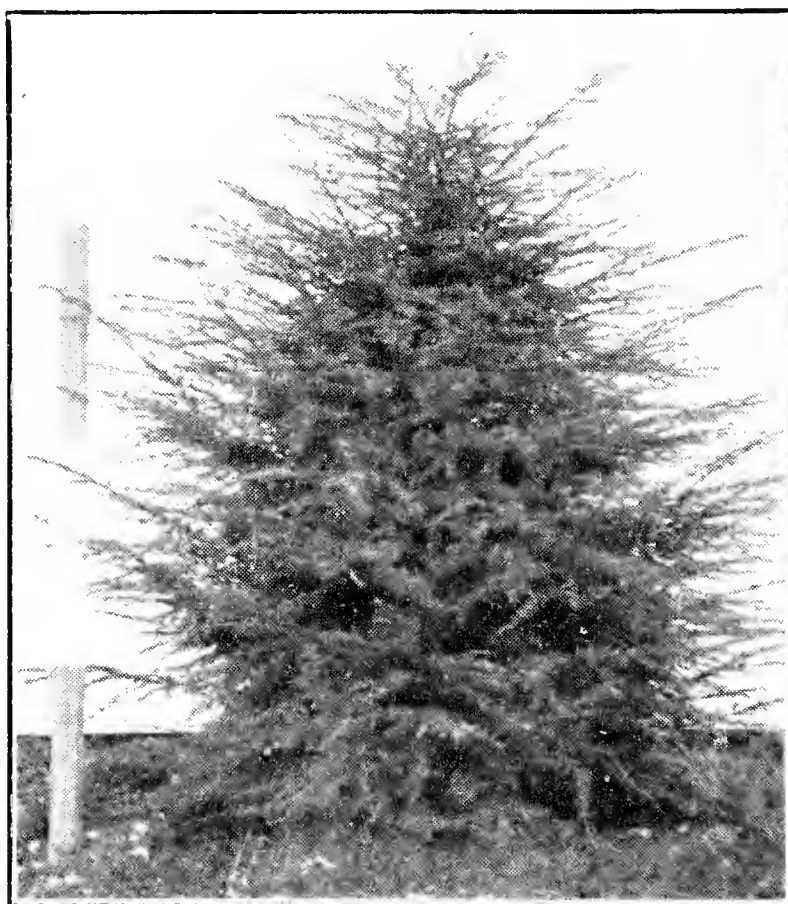
TSUGA CANADENSIS 3 to 4 Ft.