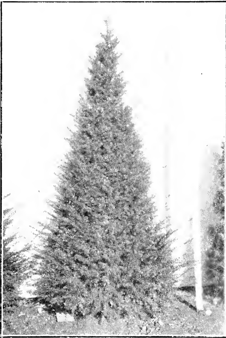
TAXUS CUSPIDATA CAPITATA 6 to 7 Ft.