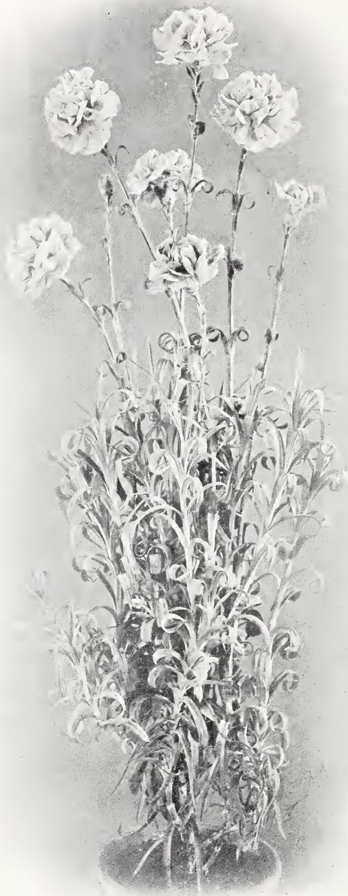
Malmaison—Duchess of Westminster.